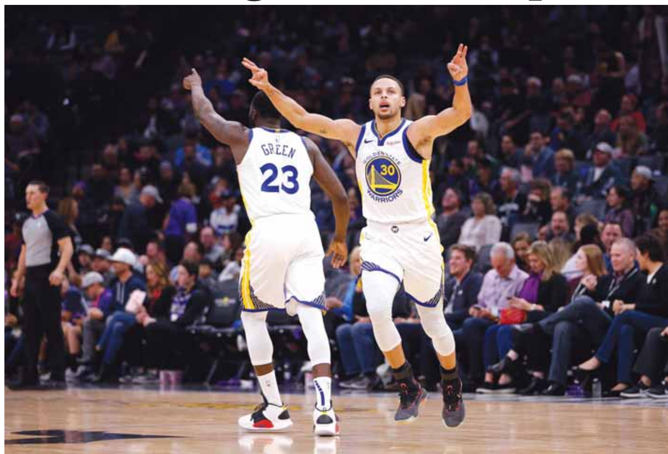
Golden State Warriors guard Stephen Curry (right) reacts after making a three point basket against the Sacramento Kings in the third quarter of their NBA game at Golden 1 Center.

"It's fun for the fans and fun for us sometimes, but it's also tough to watch and tough to play against. But that's what we signed up for."