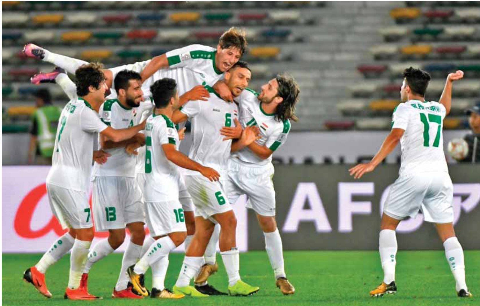
Iraq's Ali Adnan (third from right) celebrates with teammates after scoring a goal during the 2019 AFC Asian Cup group D match against Vietnam in Abu Dhabi yesterday.

'If I am honest, we also need to be even better than we were in the second half, which was obviously better than the first'