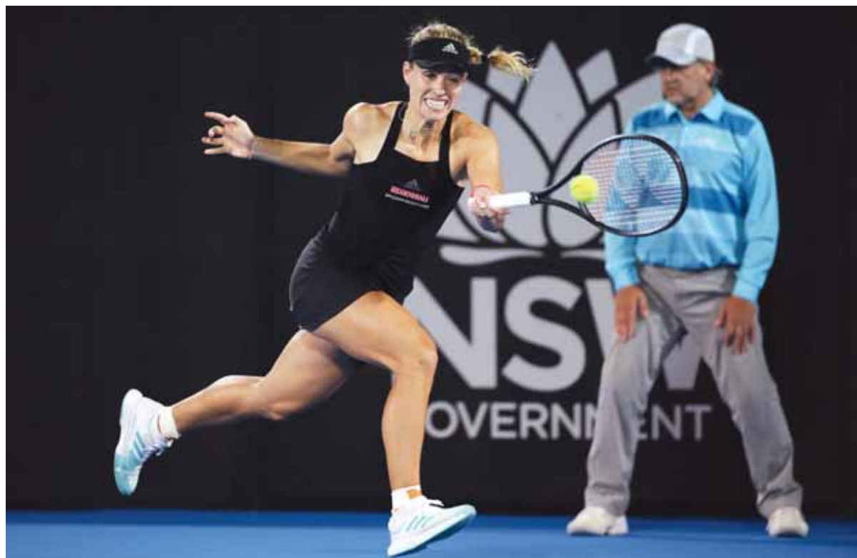
Angelique Kerber from Germany plays a shot to Camila Giorgi from Italy during their second round match at the Sydney International tennis tournament in Sydney yesterday.

Towering Americans Sam Querrey and Reilly Opelka are also through to the next round.