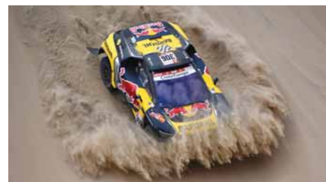
Peugeot driver Sebastien Loeb and co-driver Daniel Elena in action during the ongoing Dakar Rally 2019.

"We started with some electrical problems inside the car: no microphones, no air-conditioning, no wipers, nothing was OK. I lost my concentration a little bit, and after I got stuck in a really bad place," said the Frenchman.