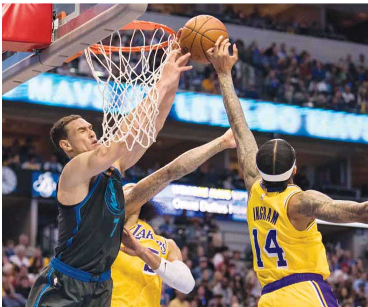
Dallas Mavericks forward Dwight Powell (left) and Los Angeles Lakers forward Brandon Ingram (right) fight for the rebound during the second quarter of their NBA game at the American Airlines Center.

Maker's dunk knotted the score at 92-92 with 8:51 left to play. Antetokounmpo's driving layup and ensuing foul shot gave Milwaukee a three-point