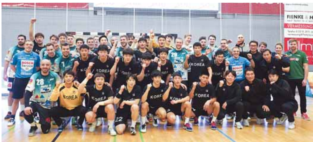
Players of the Korean handball team and of Oranienburger SC pose for a picture after a test match in Oranienburg near Berlin, northeastern Germany on January 7, 2019.

A joint table tennis team followed at last year's worlds along with joint teams in several sports at the Asian Games in Jakarta, and now it is the Handballers turn. Acting upon an initiative from the ruling body IHF, the Koreans have formed a team of 16 players from the South and four from the North - four more than the regular 16-player squads of the other teams. South Korea's best result at the worlds is eighth