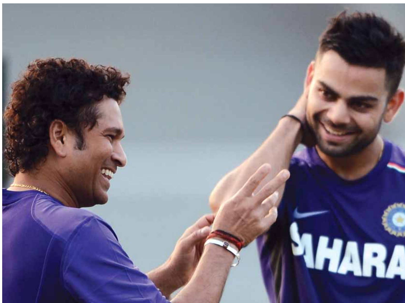
In this file photo taken on November 9, 2012 Sachin Tendulkar speaks with teammate Virat Kohli during a training session at the Cricket Club of India (CCI) in Mumbai.

Kohli last year became the fastest to reach 10,000 runs in ODIs — beating Tendulkar's record