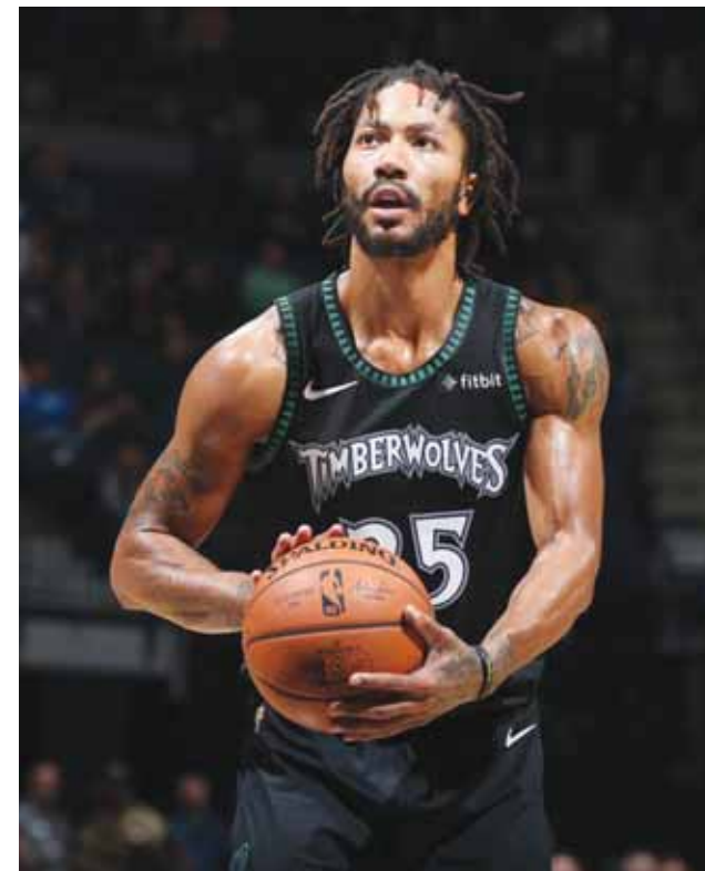
Former NBA Most Valuable Player Derrick Ros.