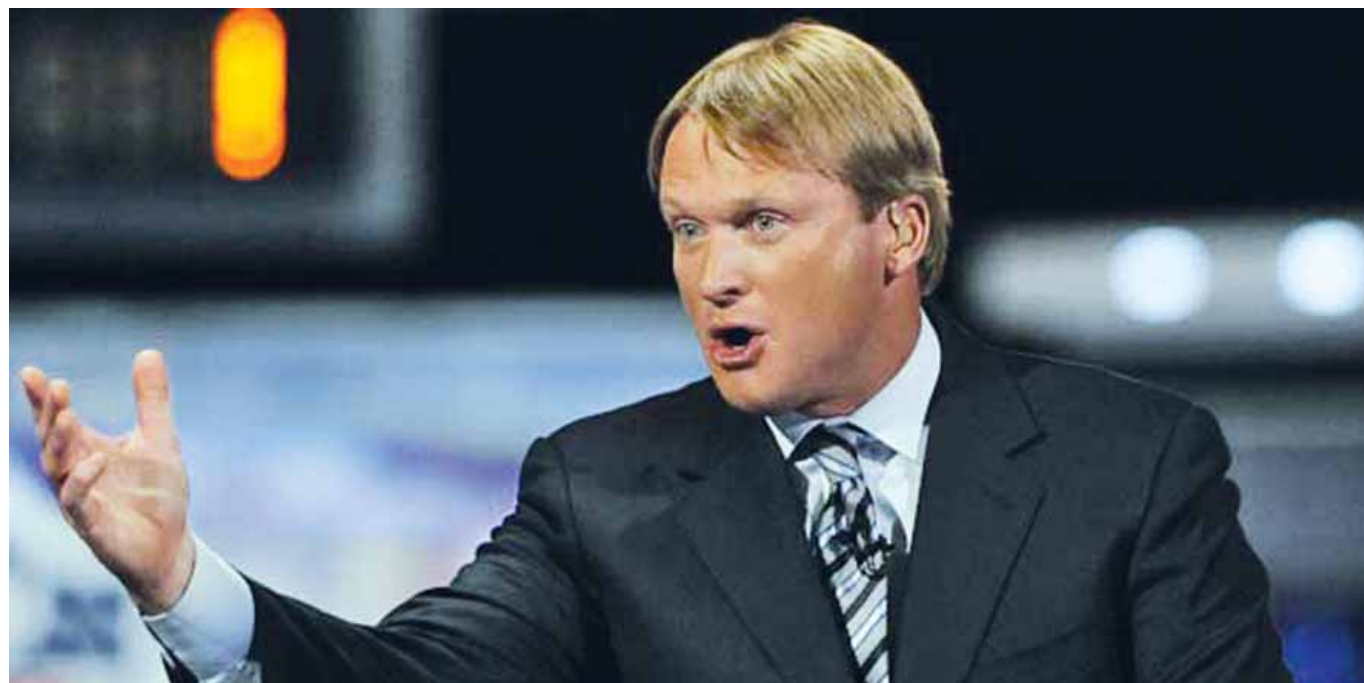
Oakland Raiders coach Jon Gruden.

The Raiders are slated to begin playing in Las Vegas in 2020, but with their lease at the Oakland Coliseum up following the 2018 season and their new stadium in Sin City not ready until 2020, their home for the 2019 season remains uncertain.