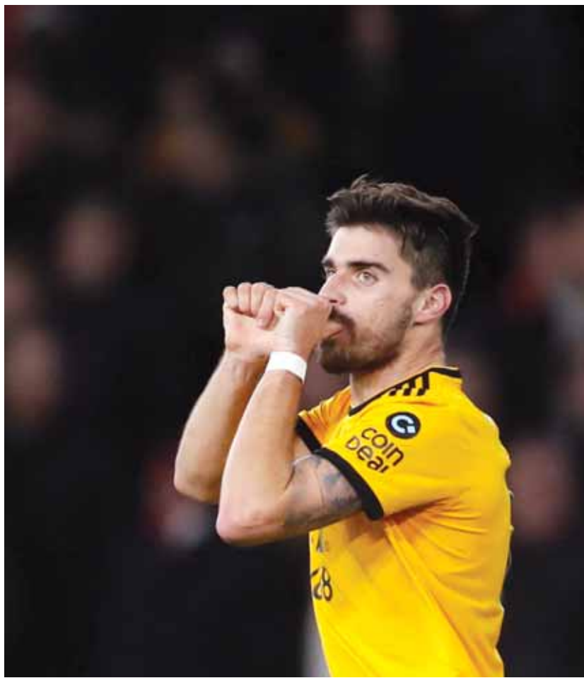
Wolverhampton Wanderers' Ruben Neves celebrates after scoring the winner against Liverpool during their FA Cup match in Wolverhampton on Monday.

erto Firmino and Mohamed Salah but Wolves were able to hold firm and maintain their lead.