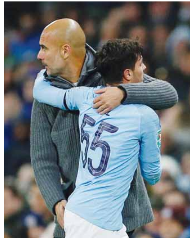
In this November 1, 2018, picture, Manchester City manager Pep Guardiola (left) with Brahim Diaz in Manchester, England.

City will return to league action against Wolverhampton Wanderers on Monday as they continue to chase Liverpool, who are four points clear at the top of the table.