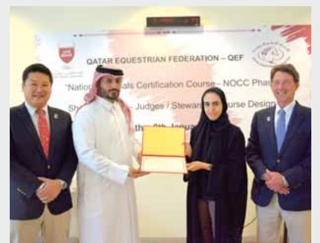
A four-day National Officials Certification Course-Phase 1 for the showjumping officials and course designers was organised by Qatar Equestrian Federation from January 5-8.