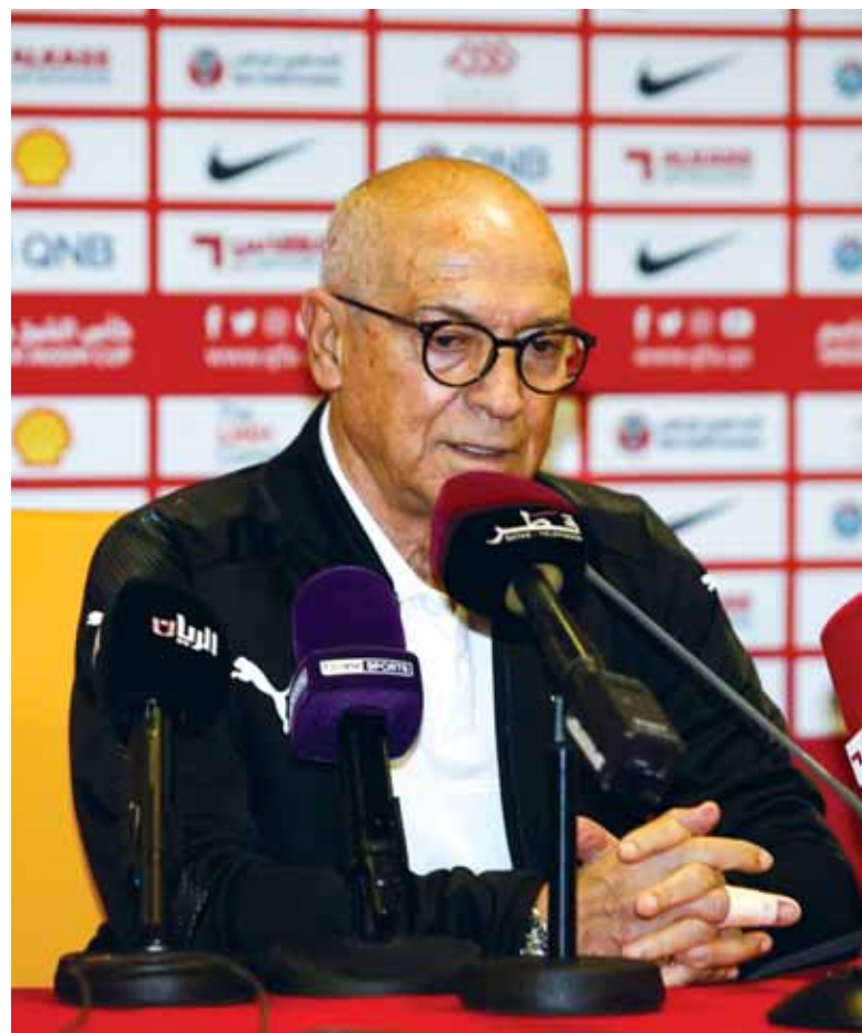
Al Duhail coach Djamel Belmadi (L) and his Al Sadd counterpart Jesualdo Ferreira speaking to journalists ahead of the Sheikh Jassim Cup match today. Belmadi, who won the title last season with Lekhwiya, will be beginning a new chapter in his coaching career with Al Duhail after the merger of Lekhwiya and El Jaish.