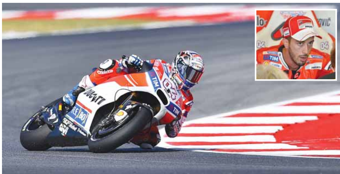
Ducati rider Andrea Dovizioso (also inset) takes part in a practice session for the San Marino Grand Prix race at the Marco Simoncelli Circuit in Misano yesterday.

"In the past the Misano circuit hasn't been too favourable for Ducati, but a couple of weeks back we did a very positive test at this circuit and we are on good form, so we'll be trying to take home the best possible result."