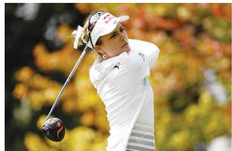
Lexi Thompson of the US hits her tee shot on the 9th hole during the first round of the Indy Women in Tech Championship at the Brickyard Crossing Golf Course in Indianapolis, Indiana, on Thursday.