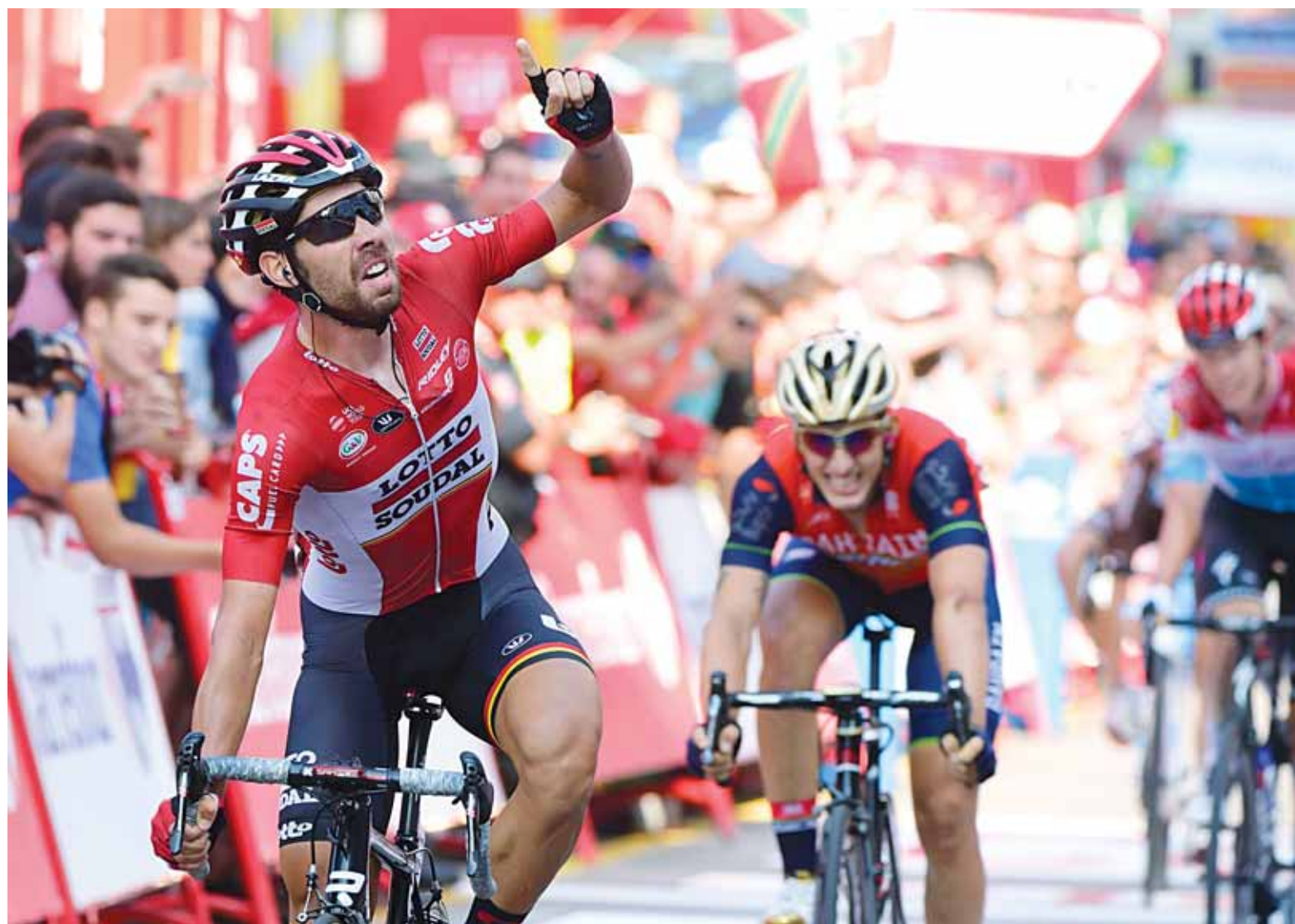
Thomas De Gendt (left) of team Lotto-Soudal celebrates as he crosses the finish line to win the 19th stage of the Vuelta a España in Gijón, Spain, yesterday.

One mountain stage remains before 21-day race ends in Madrid tomorrow