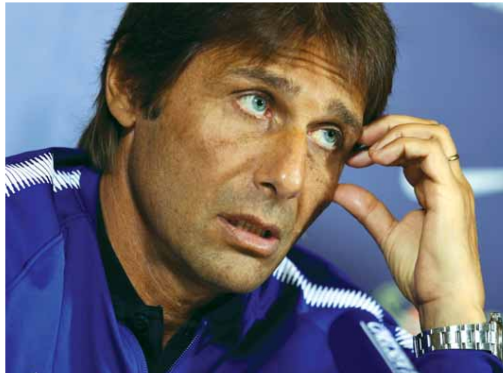
Chelsea manager Antonio Conte during a press conference in London yesterday.

"The transfer market is always a very difficult period for the coach. You wait for new players and sometimes you lose players," Conte said. "For this reason I don't love this period. For me if this period is short, that's good."