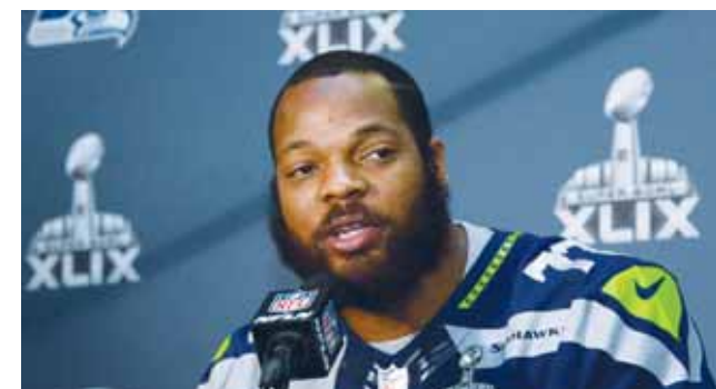
Seattle Seahawks defensive end Michael Bennett.