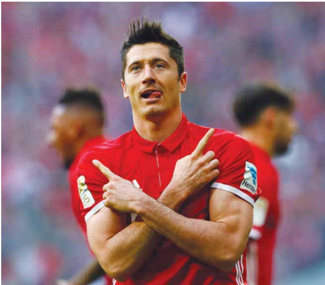
Bayern Munich striker Robert Lewandowski.

football's governing body UEFA should investigate the huge transfers in a thinly-veiled attack on PSG.