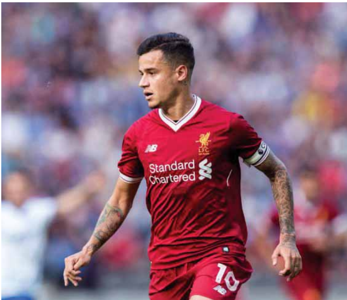
Jurgen Klopp says Coutinho needs more time to be fully match fit.

"Before he went to Brazil he couldn't train for about three weeks so that means we need to try to prepare him for the rest of the season and that is quite difficult with our schedule," said