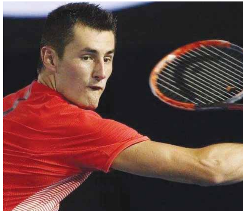
Rafael Nadal is enthusiastic about Serena Williams making a successful comeback after childbirth. At right, Bernard Tomic who blew $40,000 in a party after his US Open exit.

"I need to finish in the top 100, that is my goal and maybe (I have to) push in the next six months to get back to the top 30."