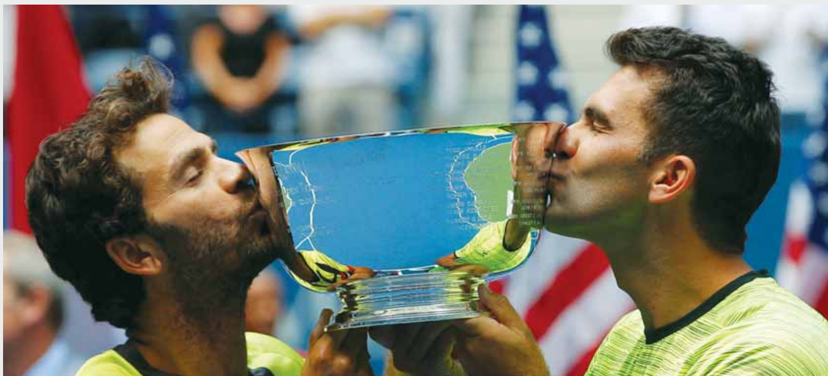
Dutchman Jean-Julien Rojer and Romania's Horia Tecau celebrate winning the men's doubles title after beating Spaniards Feliciano Lopez and Marc Lopez 6-4, 6-3. The number 12 seeds hit 41 winners between them and made just seven unforced errors as they romped to the title in just under an hour and a half.