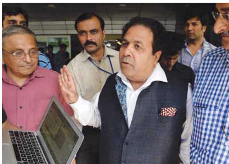
Indian Premier League (IPL) chairman Rajeev Shukla (centre).

The IPL has spawned copycat leagues in Australia, Pakistan and elsewhere, and has already swelled the bank accounts of scores of players, making domestic T20 a lucrative alternative to the international game.