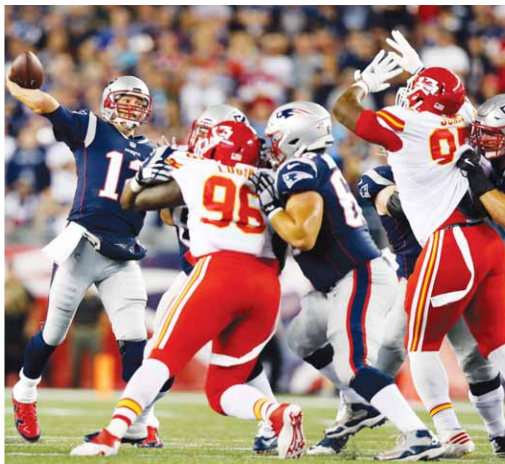
New England Patriots quarterback Tom Brady (left) passes the ball against the Kansas City Chiefs during the second quarter at Gillette Stadium.