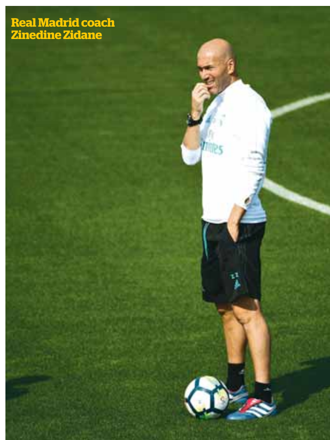
Real Madrid coach Zinedine Zidane

"Barca would be a super-Ajax. It would stop being a great European club, that's for sure."