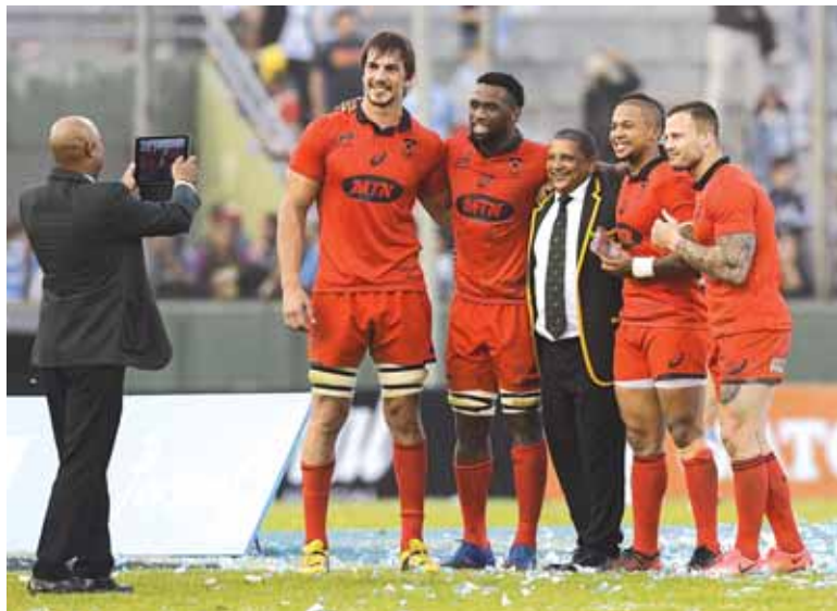
Coach Allister Coetzee's (third from right) Springboks are unbeaten in the southern hemisphere championship after home and away wins over Argentina.

match awards in both wins over the Pumas in Port Elizabeth and Salta and is looking at another tip top performance against the Wallabies.