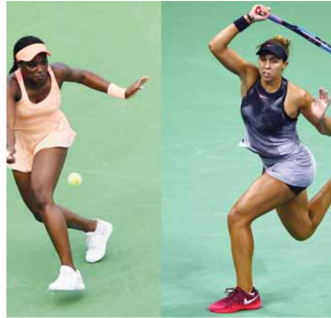
Sloane Stephens (L) and Madison Keys of the United States.

F ive facts about today's US Open women's final between Americans Sloane Stephens and Madison Keys at Arthur Ashe Stadium: