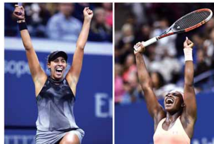
This combination of two photos taken on September 7, 2017 show US tennis players Madison Keys (L) and Sloane Stephens celebrating after winning their semi-finals matches.