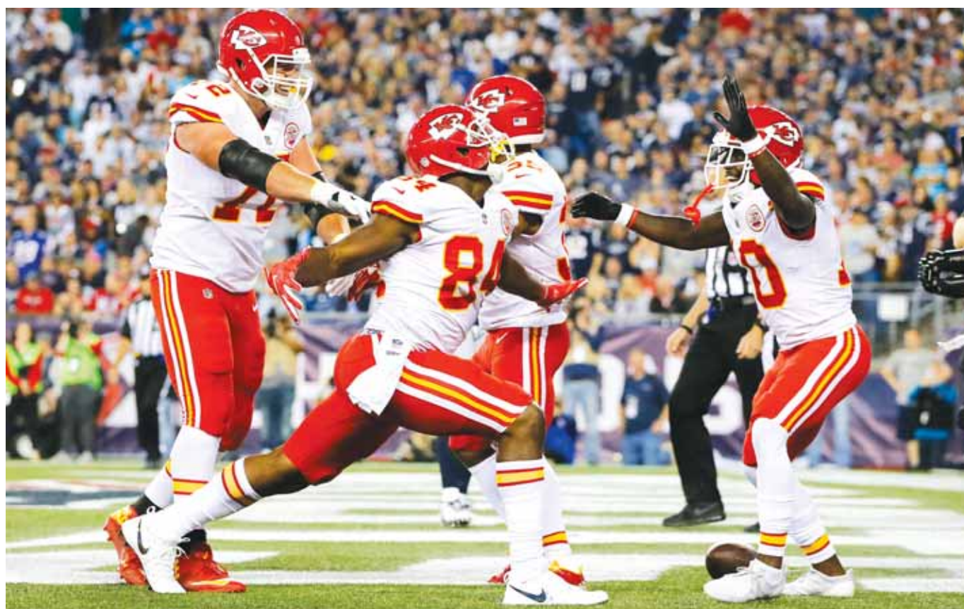
Kansas City Chiefs tight end Demetrius Harris (centre) and wide receiver Tyreek Hill (right) and offensive tackle Eric Fisher (left) celebrate a first quarter touchdown against the New England Patriots at Gillette Stadium.

Brady was quickly into his groove, leading a nine-play, 73-yard drive that culminated with Mike Gillislee's two-yard touch-