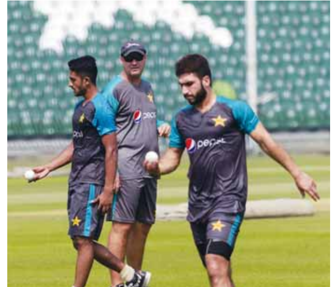
Pakistan coach Mickey Arthur (centre) watches bowlers Hasan Ali (left) and Usman Shinwari during a practice session at the Gaddafi Cricket Stadium in Lahore yesterday.

Pakistan is preparing to deploy several thousand security forces in Lahore for the series, scheduled to begin on September 12.