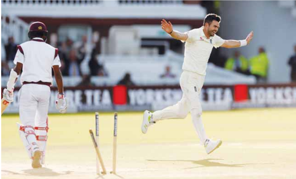
England's James Anderson celebrates the wicket of West Indies' Kraigg Brathwaite, his 500th Test wicket, on second day of the third Test at the Lord's cricket ground in London yesterday.