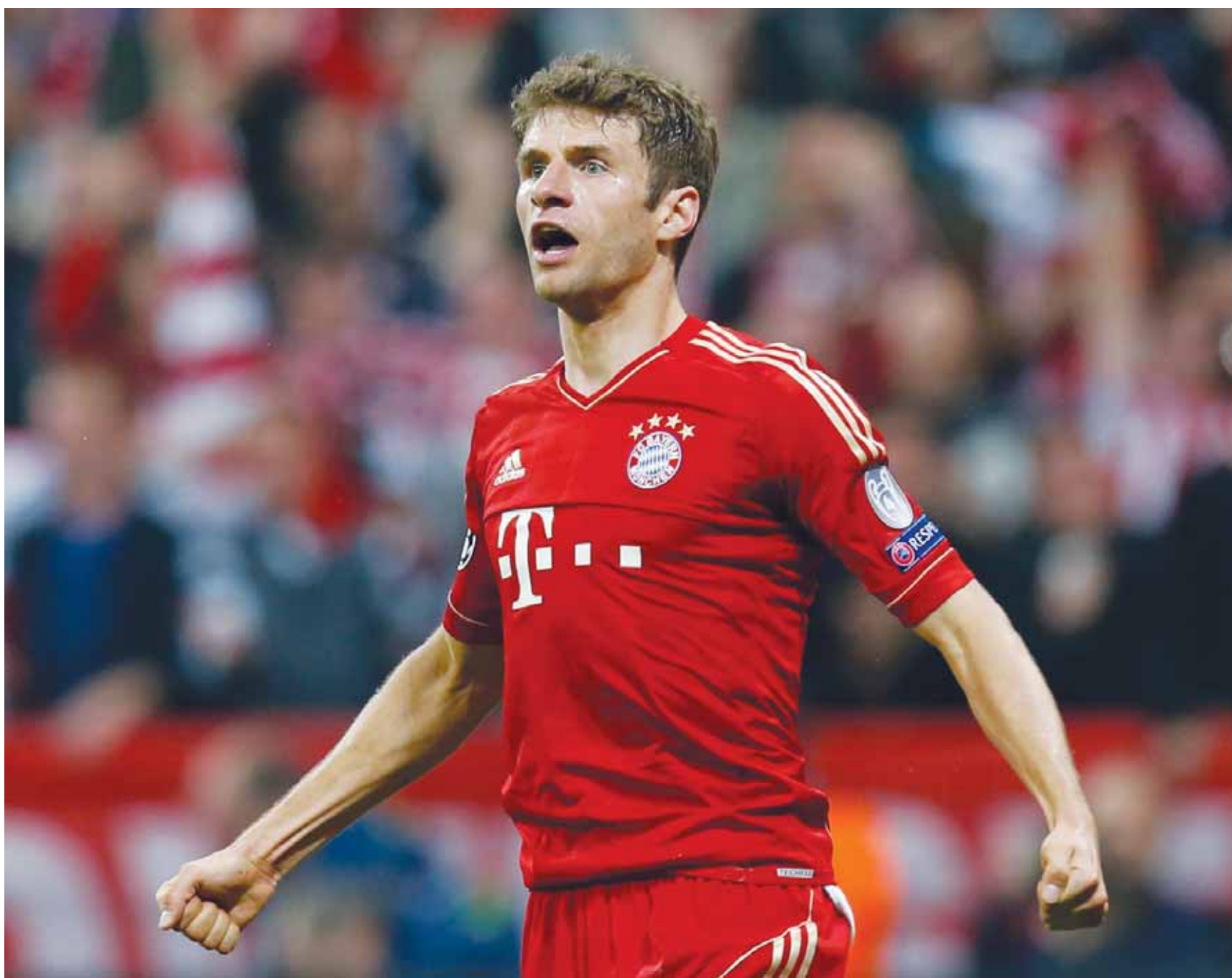
Thomas Müller is struggling for a place in Bayern's starting line-up under Carlo Ancelotti.

'I don't know what qualities exactly the coach wants to see from me'