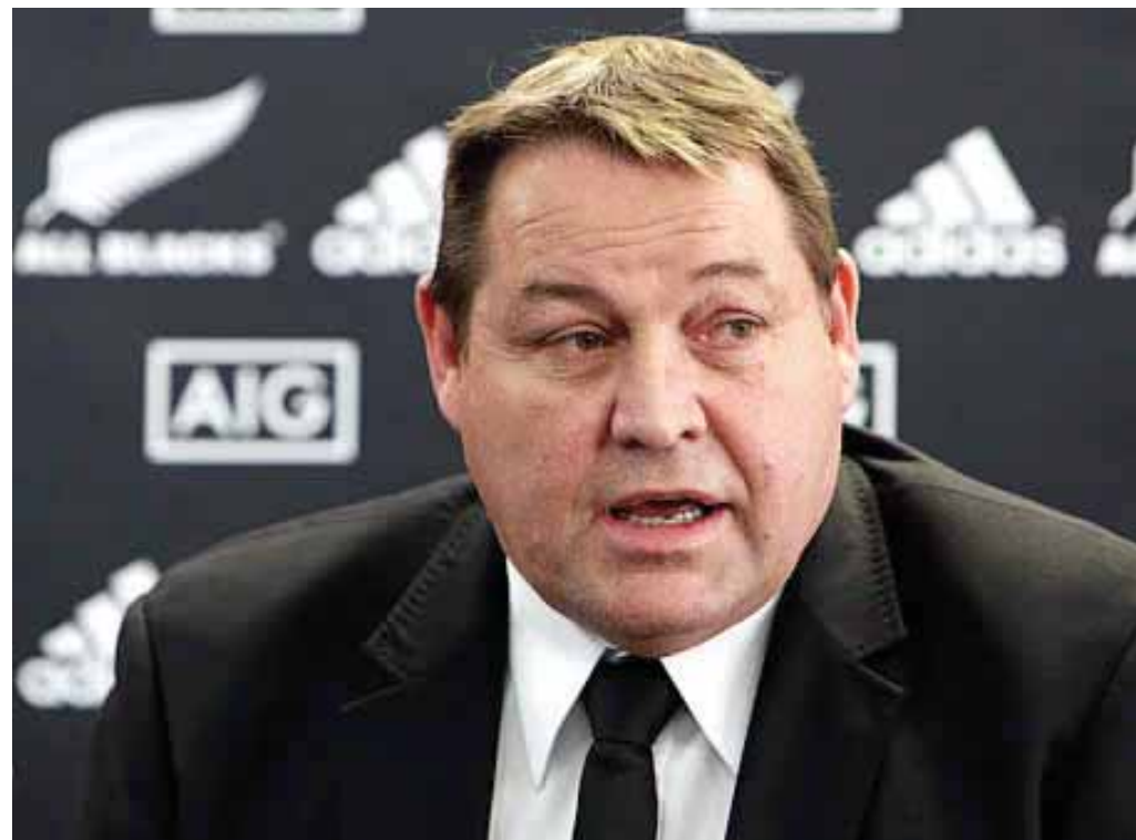
All Blacks coach Steve Hansen.

But against an Argentina side already beaten 37-15 and 41-23 by the Springboks, there would appear to be room to hone their skills.