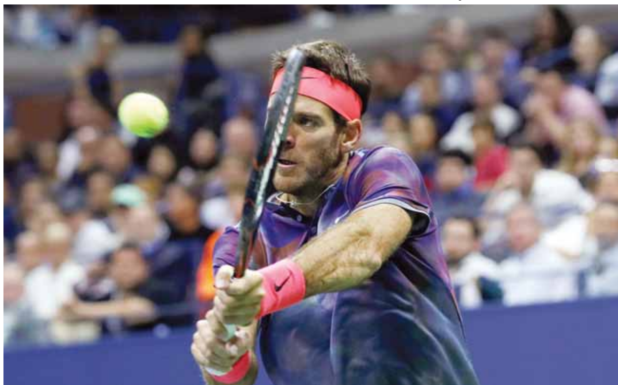
Juan Martin del Potro of Argentina in action against Roger Federer of Switzerland on Wednesday.

However, the match turned in the third set tiebreak when Del Potro saved four set points before a weary and error-riddled Federer dropped serve again to trail 3-2 in the fourth. Victory was Del Potro's eight minutes short of three hours with a deep