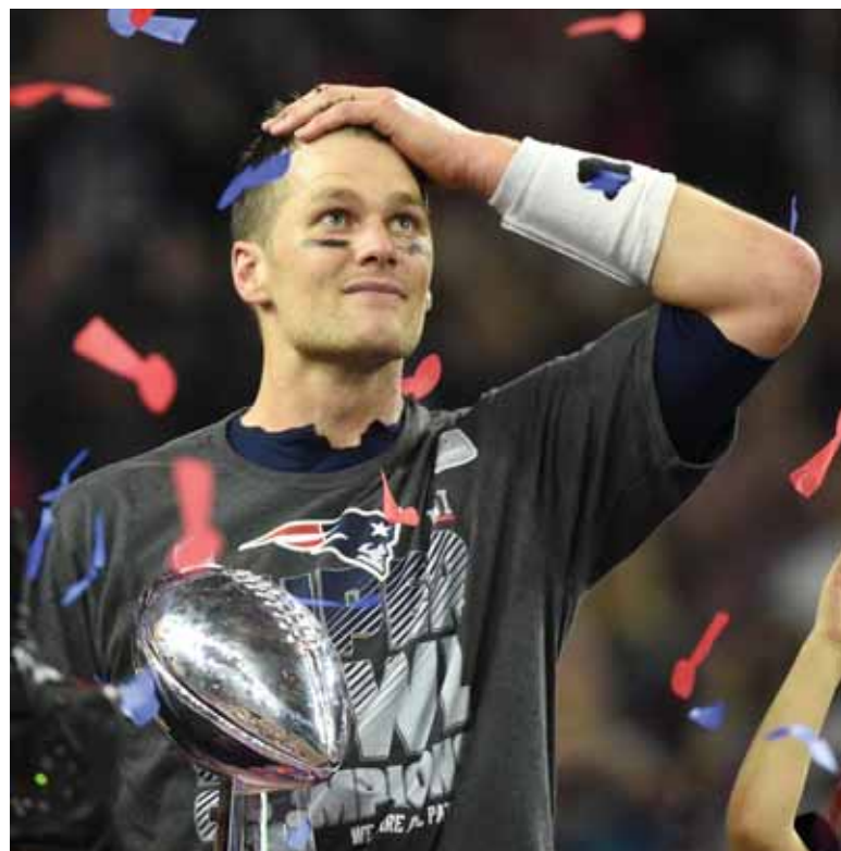
In this February 5, 2017, picture, Tom Brady of the New England Patriots reacts after defeating the Atlanta Falcons to win Super Bowl 51 in Houston, Texas.

"This review identified no evidence of any deviation from the Protocol by