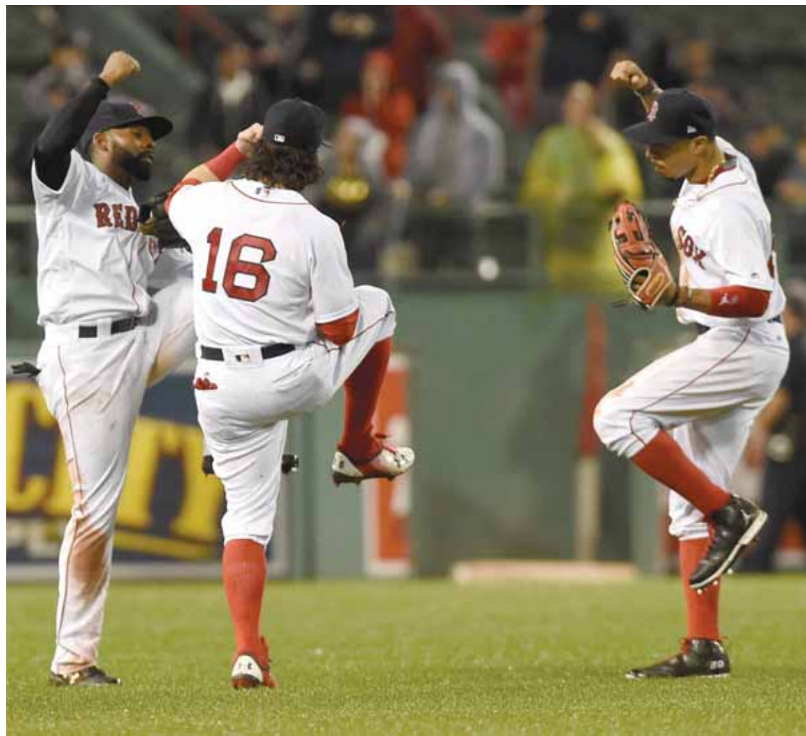
Boston Red Sox's Andrew Benintendi (Centre), Jackie Bradley Jr. (left) and Mookie Betts celebrate their win over the Toronto Blue Jays at Fenway Park in Boston, Massachusetts, on Wednesday.

Bradley might have taken the prettiest swing of the series later in the inning, connecting on a high-and-outside fastball and pulling it over