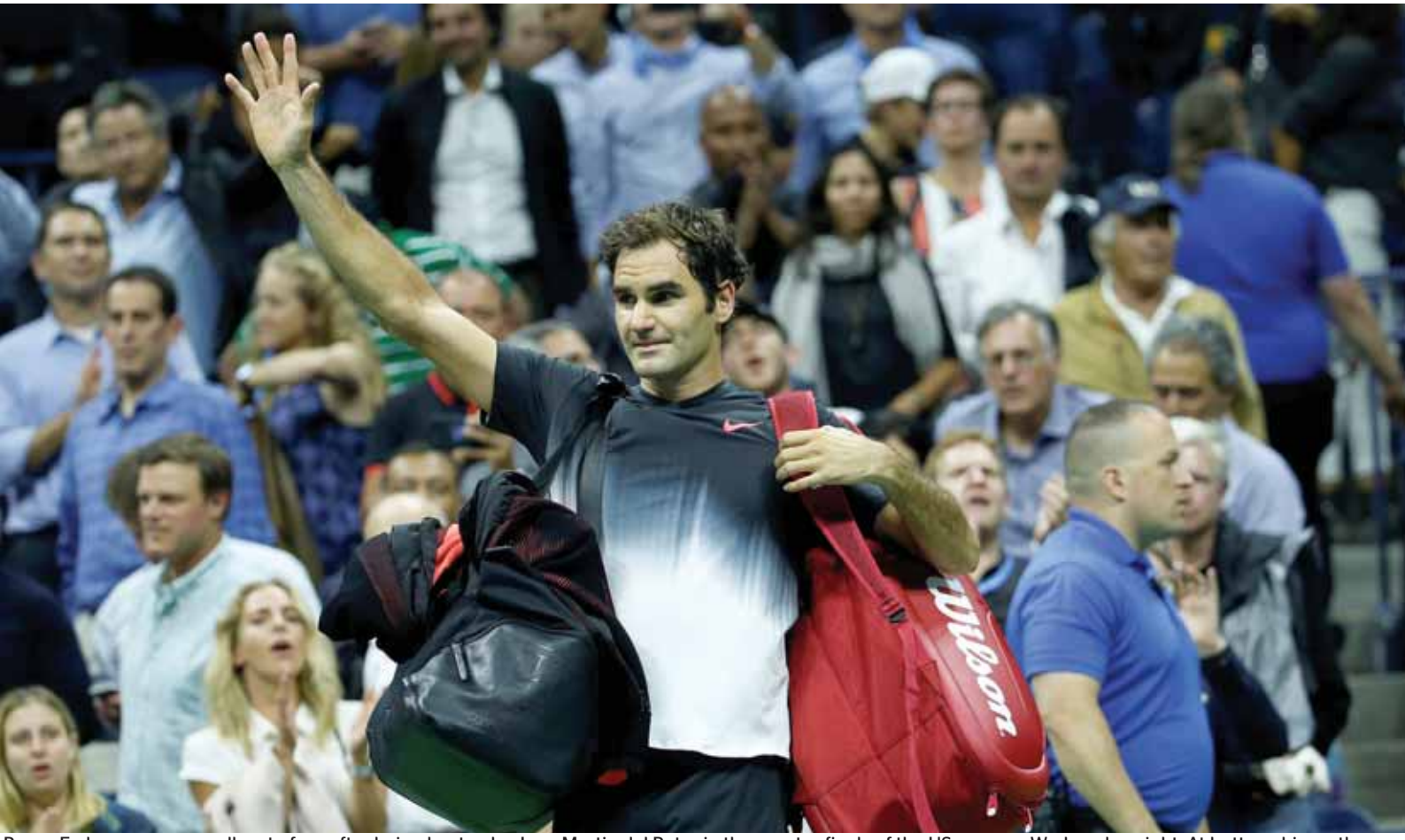
Roger Federer waves goodbye to fans after being beaten by Juan Martin del Potro in the quarter-finals of the US Open on Wednesday night. At bottom, his mother and wife react during the match.

'It's better I'm out and somebody else gets a chance to do better than me'