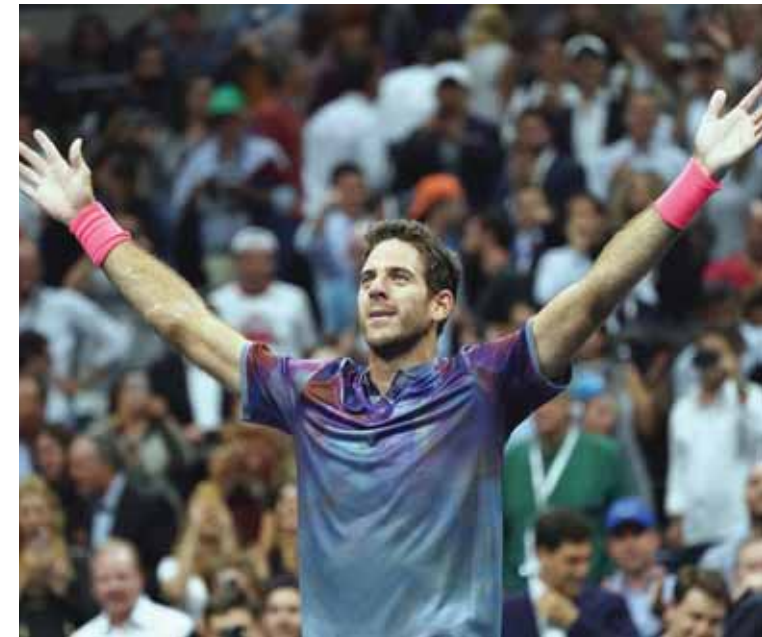
Juan Martin del Potro celebrates his win over Roger Federer on Wednesday.