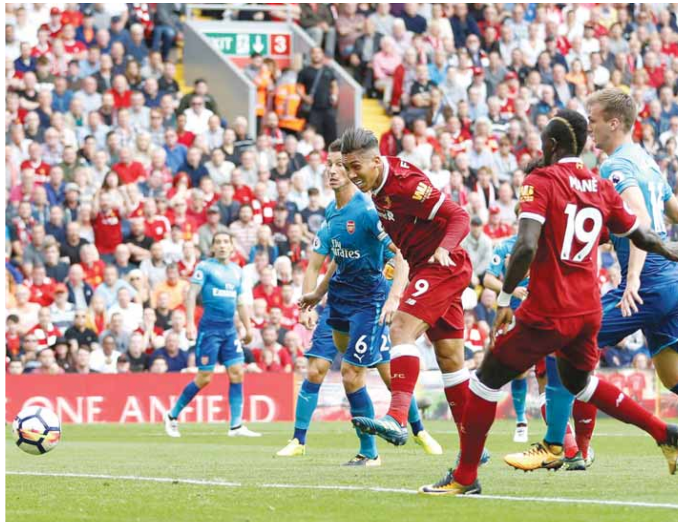
Liverpool's Roberto Firmino scores a goal against Arsenal on August 27.

The rising stock of midfielder Jordan Henderson, who has captained England twice in the past week, and a superb goal for teenager Ben Woodburn on his Wales debut means the continued uncertainty surrounding Philippe Coutinho and his desire to join Barcelona is a manageable distraction. No wonder pundits are taking Liverpool seriously.