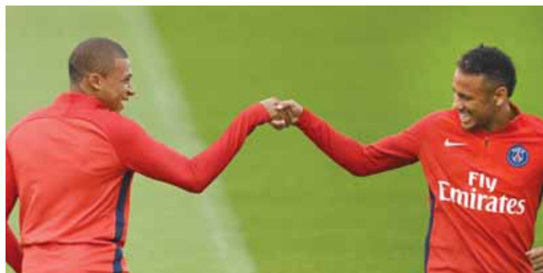
Mbappe (L) with Neymar during a PSG training session yesterday.

"It's extremely ambitious and wants to become the best. It's putting everything in place to make that goal more