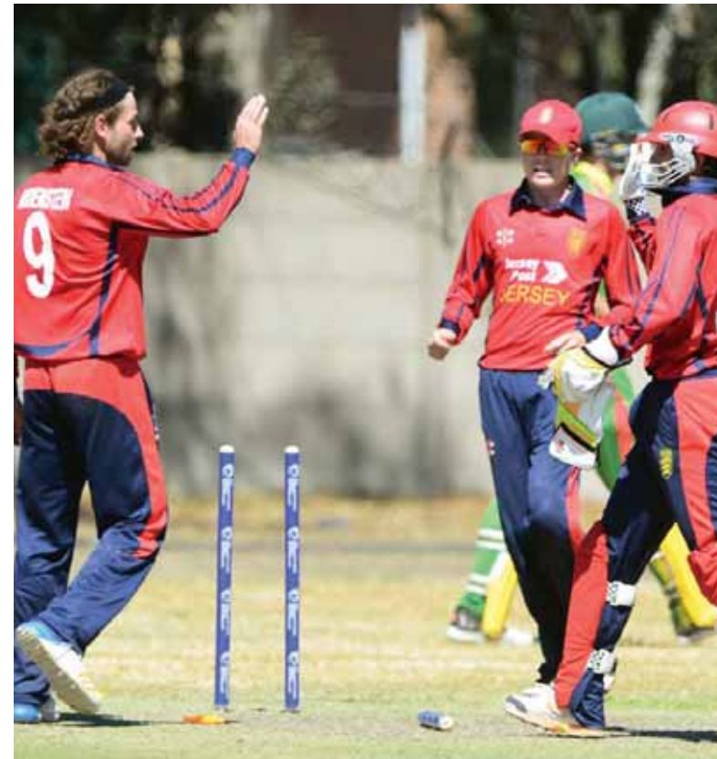
Jersey players celebrate a wicket during their match against Qatar yesterday. Jersey will now face Vanuatu in the ICC World Cricket League Division 5 final tomorrow.

The last match of another exciting day to finish came at Willowmoore A where Germany chased down Cayman Islands to win by five wickets.