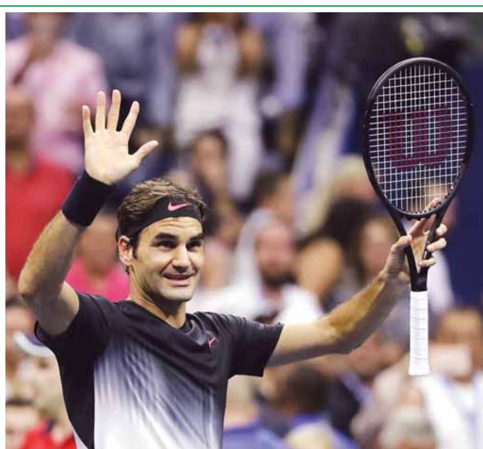
Roger Federer of Switzerland celebrates his win over Philipp Kohlschreiber of Germany in their fourth round US Open match at the USTA Billie Jean King National Tennis Centre.