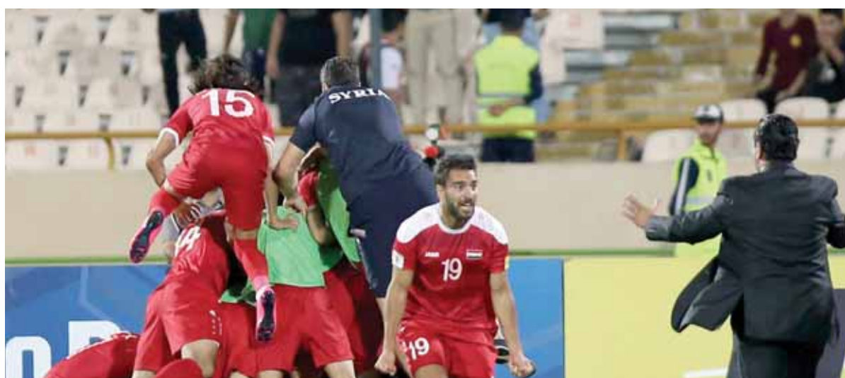
Syria's players celebrate at the end of their FIFA World Cup 2018 qualification football match against Iran at the Azadi Stadium in Tehran yesterday.

South Korea spurned several late chances before settling for a 0-0 draw in Uzbekistan, grabbing the second automatic qualifying spot in Group A as their