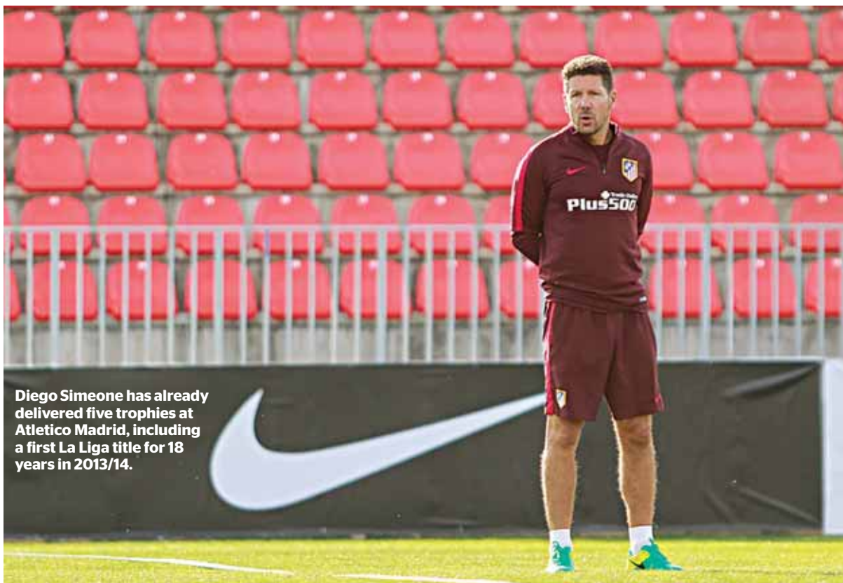
Diego Simeone has already delivered five trophies at Atletico Madrid, including a first La Liga title for 18 years in 2013/14.

Atletico were seconds away in the 2014 final before Sergio Ramos's injury-time header forced extra-time and Real ran out 4-1 winners. Two years later, penalties were needed to separate the two in Milan in a defeat so painful Simeone described it as a "death". Simeone was tempted to walk away last summer.