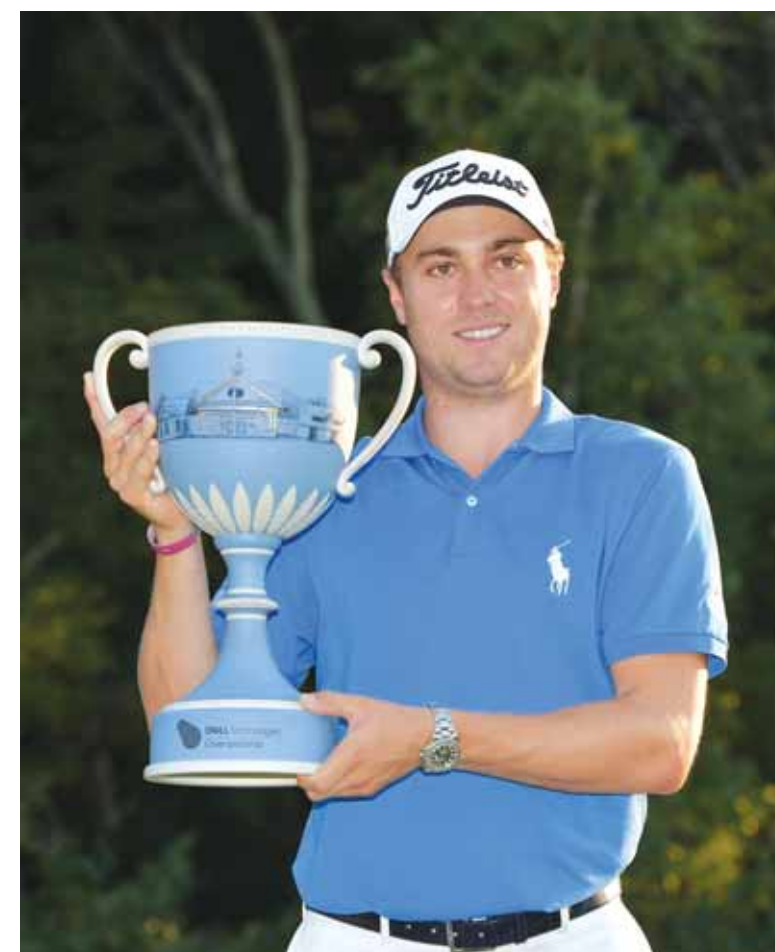
Justin Thomas of the United States poses with the trophy after winning the Dell Technologies Championship at TPC Boston on Monday in Norton, Massachusetts.