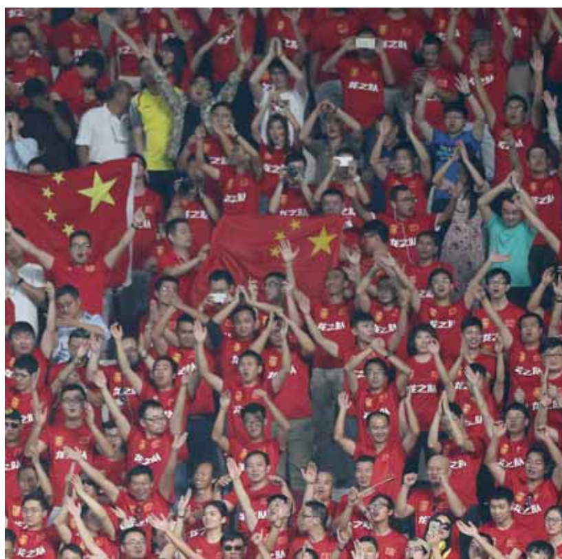
Chinese fans cheer their team during their match against Qatar in Doha yesterday. At bottom, Qatar's Akram Afif (L) is congratulated by Karim Boudaif after he scored for his team.

That appeared to end just six minutes later however when Zheng was red-carded after he fouled Afif, who was clean