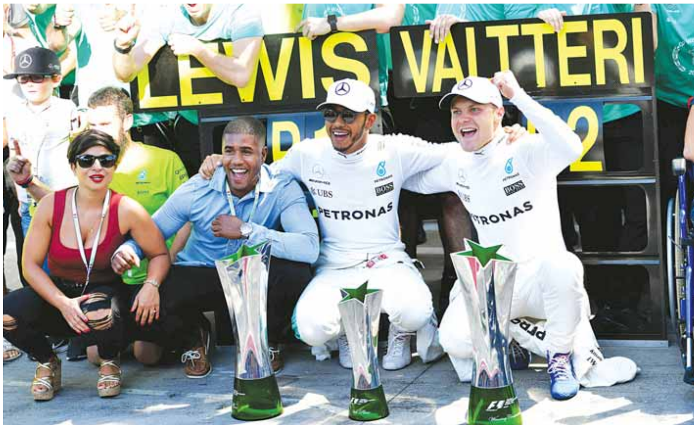
Winner Mercedes' British driver Lewis Hamilton (2R) and second placed Mercedes' Finnish driver Valtteri Bottas celebrate with team members after the Italian Formula One Grand Prix at the Autodromo Nazionale circuit in Monza on September 3, 2017.

"It's like an ERS pack. Towards the end of the season, you're running on the low end of the battery pack, whereas I'm