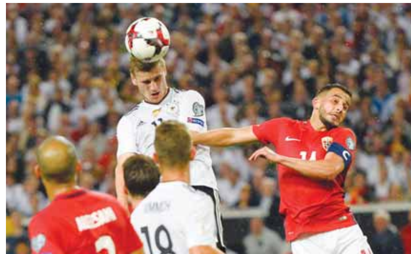
Germany's Timo Werner (centre) rise above the Norwegian defence to head in his side's fourth goal during the World Cup qualification match on Monday night.

Germany's all-time top-scorer Miroslav Klose retired after the 2014 World Cup. Klose, who now coaches Germany's strikers, netted 71 goals in 137 games to finally beat Gerd Mueller's phenomenal record of 68 goals in 62 matches for West Germany between 1966-1974.