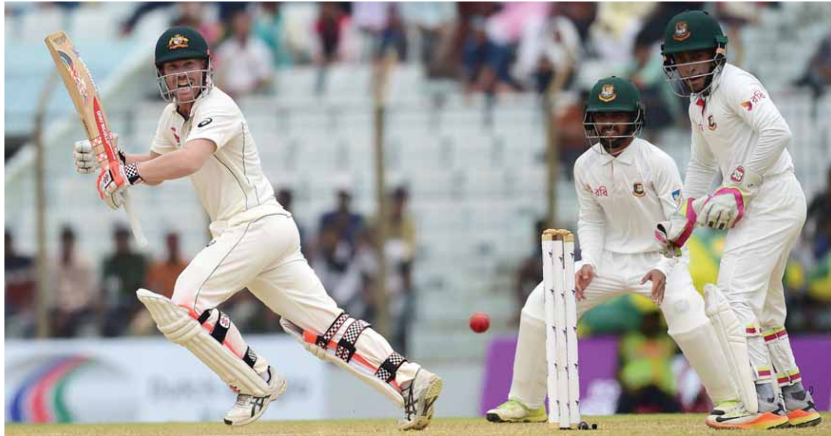
Australian batsman David Warner (left) plays a shot as Bangladesh captain Mushfiqur Rahim (right) and Mominul Haque look on during the second day of the second Test at Zahur Ahmed Chowdhury Stadium in Chittagong yesterday.

Visitors were 225-2 at stumps in their first innings, trailing Bangladesh by 80 runs