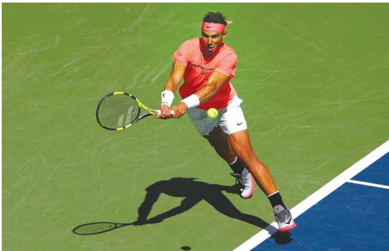
Rafael Nadal of Spain returns a shot against Alexandr Dolgoplov of Ukraine during their fourth round US Open match at the USTA Billie Jean King National Tennis Centre.

"You can ask me about that in two days if I am here with victory and I will answer you with a lot of great pleasure if that happens," Nadal said.