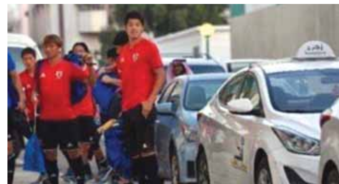
Japanese players wait for taxis outside Jeddah airport.