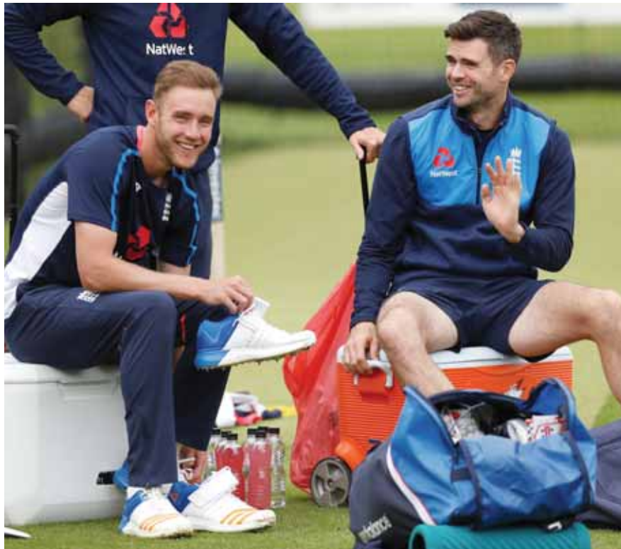
England seamers James Anderson (right) and Stuart Broad share a joke during the nets session at the Lord's cricket stadium in London yesterday.

"We thought we could build on that and close out the series at Headingley. As bowlers we were confident we could bowl them out, but full credit to the West Indies — I thought they played fantastically well that last day. I thought the West Indies came back very strong, which we expected them to do, and we didn't play at our best at all, which is really frustrating for us as we are trying to build momentum. But it makes for an exciting Test match here, a decider. That