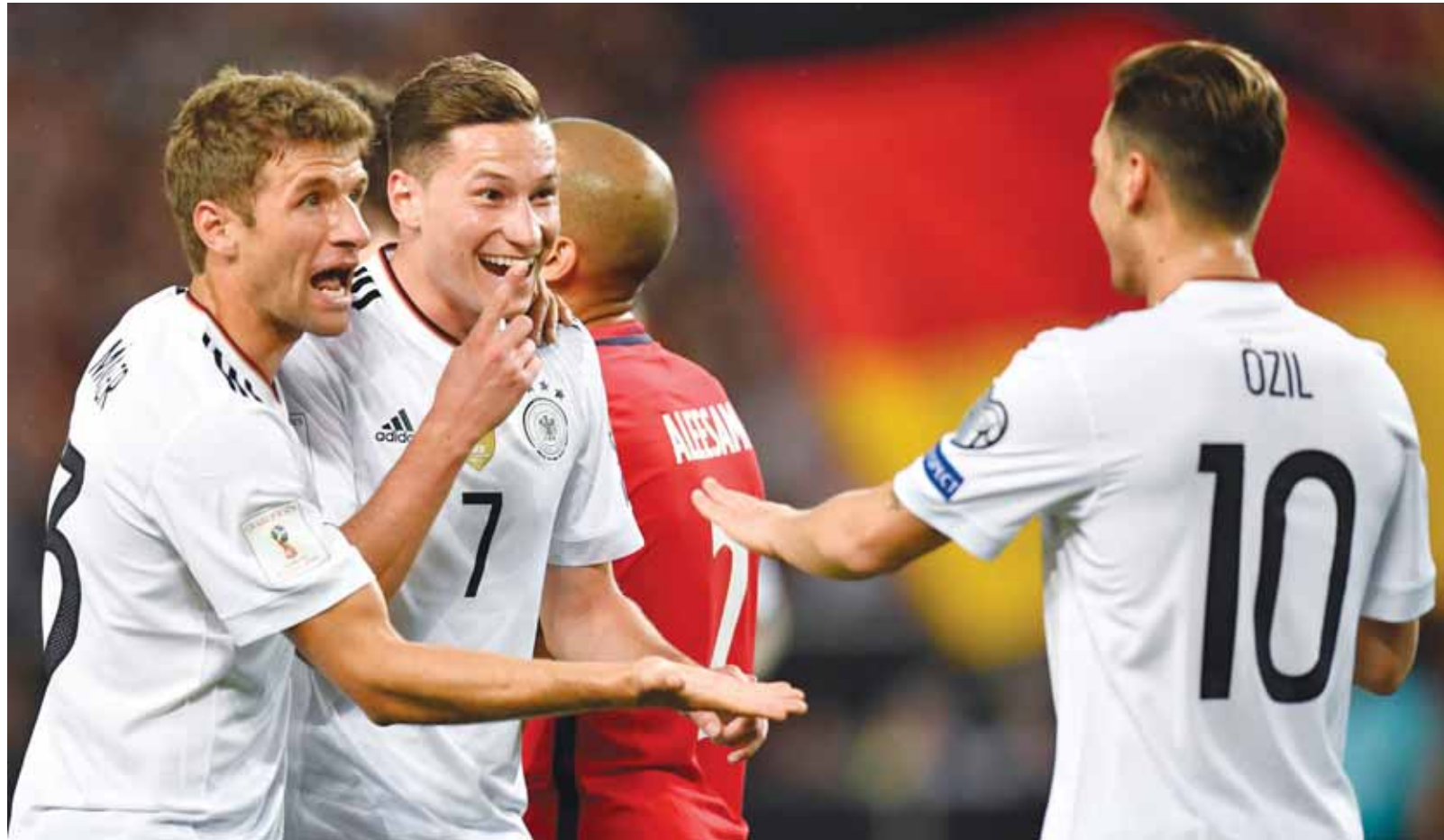
Germany's Julian Draxler (second left) celebrates after scoring a goal with teammates Thomas Mueller (left) and Mesut Ozil during the FIFA World Cup 2018 qualification match against Norway in the south German city of Stuttgart on Monday night.

"That showed the beautiful side of football," said head coach Loew, who had said Friday's scenes in Prague "shamed Germany", following Werner's ovation after his two goals. "It was a huge amount of fun to play here and we played our part in that with some great