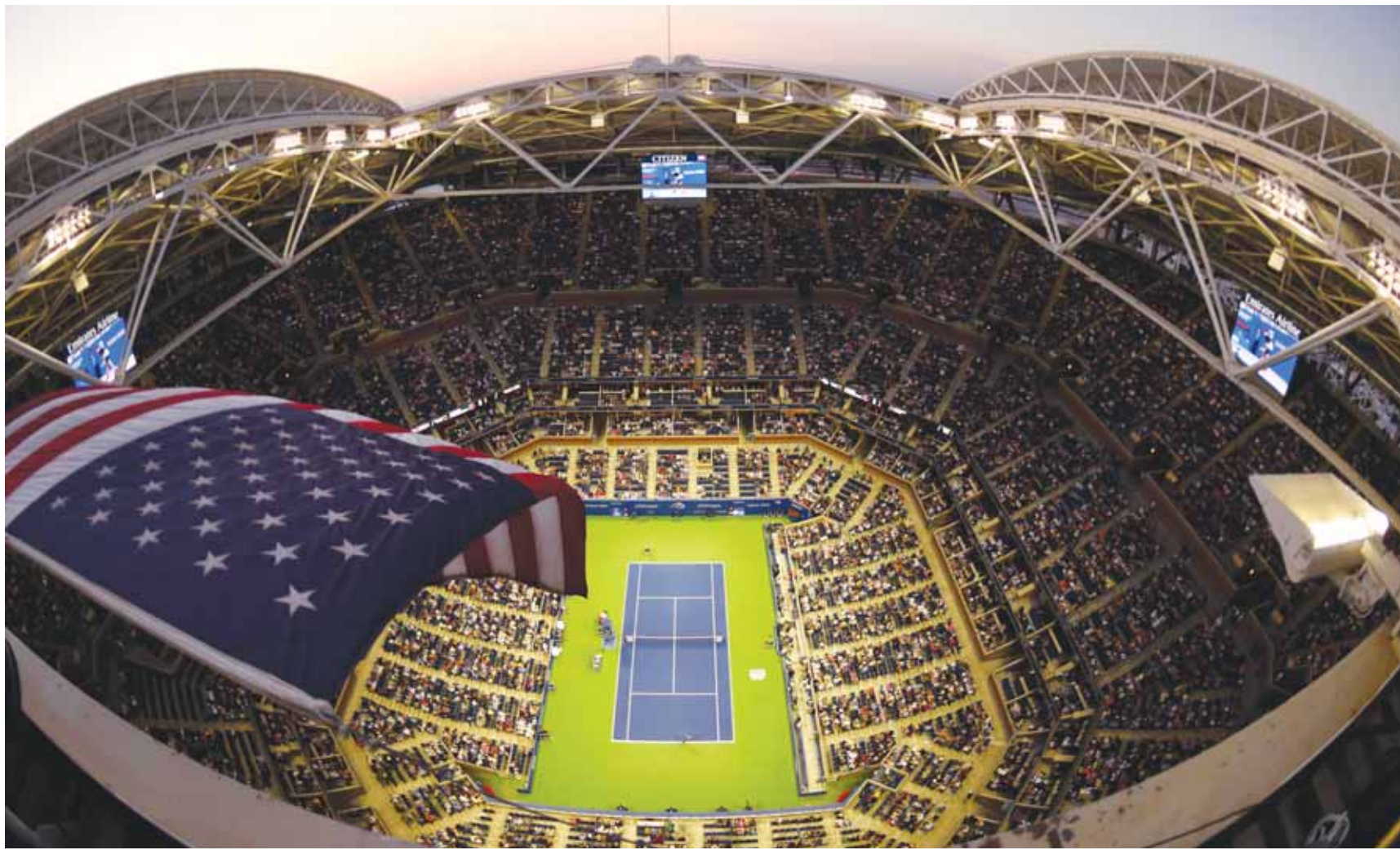
A general view as an American flag waves in the wind over Arthur Ashe Stadium during the match between Roger Federer of Switzerland and Philipp Kohlschreiber of Germany on day eight of the US Open at USTA Billie Jean King National Tennis Centre.

'...Of course if you ask me what I prefer, I prefer these conditions (hot) than indoor'