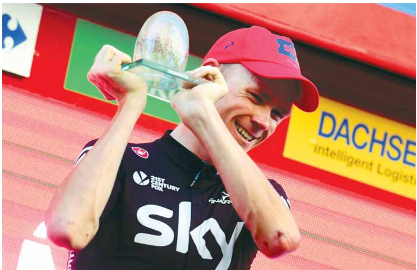
Sky's British cyclist Christopher Froome celebrates retaining his red jersey on the podium after winning the 16th stage of the 72nd edition of La Vuelta Tour of Spain cycling race, a 40.2km individual time trial from Circuito de Navarra in Los Arcos to Logrono, yesterday.

Australia's Caleb Ewan secured his second victory in this year's Tour of Britain by winning yesterday's third stage to reclaim the overall leader's green jersey. The Orica-Scott rider repeated his victory in the race's opening stage by pipping Norway's Edvald Boasson Hagen in a dramatic sprint finish in Scunthorpe, northeast England. Philippe Gilbert (Quick-Step) launched an attack with a kilometre of the 182km course remaining, only to be reeled in with around 200 metres to go. The ensuing sprint pitted Ewan against Boasson Hagen (Dimension Data) and Alexander Kristoff (Katusha Alpecin).