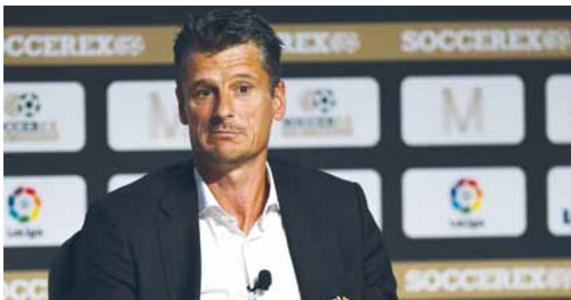
Former Dutch footballer and co-manager of Cruyff Football, Wim Jonk speaks during a panel discussion at the Soccerex Global Convention in Manchester yesterday.

He says Bosz, now with Borussia Dortmund, has to varying degrees of success implemented Cruyff's key principles.