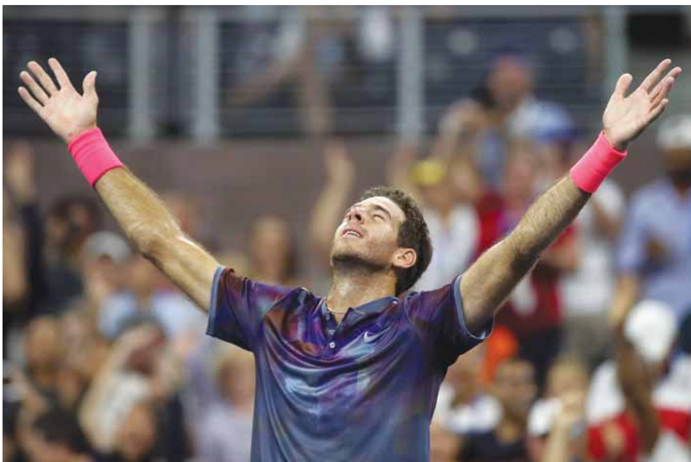
Juan Martin del Potro of Argentina celebrates after defeating Dominic Thiem of Austria in their fourth round US Open match at the USTA Billie Jean King National Tennis Centre.

Top seed Rafael Nadal claims his 50th win at the US Open and will meet Russian teenager Andrey Rublev in quarters