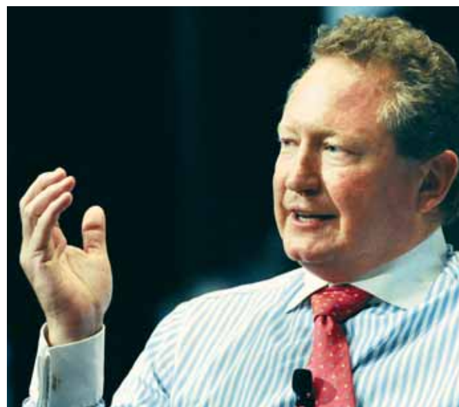
Andrew 'Twiggy' Forrest.

Clyne declined to comment on Forrest's proposed breakaway competition but shifted the blame onto RugbyWA for failing to provide a strong business case to keep Force in Super Rugby