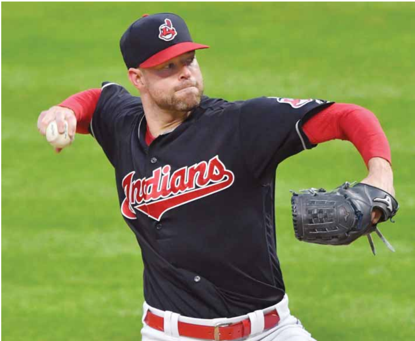
Cleveland Indians starting pitcher Corey Kluber delivers in the second inning against the Detroit Tigers.

Drew VerHagen replaced Hardy and struck out Yandy Diaz on three pitches for the second out. Francisco Mejia, pinch-hitting for Brandon Guyer, was inten-