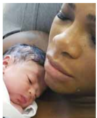
Serena Williams has revealed her daughter to the world on Instagram.

"It's been a long time, but we had a lot of complications, but look who we got 0 we got a baby