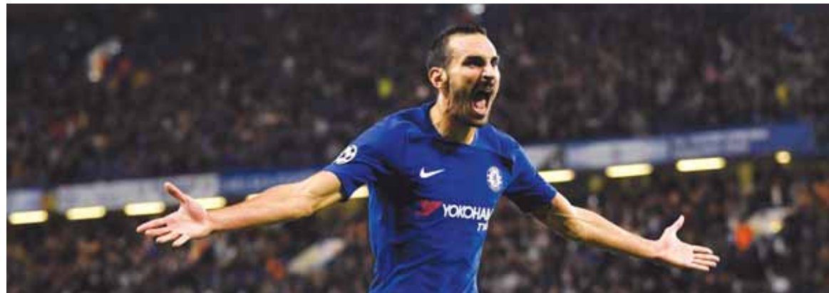
Chelsea's Davide Zappacosta celebrates after scoring the team's second goal during the Champions League match against Qarabag FK at Stamford Bridge in London on Tuesday.

for valuable game time was an added bonus for Conte, who said: "I wanted to give a chance to Michy and also to Andreas Christensen."