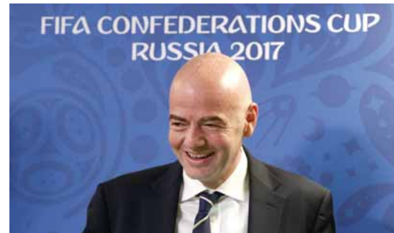
FIFA president Gianni Infantino.