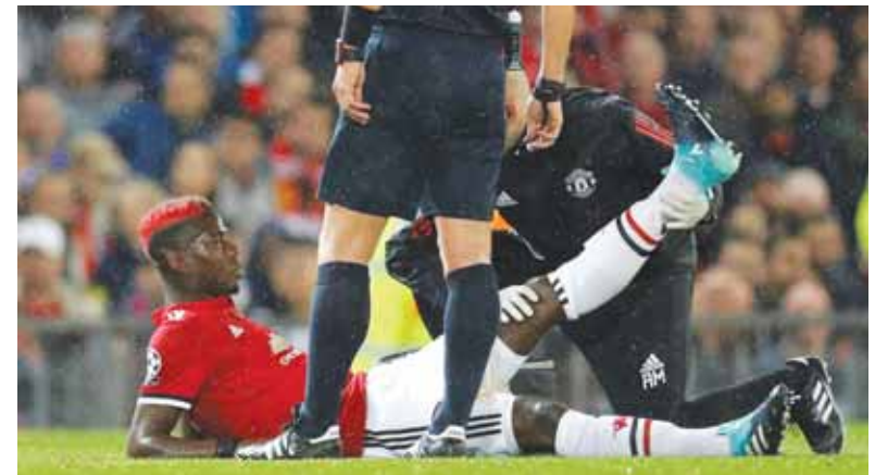
Manchester United's Paul Pogba receives medical attention on Tuesday.

"I think the competition is always positive competition because we're improving each other every day when we're in training and in the games we're pushing each other more and more."