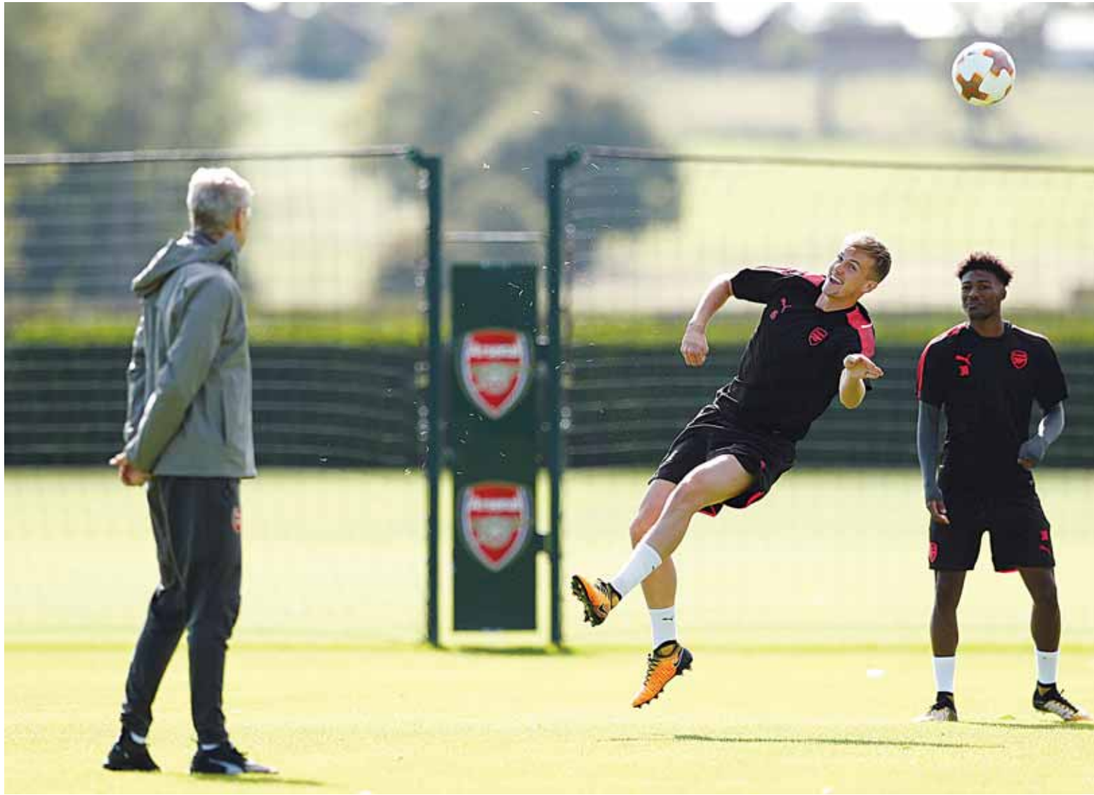
Arsenal manager Arsene Wenger (left) watches Rob Holding take part in a training session in London yesterday.