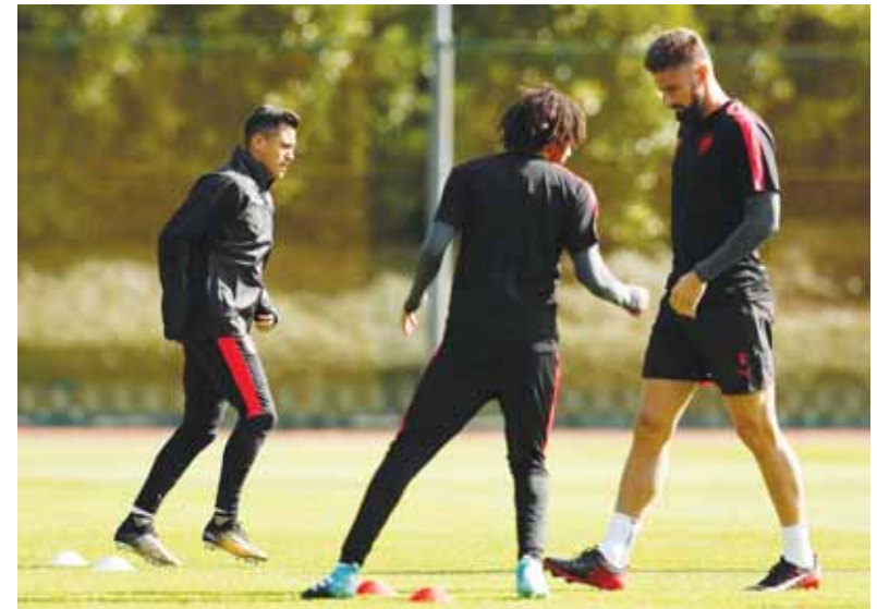
Arsenal's Alexis Sanchez (left) and Olivier Giroud take part in a training session in London yesterday.

"He has had a great evolution here and overall (his) contribution has been tremendous, and I think he has shown a very loyal spirit and has a high respect from everybody inside the club, as well as (from) our fans."