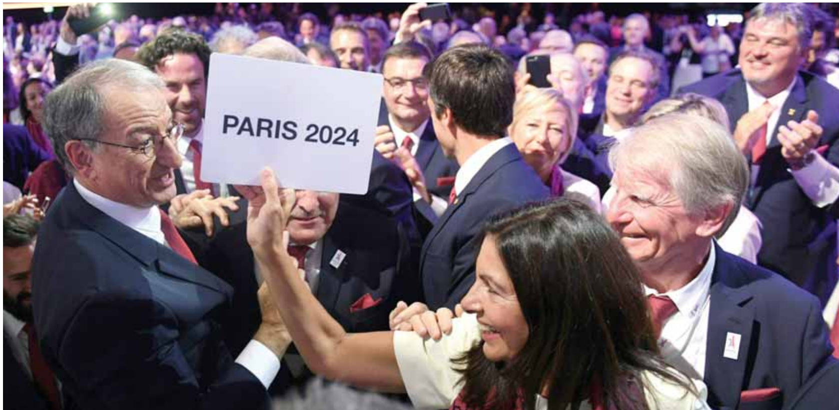
Paris 2024 bid delegation members French National Olympic Committee president Denis Massegria (L) and Paris Mayor Anne Hidalgo (R) celebrate during the 131st International Olympic Committee (IOC) session in Lima yesterday.

'You can't imagine what this means to us, incredible, so strong'