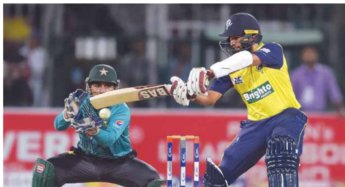
World XI batsman Hashim Amla (R) plays a shot as Pakistani captain and wicketkeeper Sarfraz Ahmed looks on during their second Twenty20 international at the Gaddafi Cricket Stadium in Lahore yesterday.