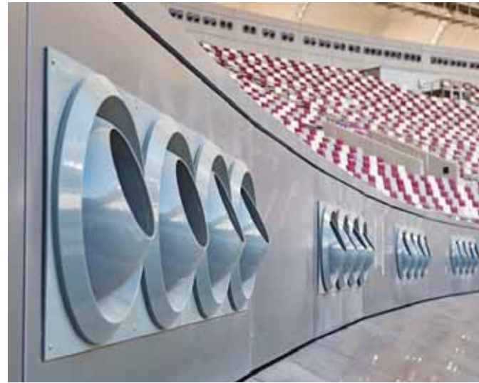
Plastic nozzles are an integral part of Qatar's stadium cooling technology.

Many Asian leagues play in summer, including Japan and South Korea. The Chinese Super League kicks off in March, while leagues in the Gulf region gener-