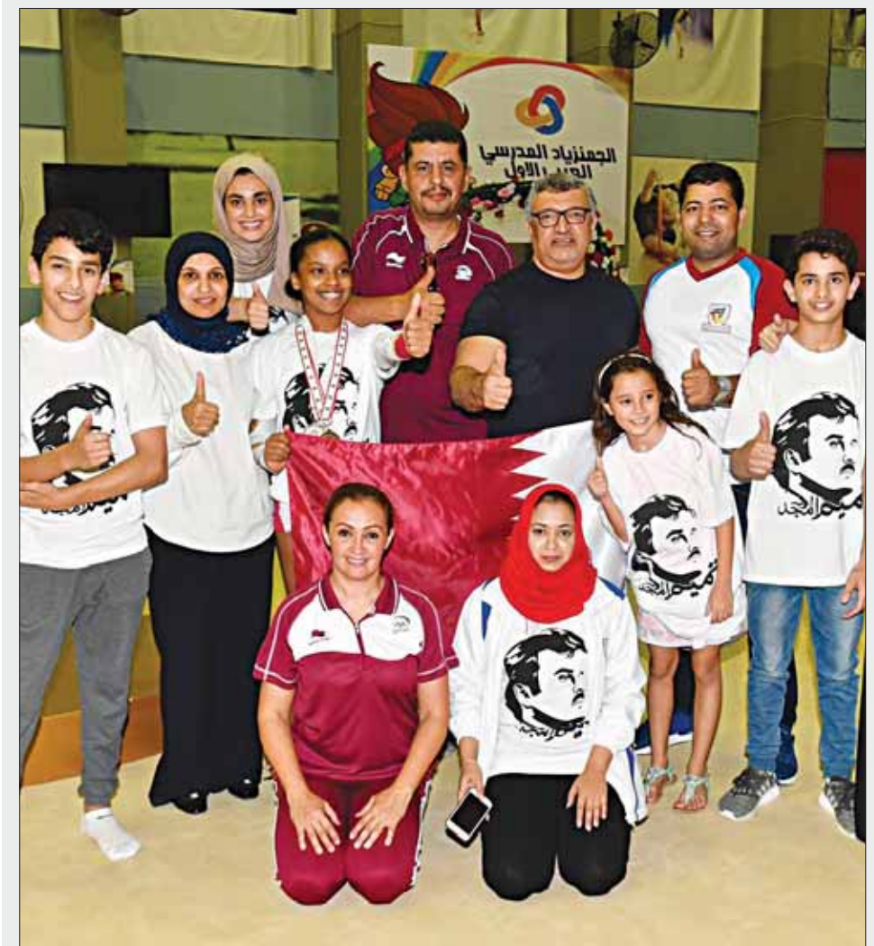
Qatar gymnasts and team officials pose in Doha on their return from Beirut after taking part in the Arab School Gymnastics Meet. Qatar won five medals in the meet.