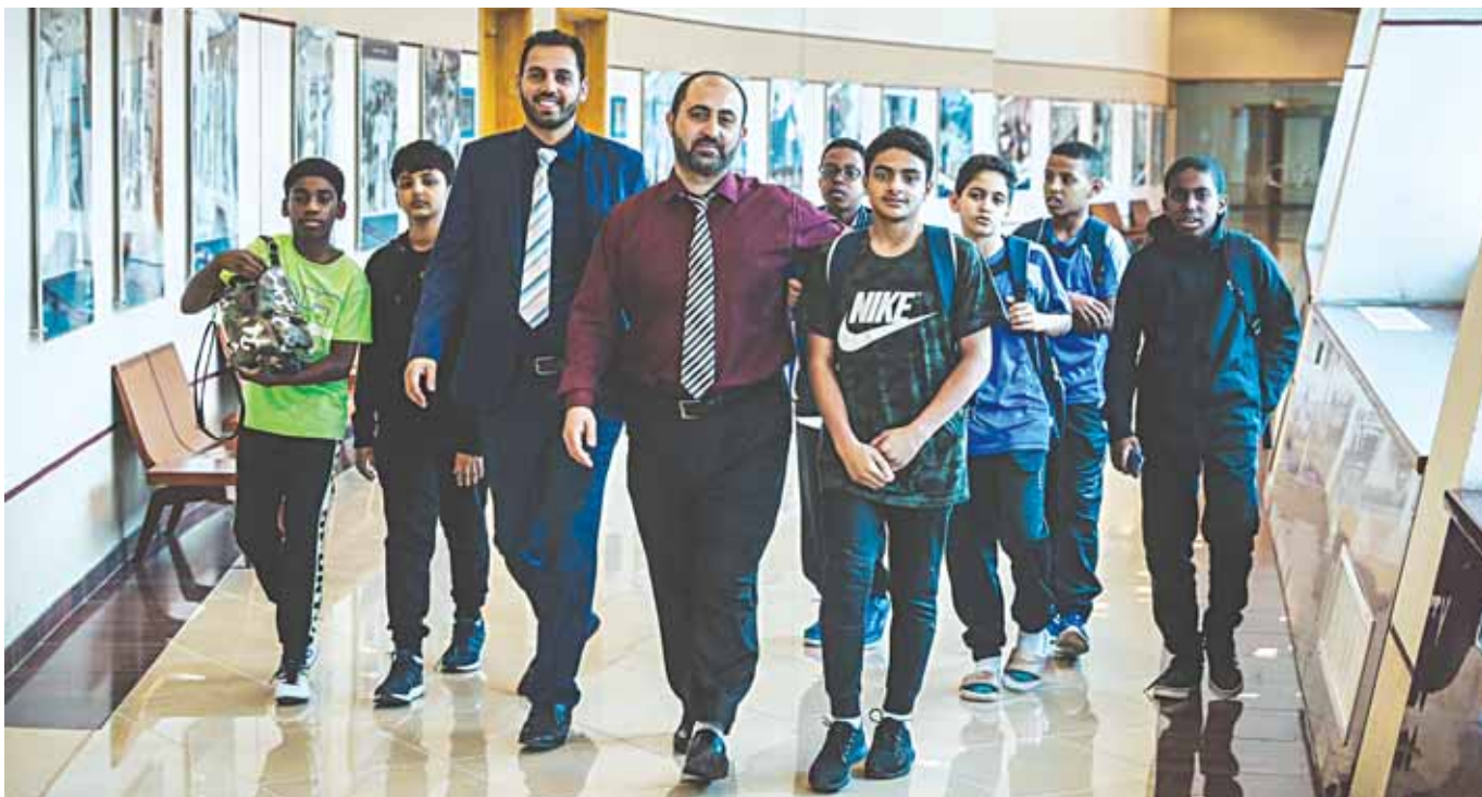
Aspire Academy's student-athletes on the first day of the new academic year.

"The Academy is now an official Council of International Schools-accredited institution and we aim to maintain our