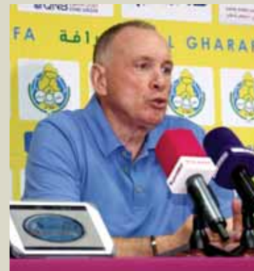
Al Gharafa's Jean Fernandez and Al Ahli's Joaquin Caparros

"We all know how good Al Gharafa are in Qatar. This is an ideal match to show what we can do, and we are fully ready for the match."