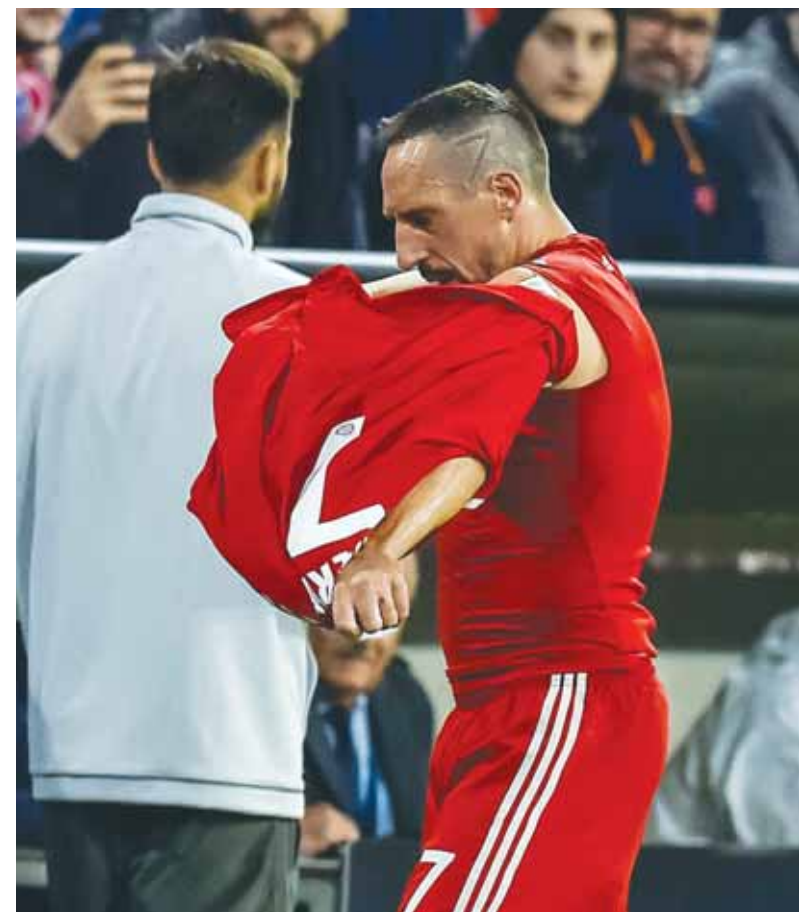
Bayern Munich's Franck Ribery takes off his jersey after leaving the pitch during the Champions League match against Anderlecht in Munich on Tuesday.

Defending champions Bayern have made a poor start to the new Bundesliga season as Saturday's 2-0 defeat at Hoffenheim left them sixth in the table, their worst position after three games since 2010-11.