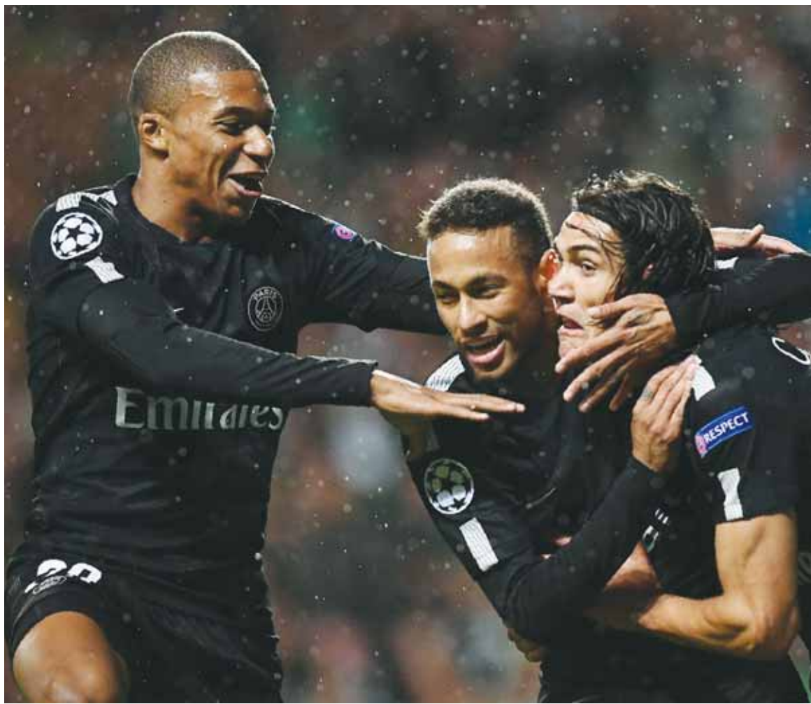
Paris Saint-Germain's Neymar (centre) celebrates with teammates Kylian Mbappe (left) and Edinson Cavani after scoring the opening goal of the UEFA Champions League match against Celtic at Celtic Park in Glasgow on Tuesday.

The French side's formidable front line terrorised the Celtic defence and Emery warned they would only get better.