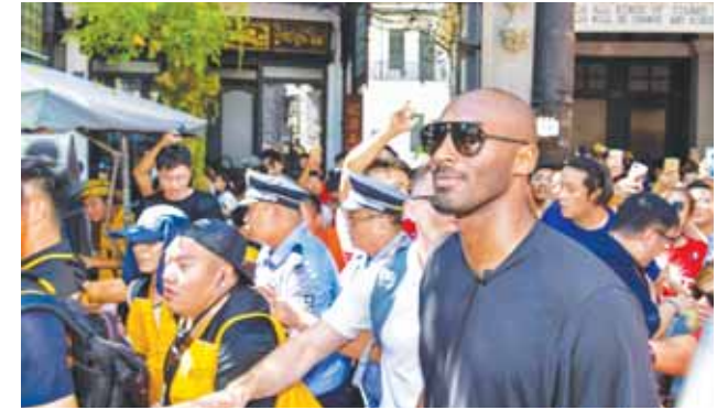
Former NBA basketball player Kobe Bryant attends a basketball teaching activity in Haikou, China.

Bryant is the Lakers' all-time leader in regular season games played (1,346), points (33,643), three-pointers made (1,827), steals (1,944) and free throws made (8,378), while owning club playoff records for games played (220), points (5,640), three-pointers made (292) and free throws made (1,320).