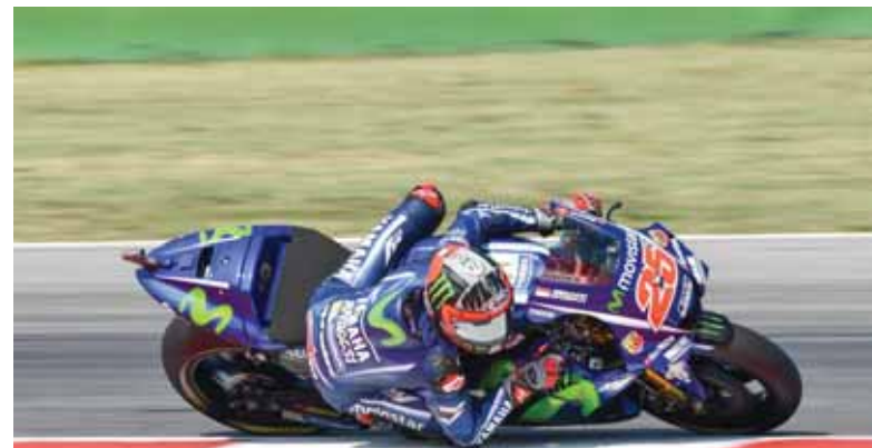
Yamaha's Maverick Vinales rides his bike during the qualifying session for the San Marino Moto GP at the Marco Simoncelli circuit in Misano yesterday.