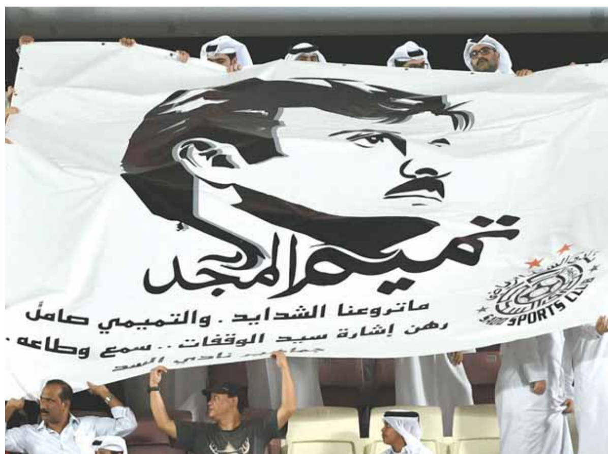
Qatar Football Association president Sheikh Hamad bin Khalifa bin Ahmed al-Thani hands over the Sheikh Jassim Cup to Al Sadd's Xavi and Hassan al-Haydous after their win over Al Duhail yesterday. At right, Al Sadd fans wave a mural of His Highness the Emir Sheikh Tamim bin Hamad al-Thani during the match. At bottom, Baghdad Bounedjah celebrates his hat-trick goal.