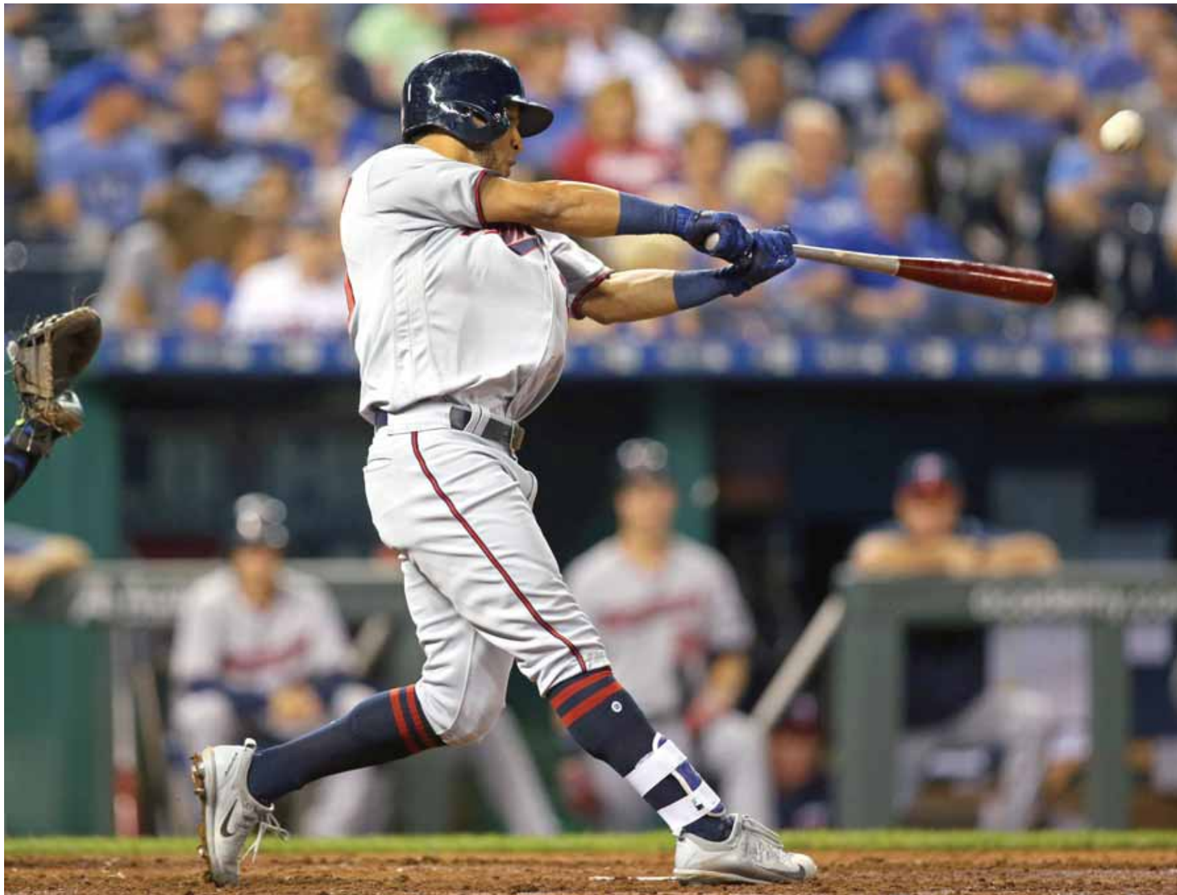
Minnesota Twins left fielder Eddie Rosario hits a home run against the Kansas City Royals in the third inning at Kauffman Stadium.

'When you score the first five innings of a game and you have your best pitcher out there, you would like to think the game would be a little less stressful'