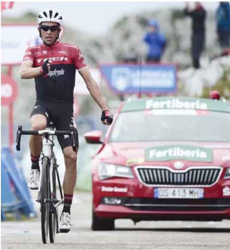
Trek-Segafredo's cyclist Alberto Contador celebrates his win in the 20th stage of Vuelta a Espana in Alto de L'Angriru, Spain, yesterday.

Nibali's faint chances of catching Froome overall went up in smoke when he crashed with 15km to go on a descent before reaching the Angriru as-