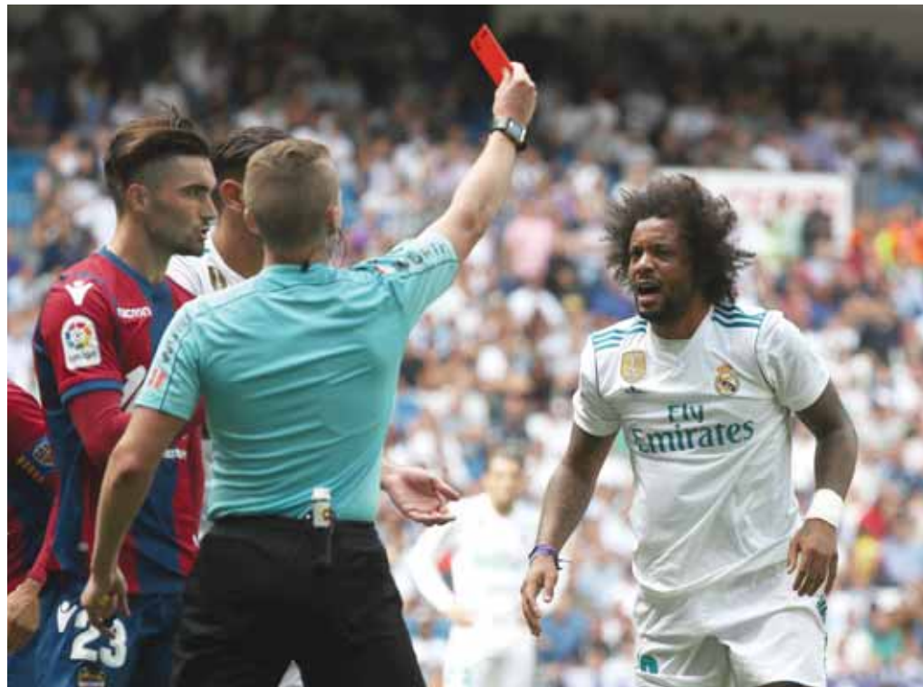
Real Madrid's Marcelo (R) is shown a red card by referee during the La Liga match against Levante.