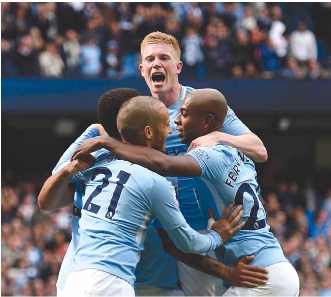
Manchester City's Brazilian striker Gabriel Jesus (L) celebrates with teammates after scoring their third goal during the English Premier League match against Liverpool in Manchester yesterday.

Arsenal eased the pressure on Arsene Wenger with a vital 3-0 win against Bournemouth.