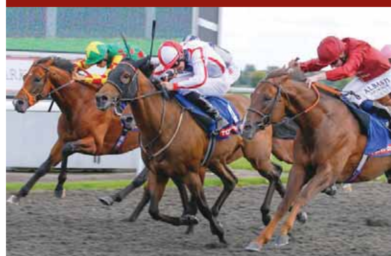
Oisin Murphy (right) rides Chemical Charge to victory yesterday.