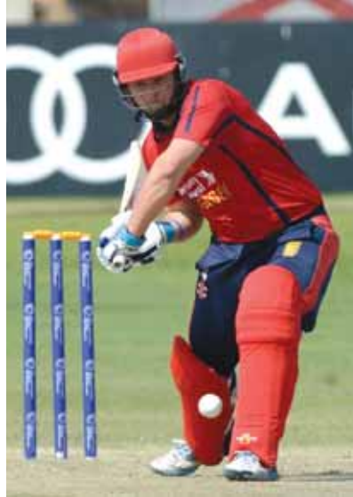
Action from the final between Jersey and Vanuatu yesterday.

Ghana picked up a six-wicket victory in the seventh place playoff chasing down the 137-run target set by Cayman Islands in the 20th over.