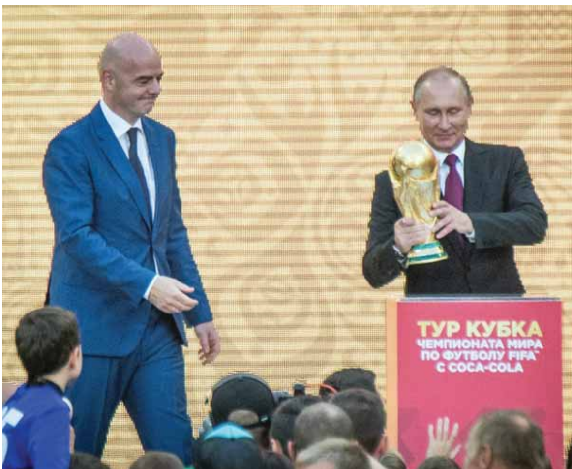
Russian President Vladimir Putin (R) holds the FIFA World Cup Trophy flanked by FIFA President Gianni Infantino (L) during the opening of the trophy tour ceremony at Luzhniki stadium in Moscow yesterday.

The Luzhniki stadium, which has undergone a five-year reconstruction, will host the opening and final games of the World Cup 2018.