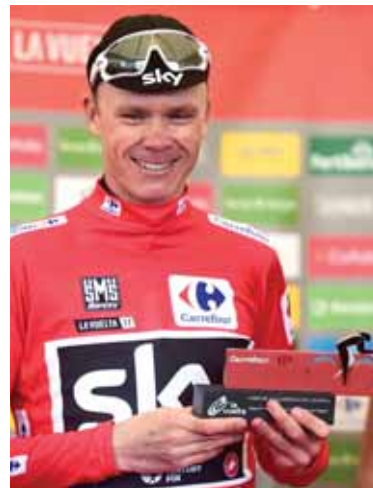
Sky's Chris Froome leads the overall classification.

The Spaniard moved up to fourth in the general classification and is set to miss out on a podium place in his final professional race, but his magnificent stage win ensured he still signed off from his glorious career in style.