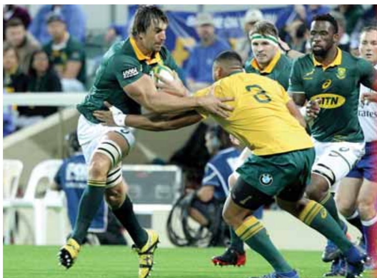
South Africa's Eben Etzebeth (left) pushes off Australia's Sekope Kepu during their Rugby Championship match in Perth, Australia, yesterday.

"We said at half-time that we had to work on a couple of things and we almost pulled it through.