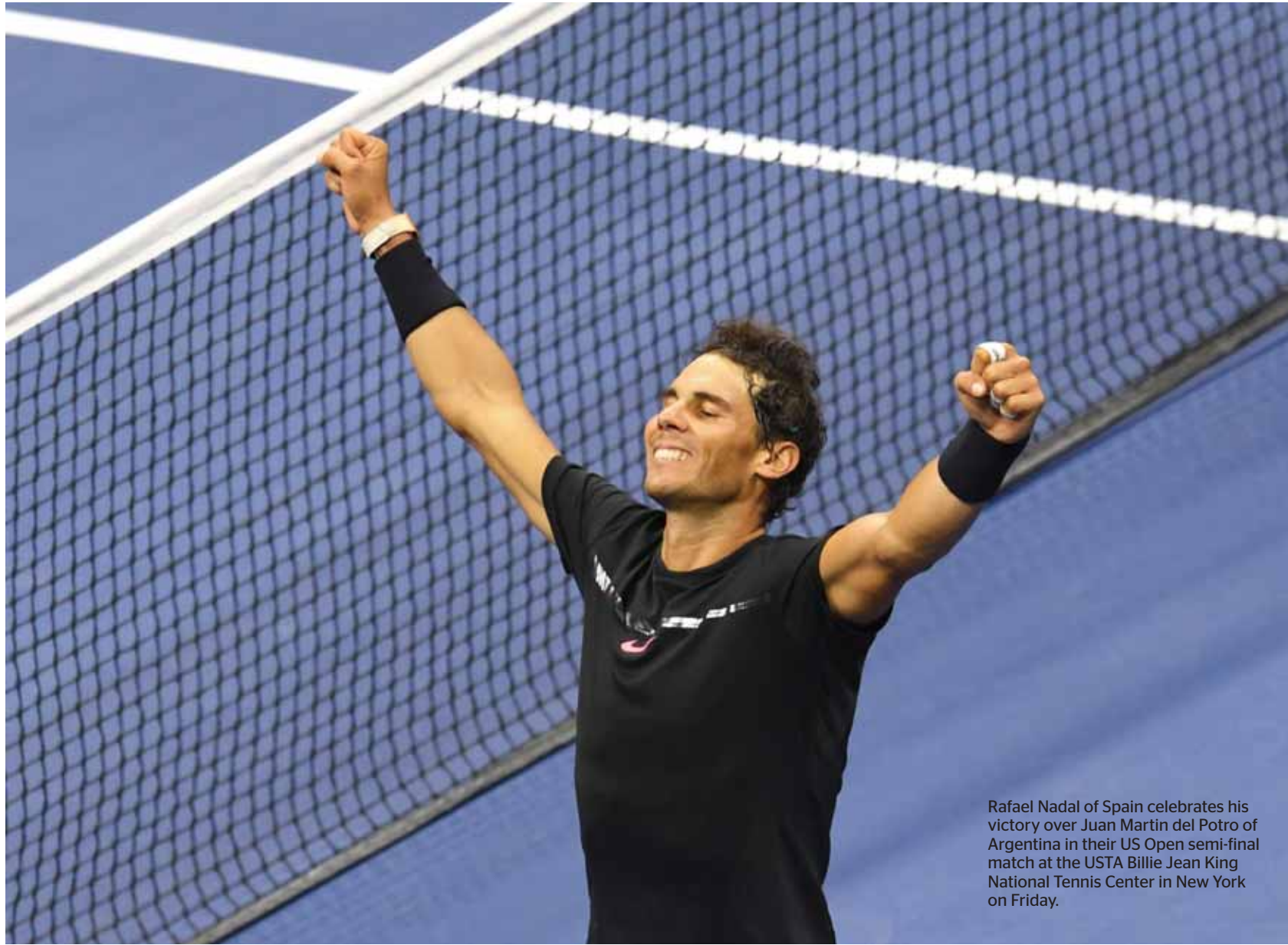
Rafael Nadal of Spain celebrates his victory over Juan Martin del Potro of Argentina in their US Open semi-final match at the USTA Billie Jean King National Tennis Center in New York on Friday.

Nadal, who lost to Roger Federer in the Australian Open final but won his 10th French Open crown in June, has reached three Slam finals for the first season since 2011