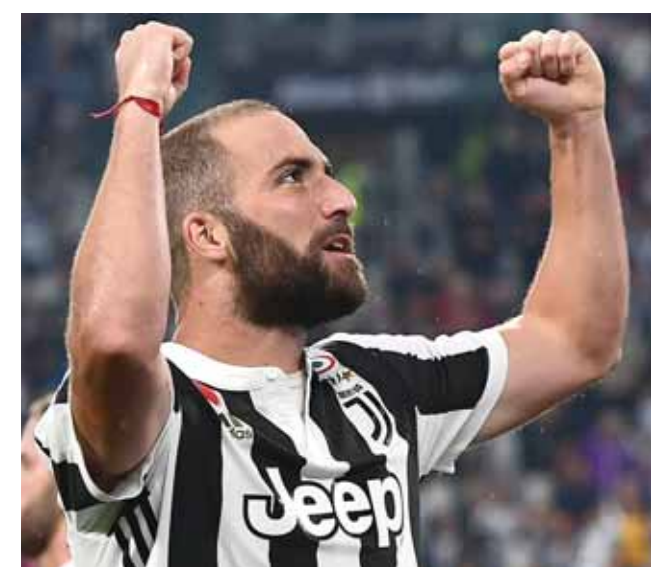
Juventus' Argentinian forward Gonzalo Gerardo Higuain celebrates after scoring against Chievo in Turin yesterday.

Results Juventus 3 Chievo Verona 0 Sampdoria Roma postponed