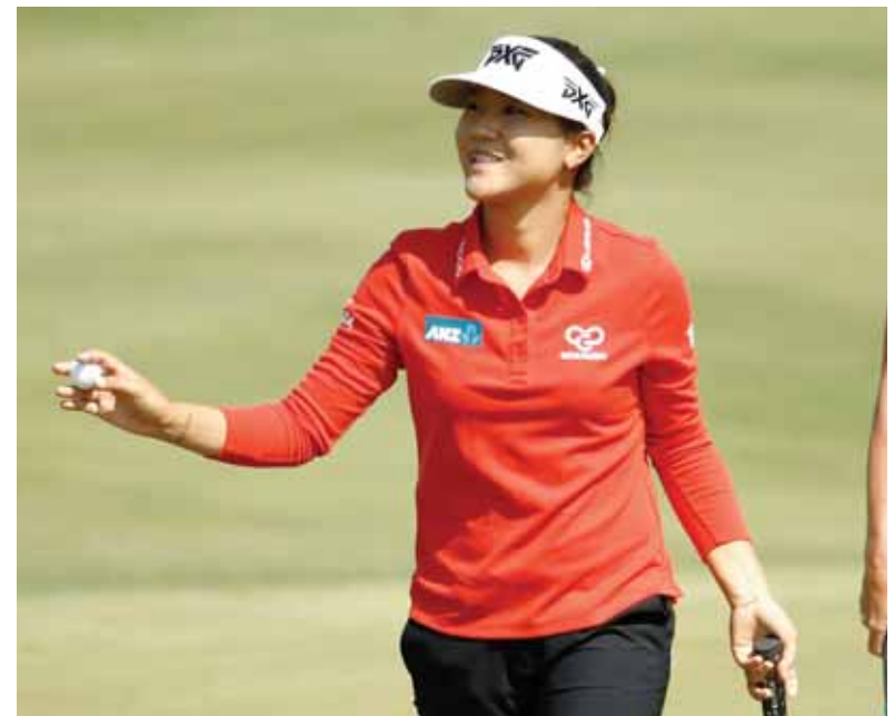
Lydia Ko of New Zealand waves to the crowd after making a birdie on the fifth hole during the second round of the Indy Women In Tech Championship at the Brickyard Crossing Golf Course in Indianapolis, Indiana, on Friday.

Americans Cristie Kerr and Amy Olson are tied in fifth place on 10-under, five behind the leaders.