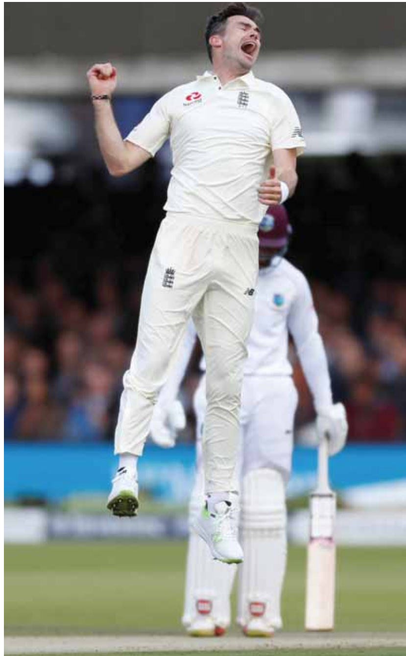
England's James Anderson celebrates the wicket of West Indies' Jermaine Blackwood on third day of the third Test at the Lord's cricket ground in London yesterday.

him caught behind undone off a superb Anderson leg-cutter.