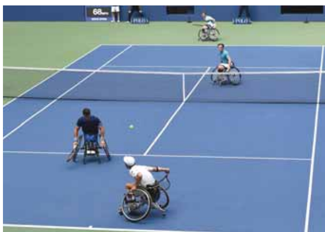
Wheelchair tennis action from the Arthur Ashe Stadium.

ible to have that opportunity as wheelchair players. It's showing the respect that wheelchair ten-