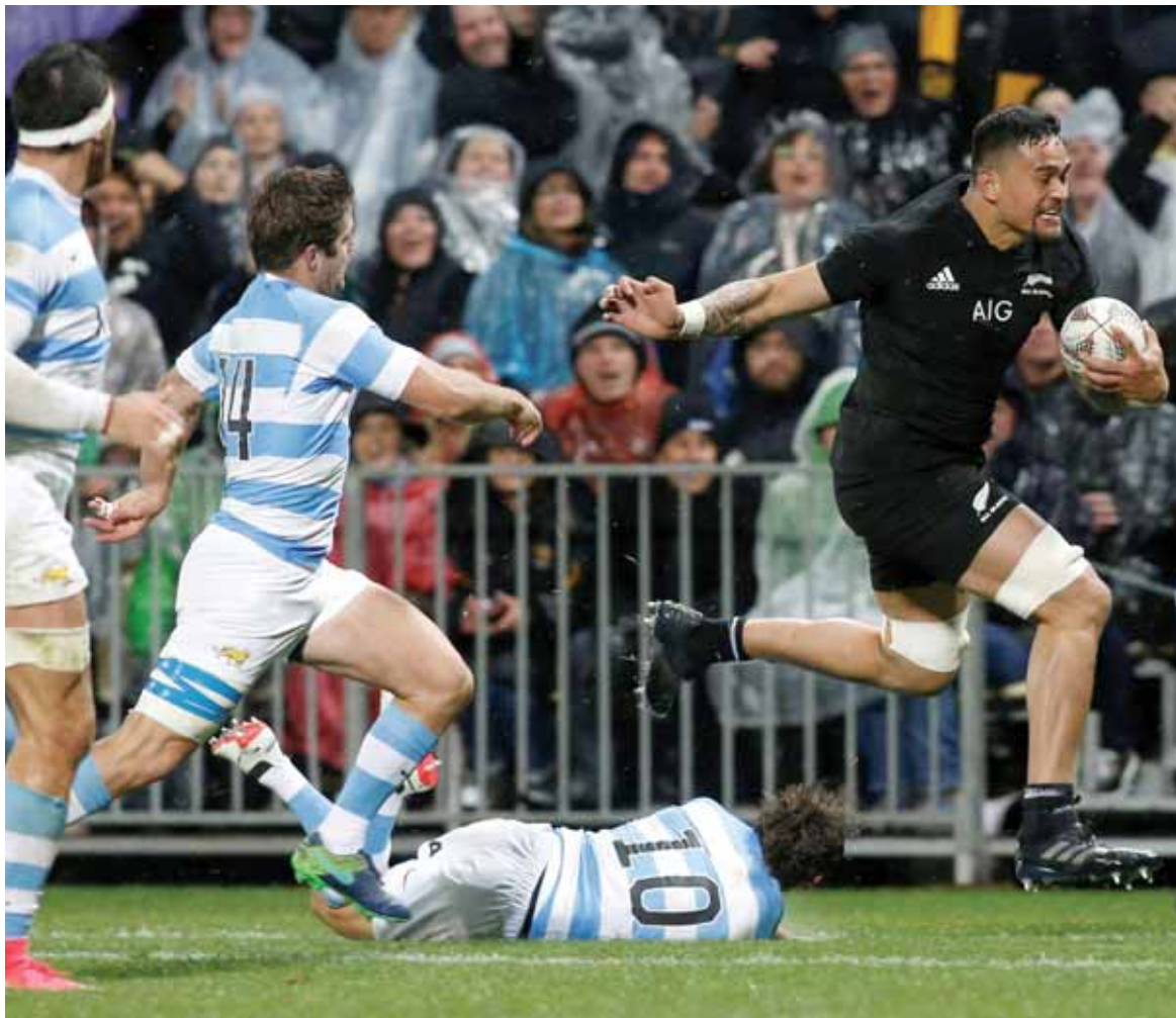
New Zealand's Vaea Fifita (right) on his way to score a try in the second half of the Rugby Championship against Argentina in New Plymouth, New Zealand, yesterday.

In the first half, as the All Blacks continued to suffer from the indecision and handling errors that plagued