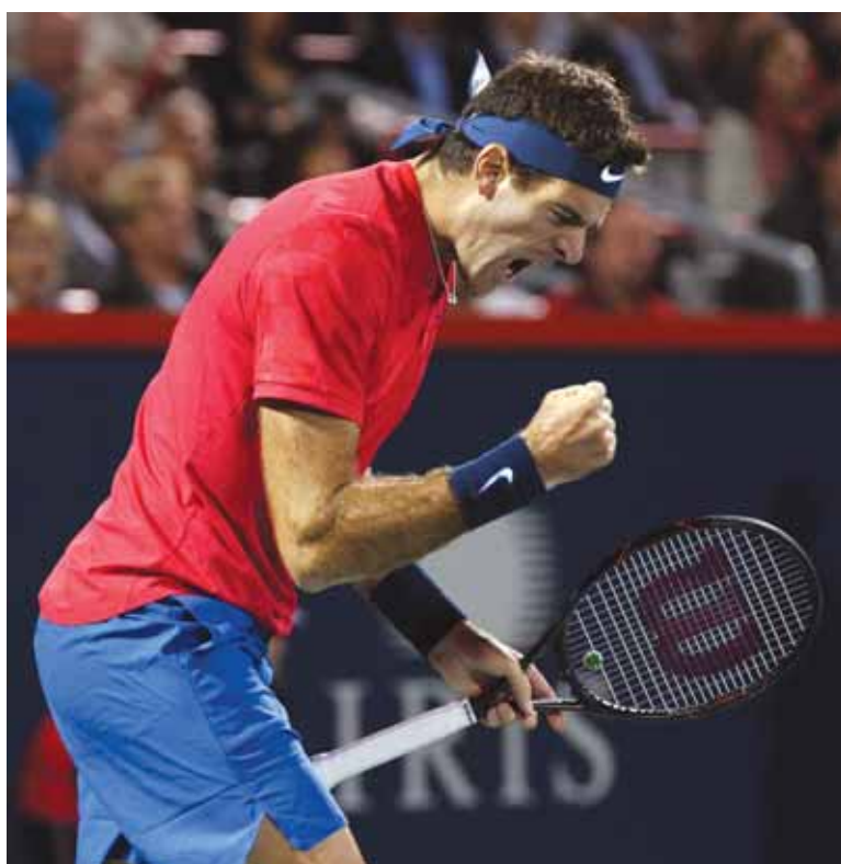
Juan Martin del Potro of Argentina celebrates his win over John Isner of the United States (not pictured) on Monday.

"I got lucky to win tonight," del Potro said. "Nobody wants to play John in the first round. But now I am in good