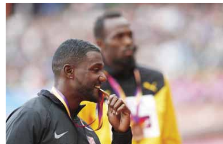
Justin Gatlin (left) poses on the podium with his gold medal during the podium ceremony for the men's 100m event at the IAAF World Championships in London on Sunday.

"If the king, the legend is OK with it we should all be OK with it."