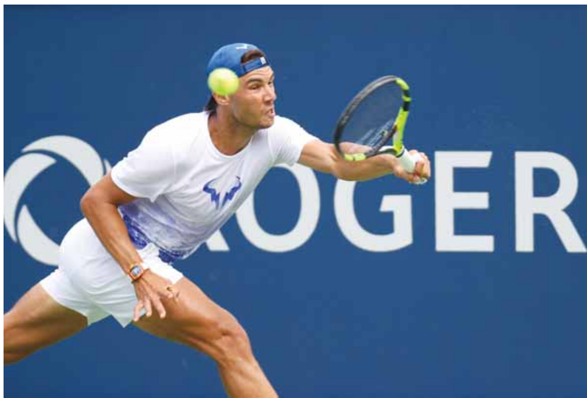
A semi-final run would see Rafael Nadal supplant Andy Murray (not pictured) atop the rankings.

Del Potro closed out the victory on his second match point by hitting a forehand winner down the line. He broke Isner at 5-5 in the second set then jumped out to a 40-0 lead in the final game.