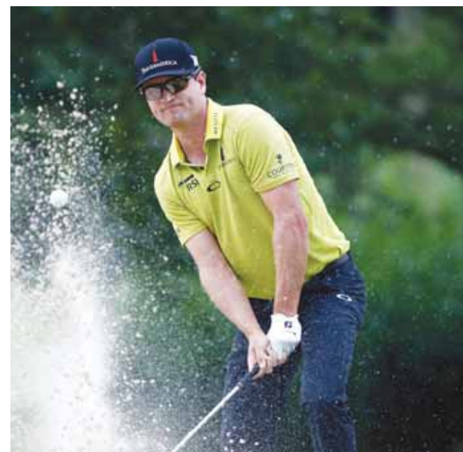
Zach Johnson says the greens will pose problems for players at the PGA Championship.