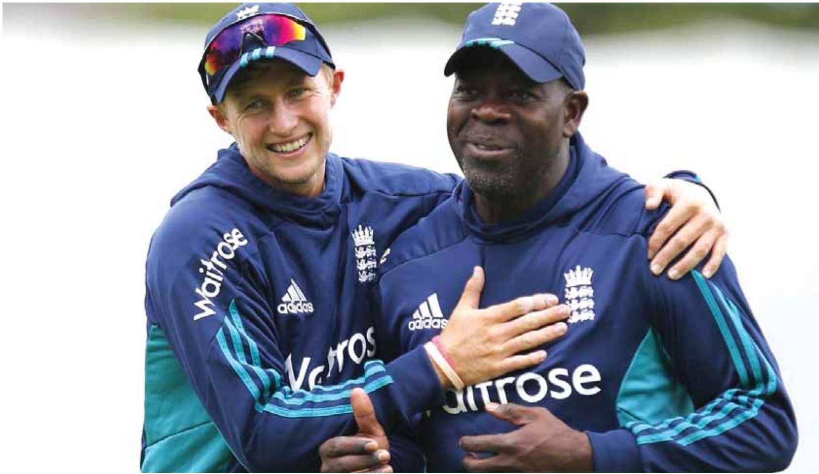
England bowling coach Ottis Gibson (right), seen here with captain Joe Root, is set to leave his position to become head coach of South Africa.

former West Indies head coach Gibson as a member of his backroom staff. "I only found out from you guys (the press) – that's the first we'd heard of it," said Bayliss of British media reports linking Gibson with the South Africa post. "There's nothing been finalised yet."