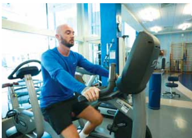
Stoke City's midfielder Stephen Ireland at Aspetar.

Speaking to Aspetar media team, Ireland said: "I had been struggling to get back to full fitness and thought I had tried everything, but then I got to Aspetar. We weren't sure I was going to make it back to full fitness. Luckily, my hopes have been answered and I am going back to my club fit and healthy. I can't wait to start playing again."