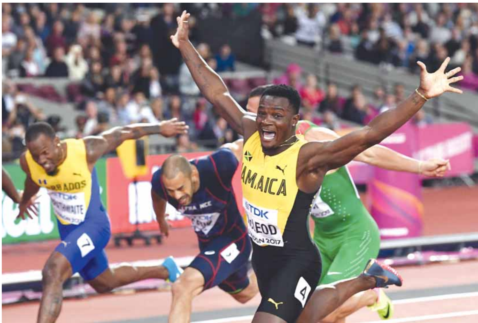
Jamaica's Omar McLeod (right) celebrates winning the men's 110m hurdles final at the 2017 IAAF World Championships in London on Monday.