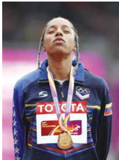
Venezuela's Yulimar Rojas poses with her gold medal on the podium for the women's triple jump event in London yesterday.

"It's totally different to last year where we had Usain and Elaine winning, which I used to propel me. I didn't have that this time so I really wanted to