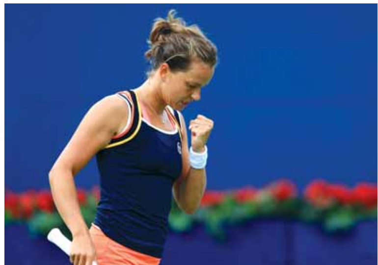
Barbora Strycova of Czech Republic celebrates winning a point against Kristina Mladenovic of France at the Rogers Cup in Toronto on Monday.

Earlier, Mladenovic was swept aside 6-2, 6-3 by Czech Barbora Strycova while Ostapenko fell to American Varvara Lepchenko as upsets marked the start of the tournament.