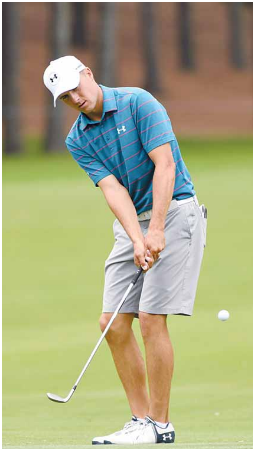
Jordan Spieth plays a shot during a practice round prior to the 2017 PGA Championship at Quail Hollow Club in Charlotte, North Carolina.

24-year-old American could become the youngest player to win all four majors if he wins the event on Sunday