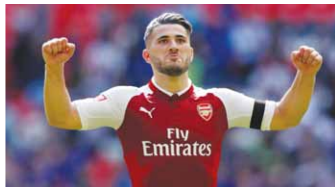
File picture of Arsenal defender, Sead Kolasinac.