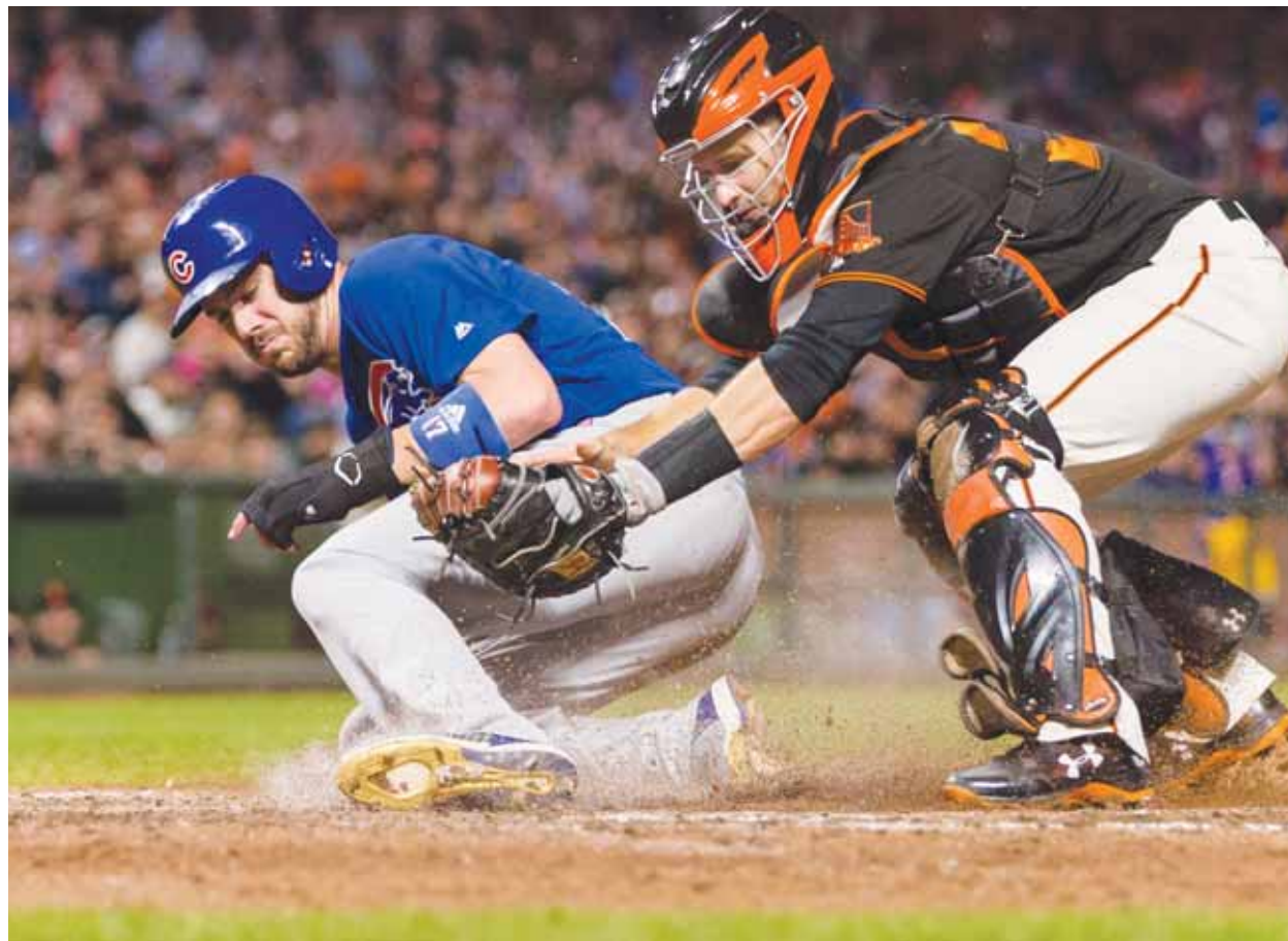
San Francisco Giants catcher Buster Posey (right) tags Chicago Cubs third baseman Kris Bryant in the seventh inning during the Major League Baseball at the AT&T Park in San Francisco on Monday.

Wade Davis got three outs for his 24th save in 24 tries. San Francisco left-hander Matt Moore (3-12) was charged with five runs and eight hits in six innings.