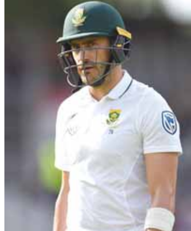
South Africa's captain Faf du Plessis.

Meanwhile England head coach Trevor Bayliss indicated he was getting ready for life without 48-year-old