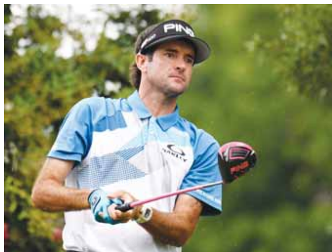
Bubba Watson tees off on the second hole during a practice round at Quail Hollow Club yesterday.

Under a proposed revised schedule, The Players Championship would move back to March, with the US Masters leading off the series of majors in April followed by the PGA in May,