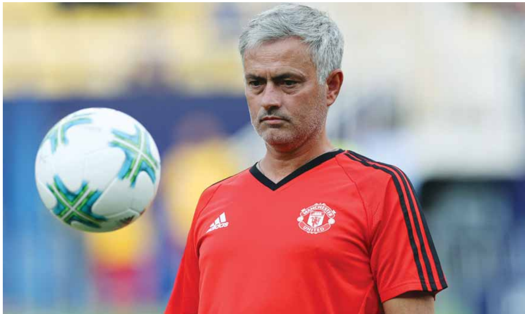
File picture of Manchester United manager Jose Mourinho during a training session.

'Can we win it? We can, but maybe we won't. Everything is good and strong, but some of them (other clubs) are really strong in the market, so it is going to be difficult'