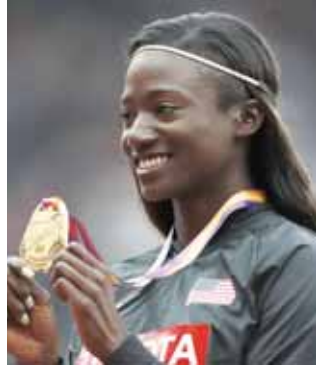
"I have a few cuts but I'll be ready for the 200m. I'm not afraid of what is to come."

"Ta Lou went away fast but she always does. It didn't bother me and I just kept pumping my legs and arms until the finish."