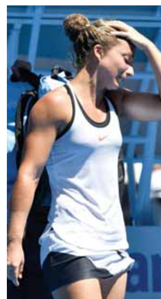
Errani was charged with an Anti-Doping violation on April 18 and had promptly asked for a hearing before an Independent Tribunal.