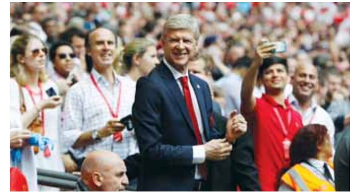
File picture of Arsenal manager Arsene Wenger.