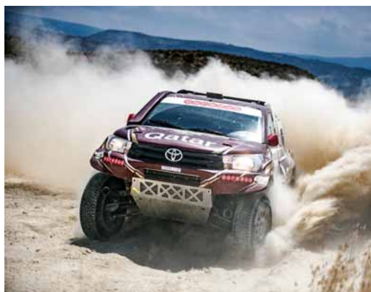
Nasser al-Attayah enjoys a commanding lead in the championship.