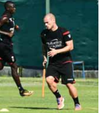
Newly-signed Dutch midfielder Wesley Sneijder attends first training session at the Nice.

The Dutchman, his country's all-time record caps holder with