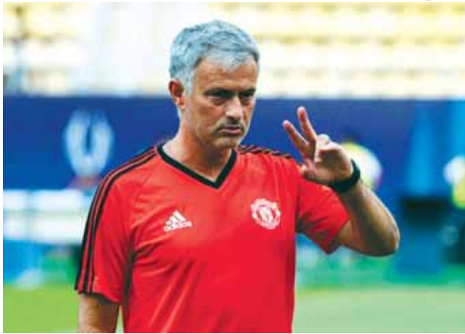
Manchester United's Portuguese coach Jose Mourinho gestures as his players warm up during a training session.

is the clearest signal that he is staying there."