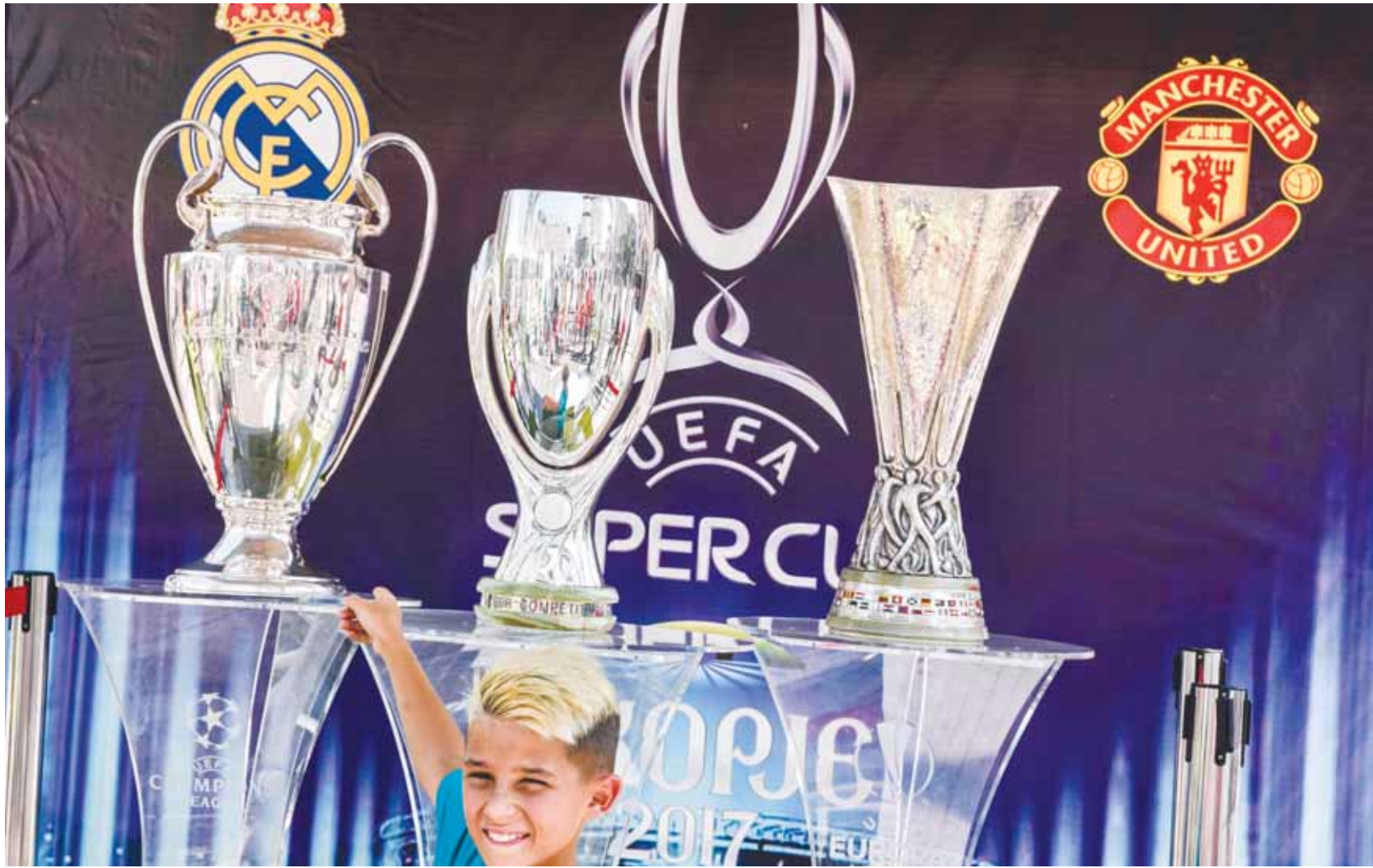
A child poses in front of trophies at the UEFA Super Cup fan zone in Skopje yesterday ahead of UEFA Super Cup match between Real Madrid and Manchester United.

'Real has hunger. We all know where we are and when you finish a season like last year winning, it helps you try to do the same thing coming into the new season'