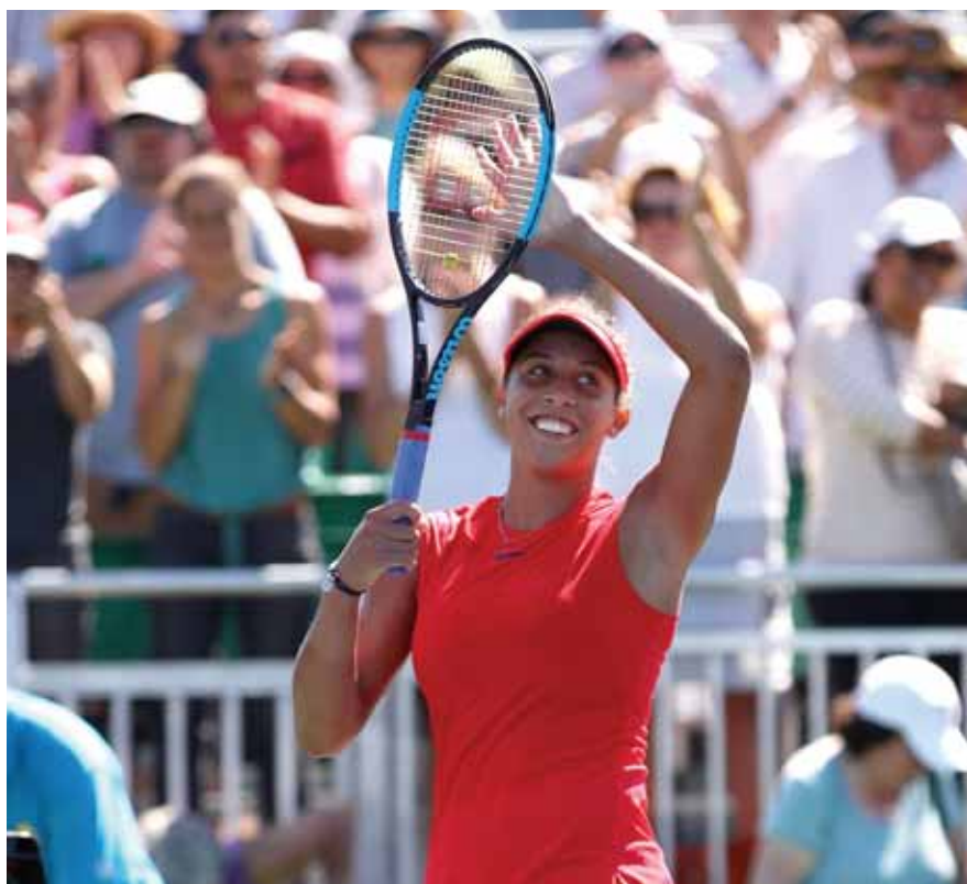
Madison Keys waves to the crowd after beating CoCo Vandeweghe in the final to win the Stanford Open in Stanford, California, on Sunday.

The world No. 21 Keys reached the final by eliminating reigning Wimbledon champion Garbine Muguruza in straight sets, so it didn't come as a surprise she played her best tennis in the final. It was the first career WTA meeting between Keys and Vandeweghe but they are no strangers off the court. The two Fed Cup teammates shared a long embrace at the net after Keys closed out the win with back-to-back forehand winners.