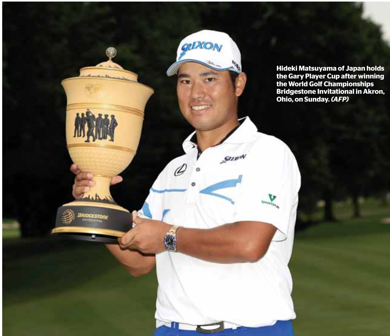
Hideki Matsuyama of Japan holds the Gary Player Cup after winning the World Golf Championships Bridgestone Invitational in Akron, Ohio, on Sunday.

Johnson, who shared the overnight lead with Belgian Thomas Pieters, had three birdies and a bogey in his two-under ef-