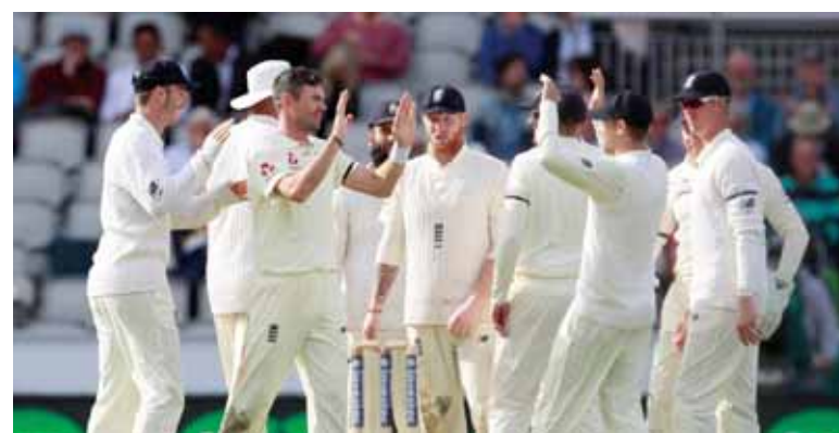
England's James Anderson and teammates celebrate after taking the wicket of South Africa's Faf du Plessis in Manchester yesterday.