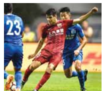
File picture of Shanghai SIPG player Oscar (C).

"Our bad spell responds to the fact that we had Oscar suspend-