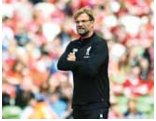
File picture of Liverpool manager Juergen Klopp.

"I'm happy. You can imagine we are still working on different things and we will see if it works. I am already here to work with