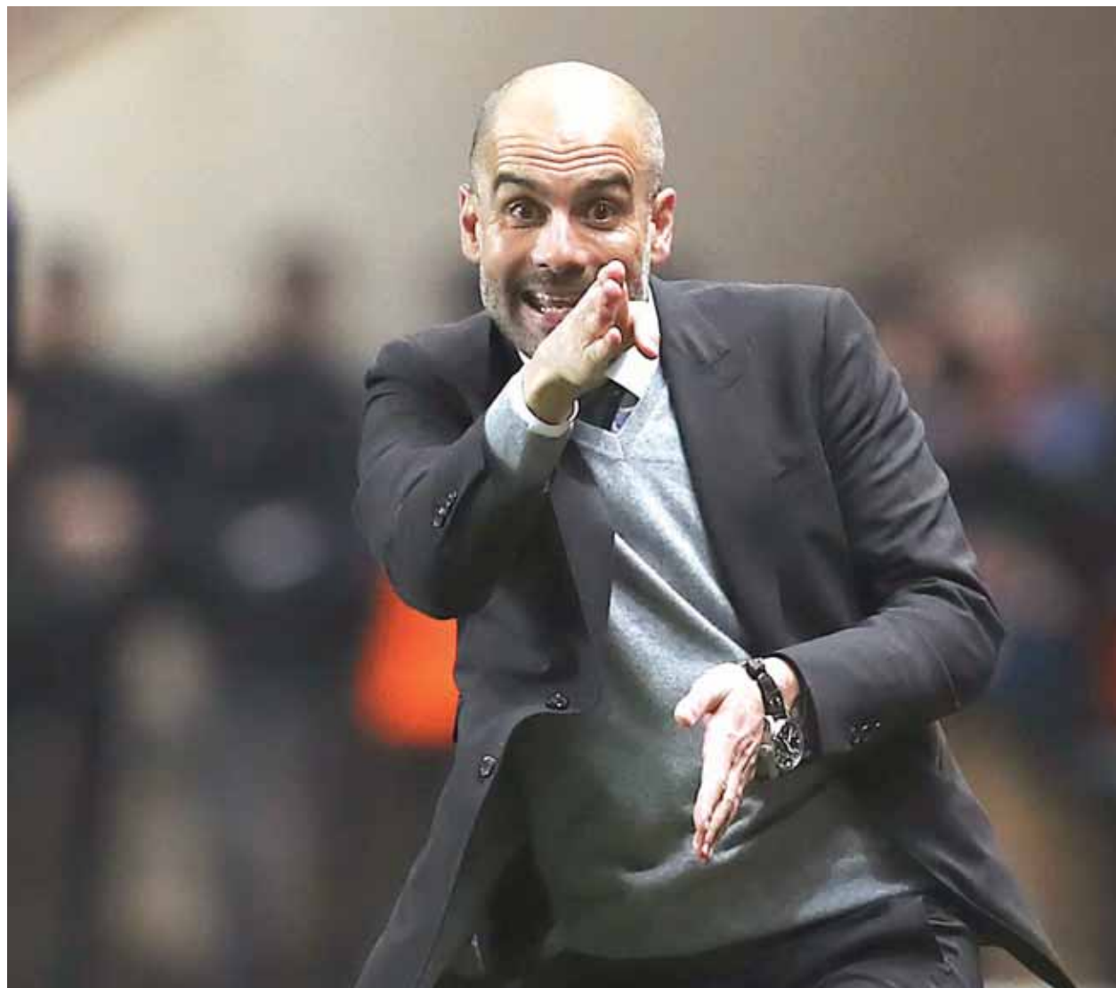
File picture of Manchester City’s Spanish manager Pep Guardiola reacting during a UEFA Champions League match.

be better than the first, but again, this is modern football. The reality is totally different,” he told ESPN.