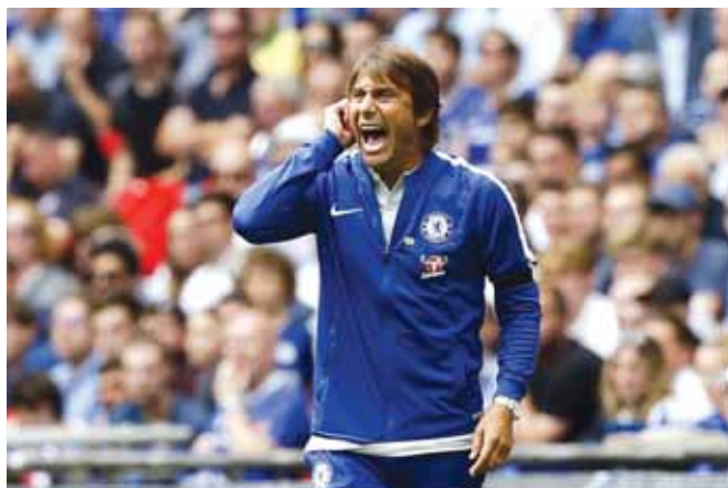
File picture of Chelsea’s Italian head coach Antonio Conte.

“Two coaches have been sacked from Chelsea and Leices-