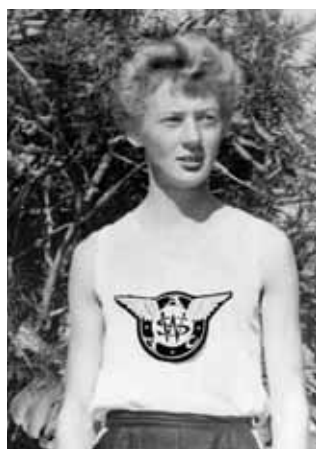
second most decorated Australian Olympian behind swimmer Ian Thorpe.

She also anchored Australia to the 4x100m relay gold in a world record time at the Melbourne Games and remains the joint