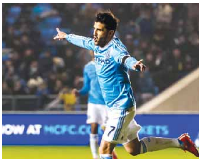
File picture of New York City captain David Villa.

Villa's solo run yielded a equalizer in the 72nd, and three minutes later he drew a call in