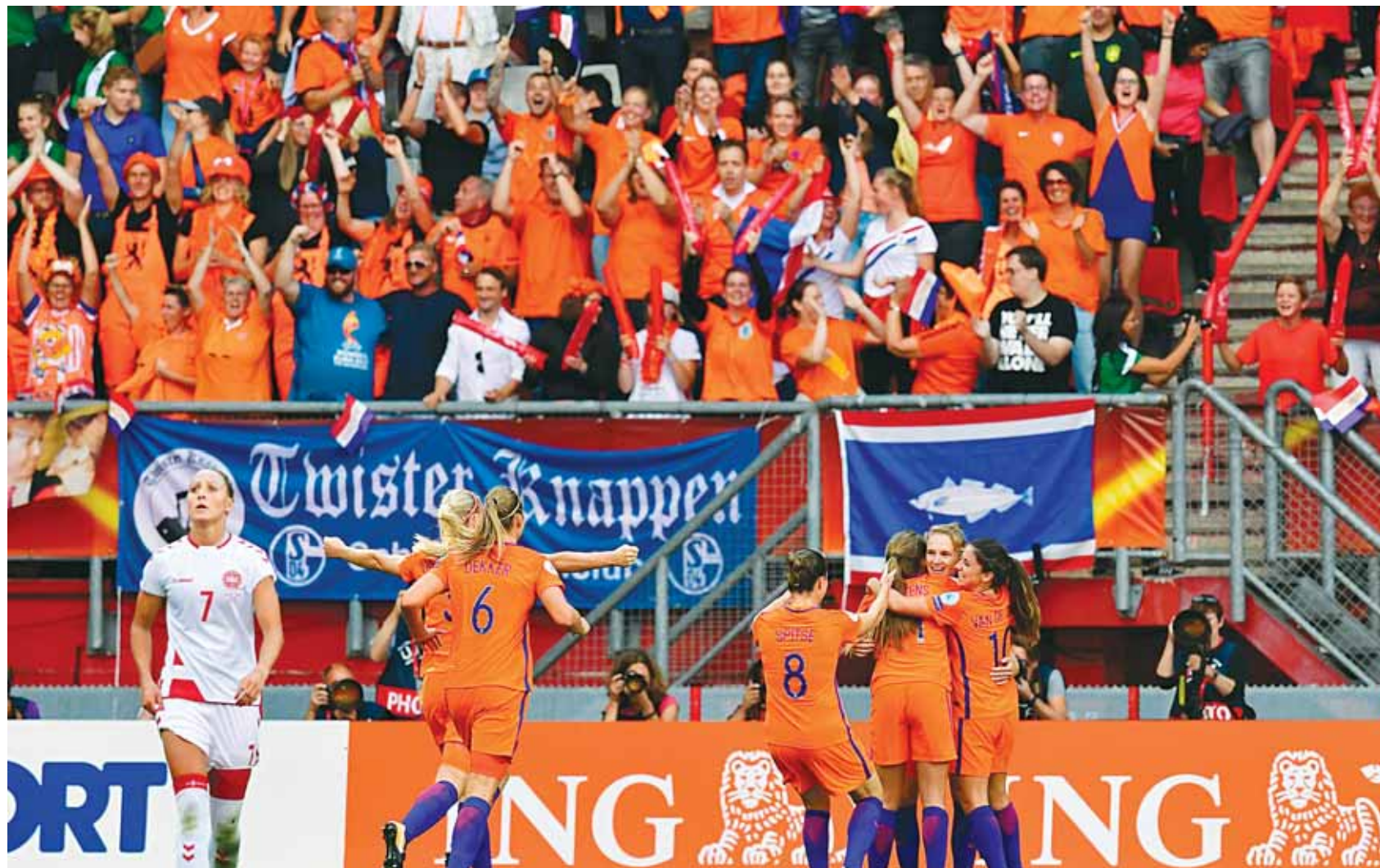
File picture of Netherlands' forward Vivianne Miedema (2nd R) celebrating with teammates after scoring a goal during the UEFA Women's Euro 2017 final.

'We did wonder how big the tournament would be. We knew it would depend on how we performed, but we could hardly have dreamed it would be this big'