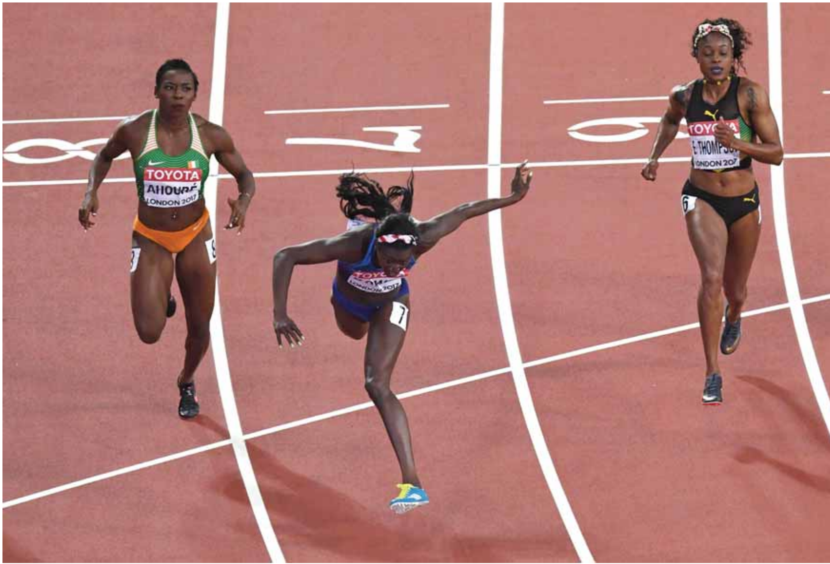
DIP TRICK: US athlete Tori Bowie (C) crosses the finish line next to Ivory Coast's Murielle Ahoure (L) and Jamaica's Elaine Thompson to win the final of the women's 100m at the 2017 IAAF World Championships in London on Sunday.

Bowie, 26, had improved from bronze at the last worlds in 2015 to silver at the Olympics, and on Sunday took the final step to the top of the podium