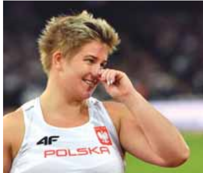
Poland's Anita Wlodarczyk celebrates after winning the women's hammer throw yesterday.

the American favourites in the men's shot put, while Kenya's Geoffrey Kirui and Kenya-born Bahraini Rose Chelimo came from behind to win the marathons on London's iconic Tower Bridge. Bowie, 26, had improved from bronze at the last worlds in 2015 to silver at the Olympics, and on Sunday took the final step to the top of the podium. She clocked 10.86 seconds, dipping across the line just ahead of Ta Lou.