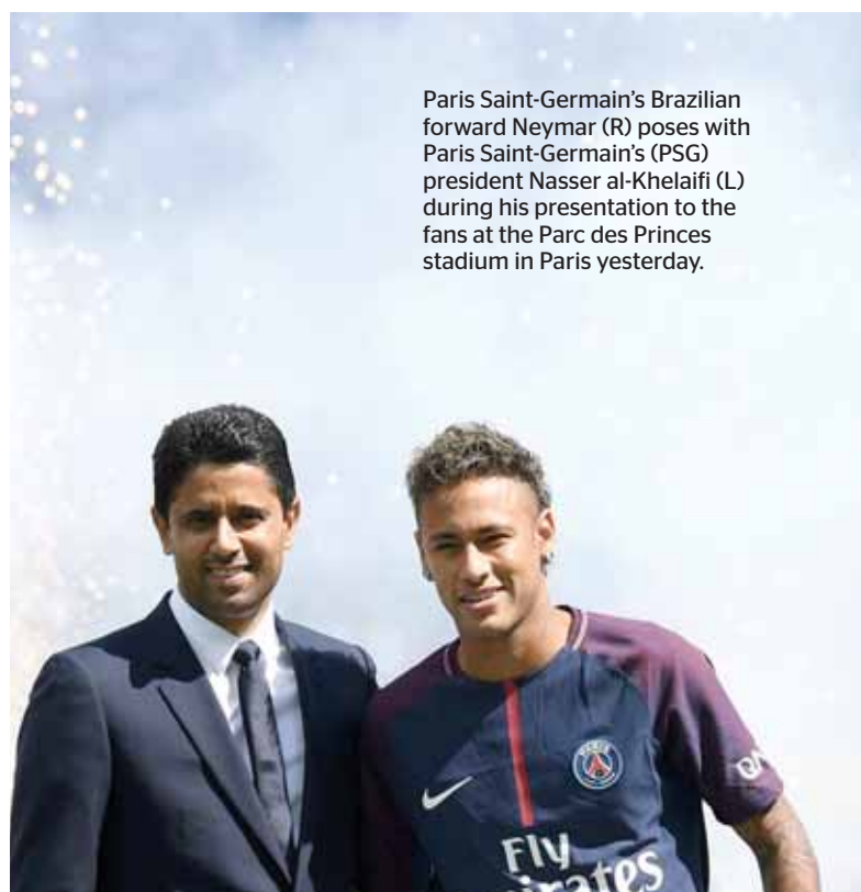
Paris Saint-Germain's Brazilian forward Neymar (R) poses with PSG president Nasser al-Khelaifi (L) during his presentation to the fans at the Parc des Princes stadium in Paris yesterday.

ani opened the scoring three minutes before the break with Javier Pastore notching the second 10 minutes from time of a one-sided affair.