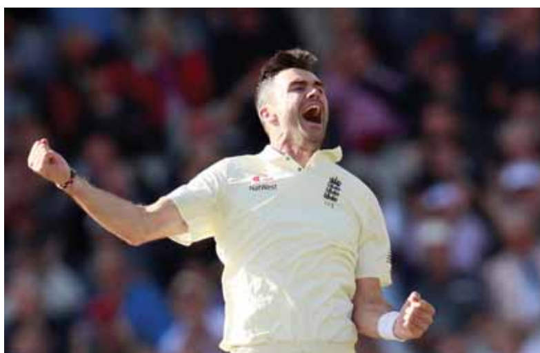
England's James Anderson celebrates the wicket of South Africa's Faf du Plessis on second day of the fourth Test at Old Trafford in Manchester yesterday.

full-length delivery from Anderson but was undone by the movement and edged to England skipper Joe Root at second slip.