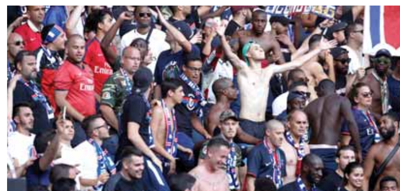
Paris Saint-Germain fans cheer during their Ligue 1 opener against Amiens yesterday in Paris.

There was a festive atmosphere and an almost casual confidence amongst the PSG players that the goals would come as they wove intricate patterns