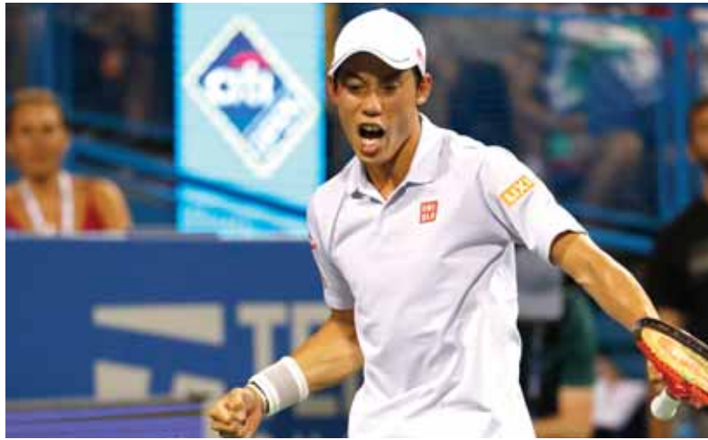
Kei Nishikori of Japan celebrates his win over Tommy Paul (not pictured) of the United States at the Citi Open in Washington DC on Friday.

Saturday's other semi-final sends US eighth seed Jack Sock — a 7-5, 6-4 winner over Canadian third seed Milos Raonic — against South African 15th seed Kevin Anderson, who blasted 21 aces to de-