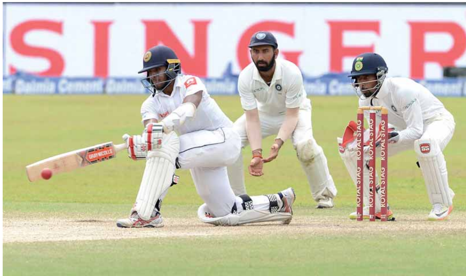
Sri Lanka's Kusal Mendis (left) plays a shot as Indian wicketkeeper Wriddhiman Saha (right) and Cheteshwar Pujara (centre) look on on third day of the second Test at the Sinhalese Sports Club (SSC) Ground in Colombo yesterday.

Hosts were 209 for two at close, still trailing India by 230 runs