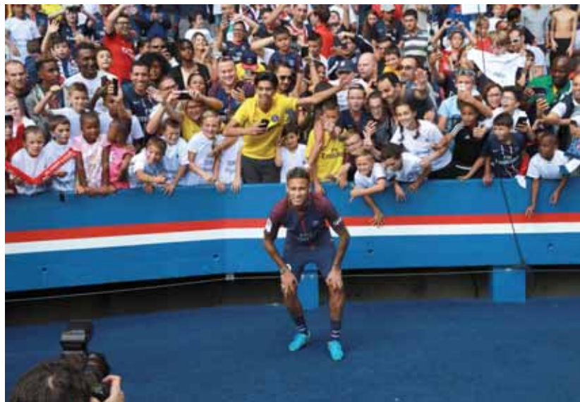
Paris Saint-Germain's Brazilian forward Neymar during his presentation to the fans at the Parc des Princes stadium in Paris yesterday.