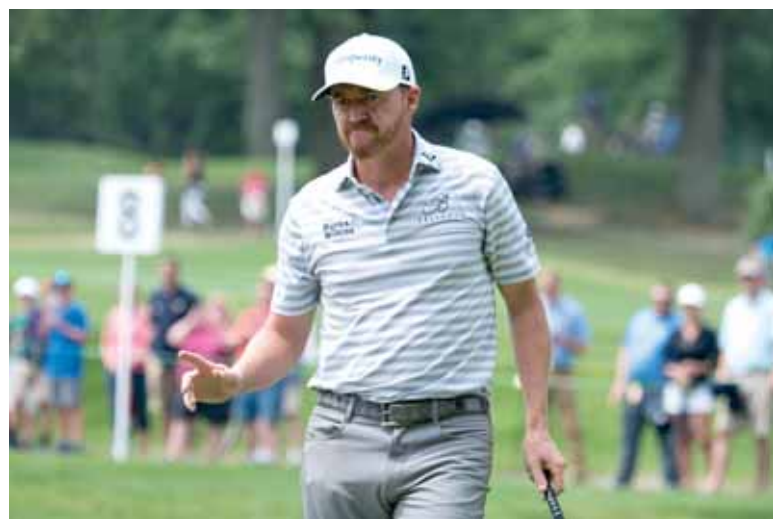
Jimmy Walker acknowledges the crowd after making his putt on the eighth hole during the second round of the WGC-Bridgestone Invitational golf tournament in Akron, Ohio, on Friday.

"I played decent," Pieters said. "I hit plenty of greens - I think a bit less than yesterday. The driver was still a little bit off. Ball striking's been good, same today. Missed a couple short ones on 17 and 18, but rolling the putter nicely, so looking forward to this weekend."