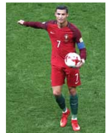
TOWARDS ENGLAND! File picture of Cristiano Ronaldo.

the latest in a series of high-profile players to be investigated over their image rights in recent years, Ronaldo believes he is being targeted due to his fame.