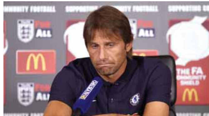
Chelsea manager Antonio Conte during the press conference.