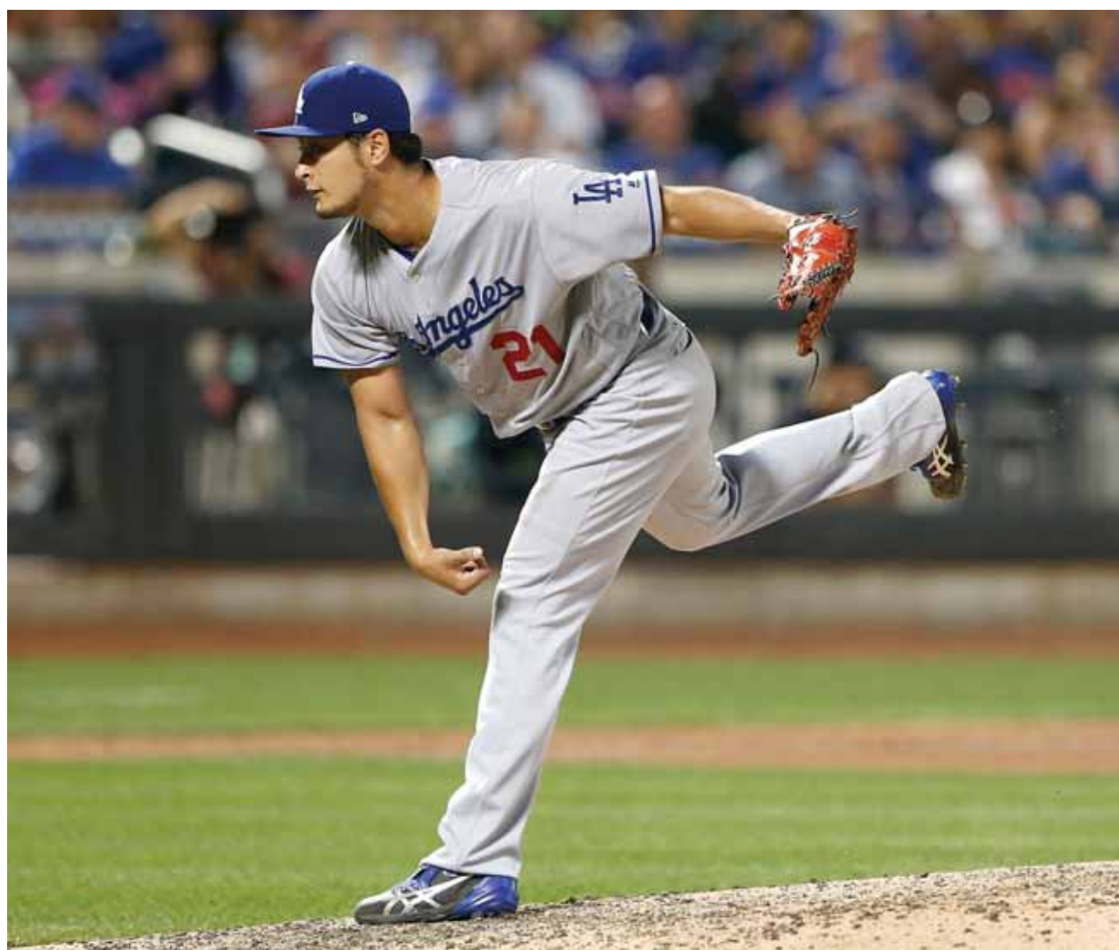
Los Angeles Dodgers starting pitcher Yu Darvish pitches against New York Mets in the seventh inning at Citi Field.

Darvish had not answered those questions when Friday began. He harboured some nerves about joining a new team, he admitted. But he also fretted about his