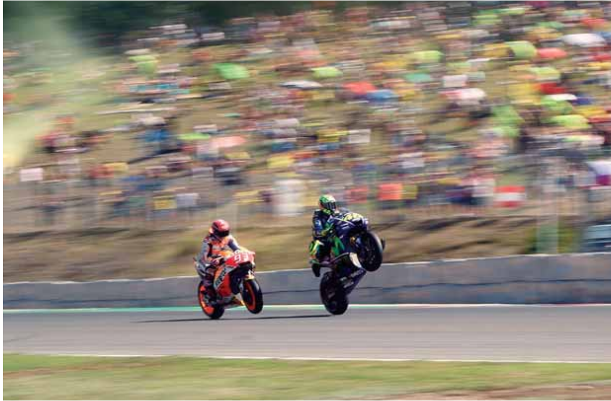
Repsol Honda rider Marc Marquez (left) and Movistar Yamaha rider Valentino Rossi do wheelies during the qualification round for the Czech MotoGP in Brno yesterday.

In the tightest title battle since the points system was changed in 1993, the 38-year-old Rossi is still in the hunt for