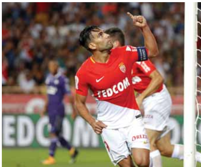
Monaco's Radamel Falcao celebrates scoring their second goal.

Toulouse threatened to spoil the party by twice taking a shock lead, the first on six minutes.