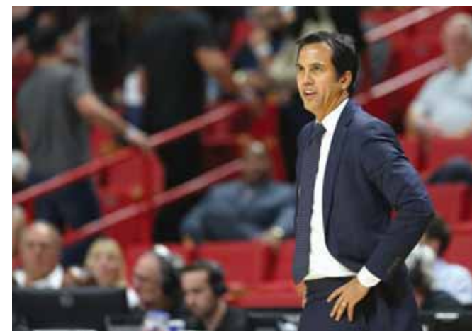
File picture of Miami Heat head coach Erik Spoelstra.