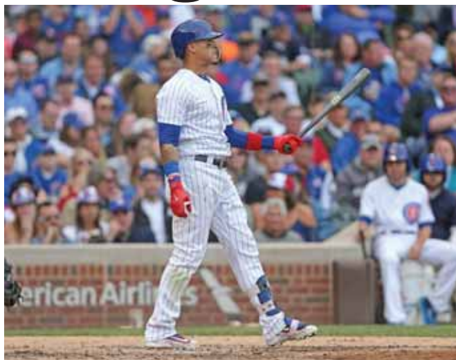
Chicago Cubs shortstop Javier Baez (9) reacts to striking out during the ninth inning against the Washington Nationals at Wrigley Field.

Arch-nemesis Daniel Murphy cranked a pair of home runs