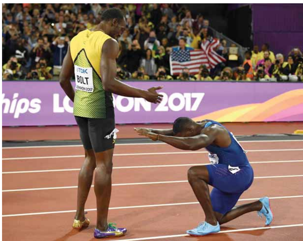
RESPECT: Justin Gatlin of the US bows to third placed Usain Bolt of Jamaica after winning the 100m sprint at the World Championships yesterday. It was the first ever defeat for Bolt in a major event.

The evening was all supposed to be about the 30-year-old Bolt claiming a