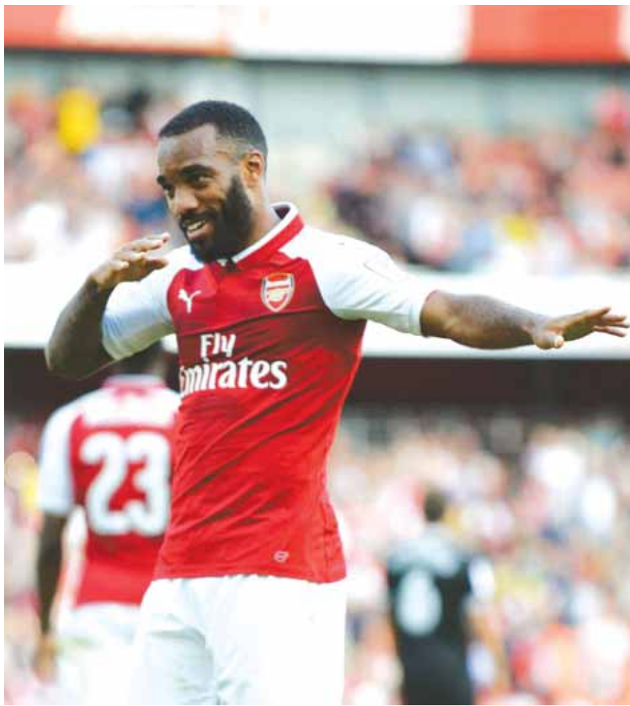
File picture of Spain and Chelsea striker Alvaro Morata (L) and Arsenal attacker Alexandre Lacazette. The duo will face each other in today's Community Shield match.