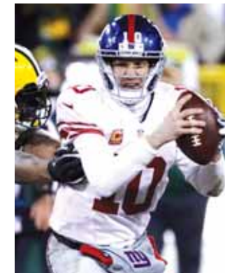
File picture of New York Giants' Eli Manning.

The move falls into place with McAdoo's summer-long plan to rest players when he can. Jason Pierre-Paul was given a day