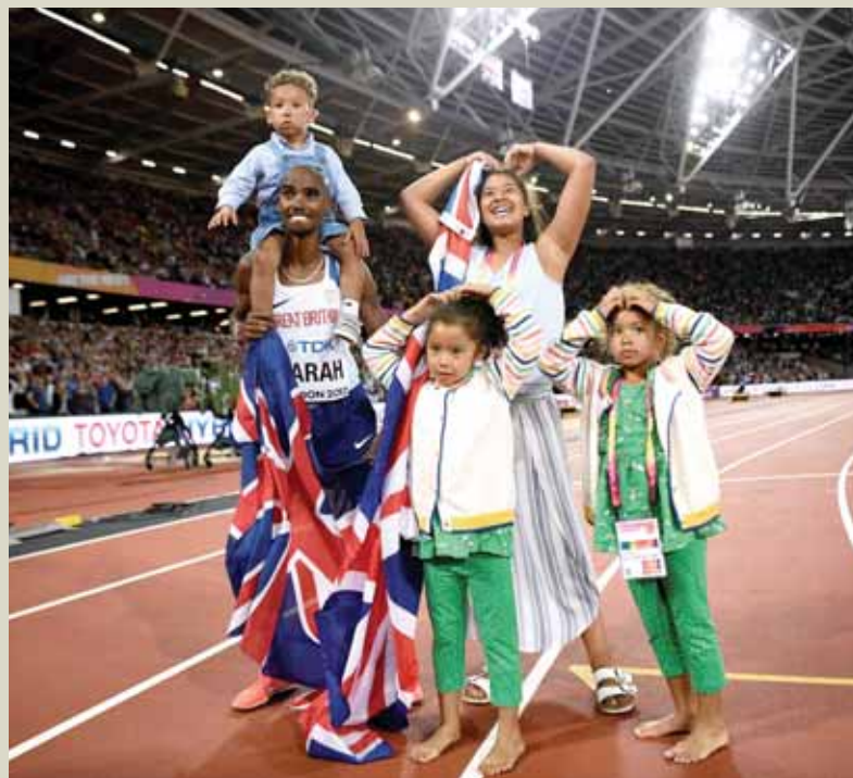
Mo Farah with his children after his 10,000m win on Friday.

Ultimately, though, he would not be ruffled, winning his 10th successive global track title in world championships and Olympics with his fastest-ever championship 10,000m run, 26 minutes 49.51 seconds, the quickest in the world this year.