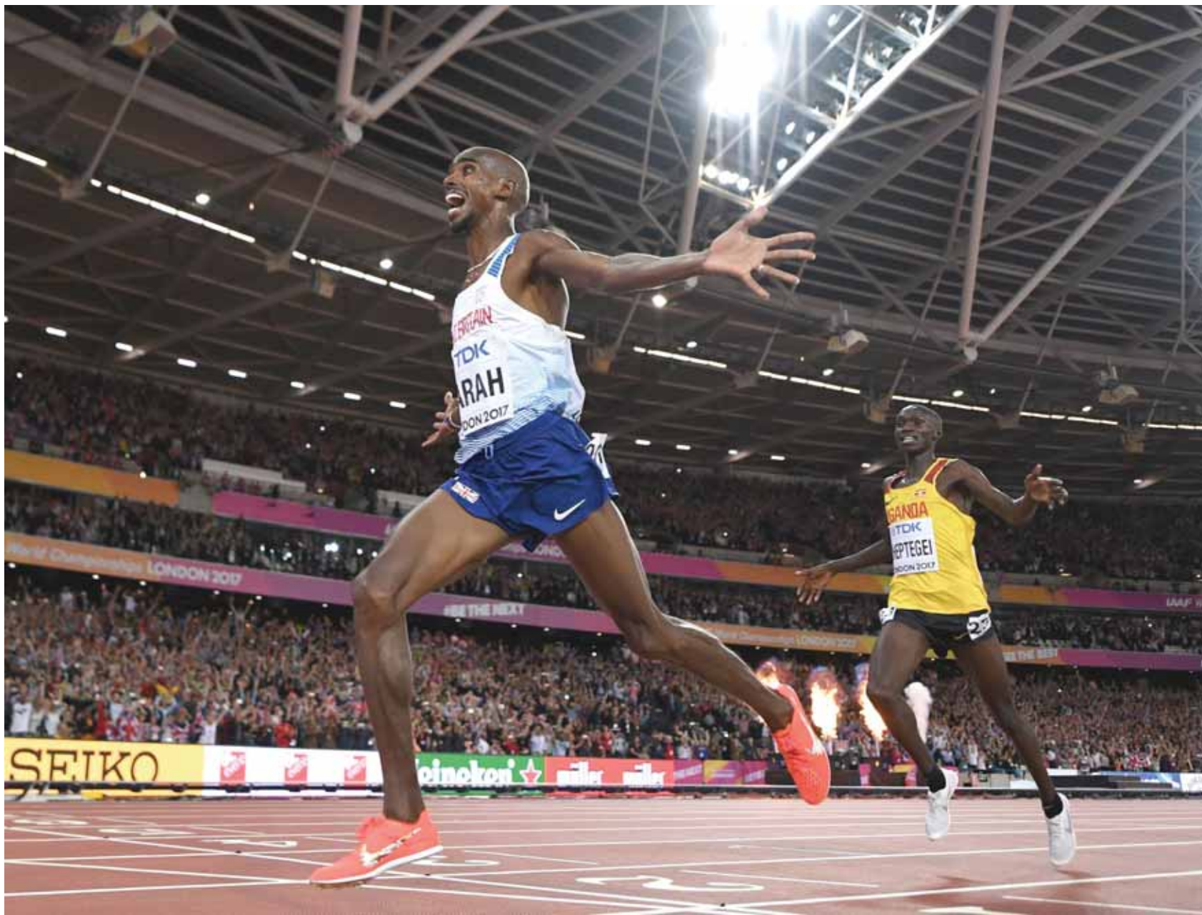
Britain's Mo Farah wins the final of the men's 10,000m athletics event at the 2017 IAAF World Championships at the London Stadium in London on Friday night.

'It was one of the toughest races of my life. With one lap to go I nearly get tripped, twice, that was hard. But I just had to be mentally stronger and think I didn't work this hard for nothing'