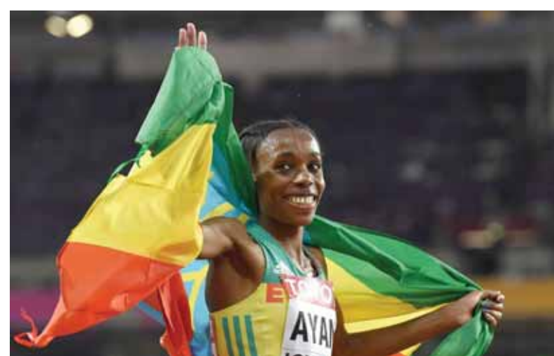
Ethiopia's Almaz Ayana celebrates winning the final of the women's 10,000m athletics event at the 2017 IAAF World Championships in London yesterday.

Starting in lane four, Bolt was incredibly slow to react out of the blocks, the 100 and 200m world record holder behind Coleman in the lane outside from the off. The crowd, on their feet, roared, and so Bolt responded as he has so many times before. After 50 metres, he moved into his famed "drive phase", head coming slowly up as part of the process that