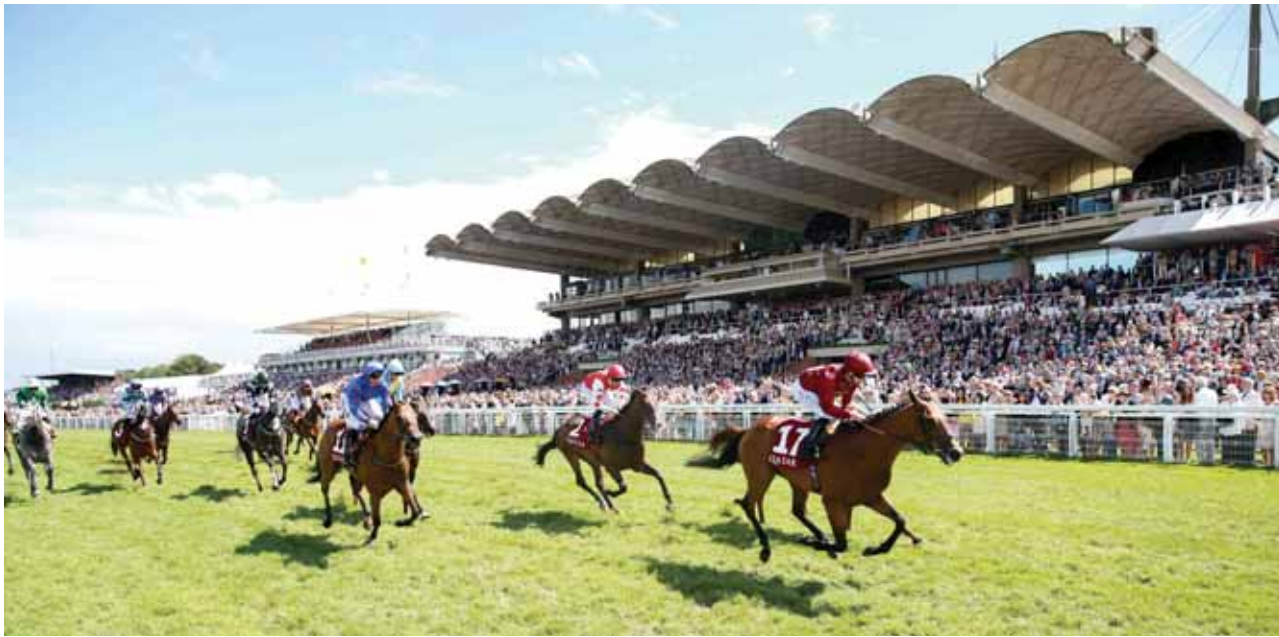
Jockey Oisín Murphy (right) rides Qatar Racing's Scorching Heat to victory in the Qatar Stewards' Sprint Handicap at Qatar Goodwood Festival yesterday.

JOHNSTON IS LEADING TRAINER However, it was Mark Johnston who won