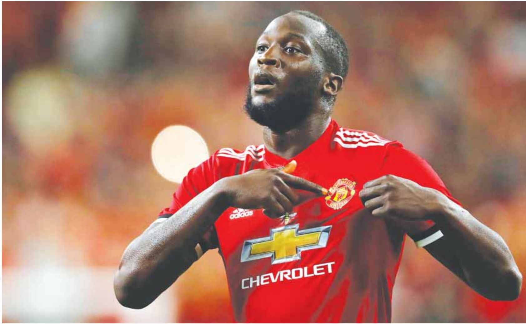
File picture of Manchester United forward Romelu Lukaku celebrating after scoring a goal during the International Champions Cup match against Manchester City.

'It's truly incredible to see his strength, power and the intelligence he possesses. We hope it is a good year for him and the team'