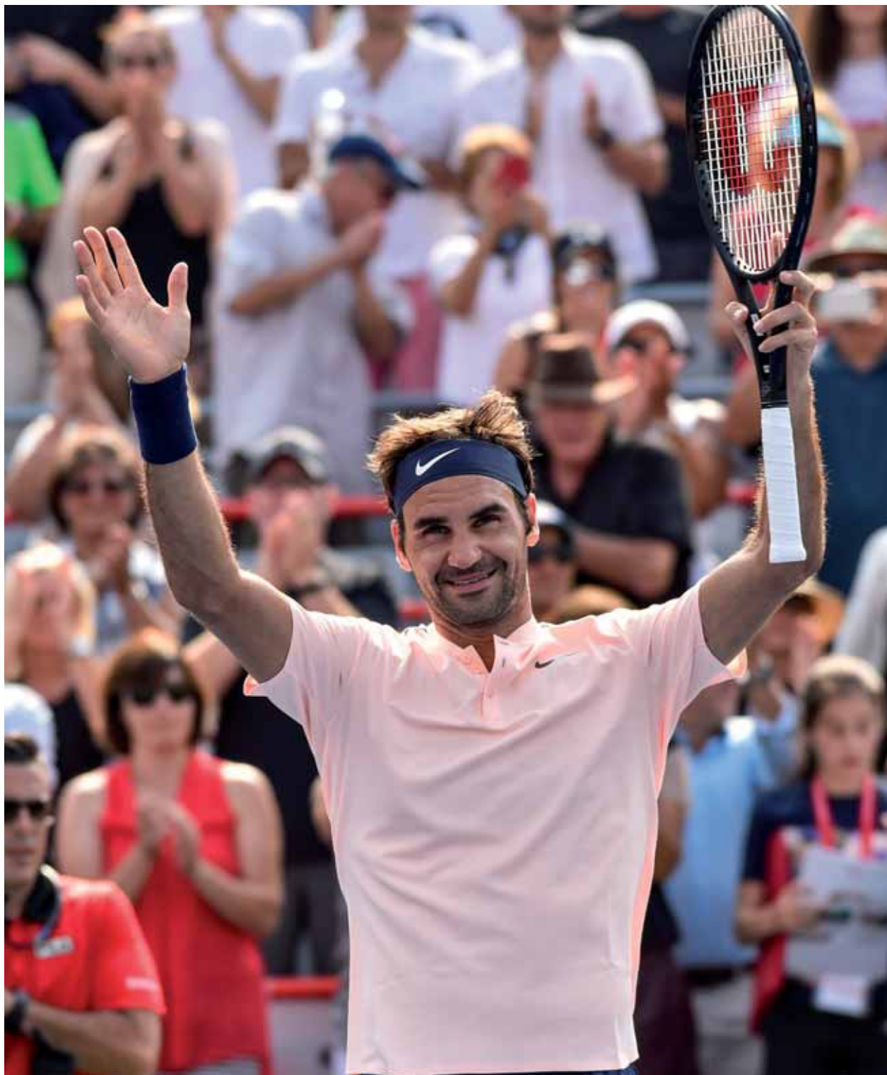
Roger Federer of Switzerland celebrates his victory over Roberto Bautista Agut of Spain during day eight of the Rogers Cup presented by National Bank at Uniprix Stadium in Montreal on Friday.

'It pays off playing aggressively here in Montreal, plus I feel comfortable at net, so why not spend some time there instead of slugging it out from the baseline'