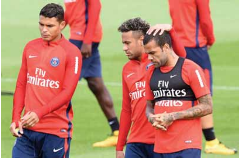
PSG's Brazilian forward Neymar (C) with teammates during a training session.

"After first giving up his No.10 shirt, will he (Pastore) now give him (Neymar) his place in the team?" one Le Parisien headline asked of the player who took up the No.10 shirt after Zlatan Ibrahimovic left last season, only to hand it to the Brazilian this season.