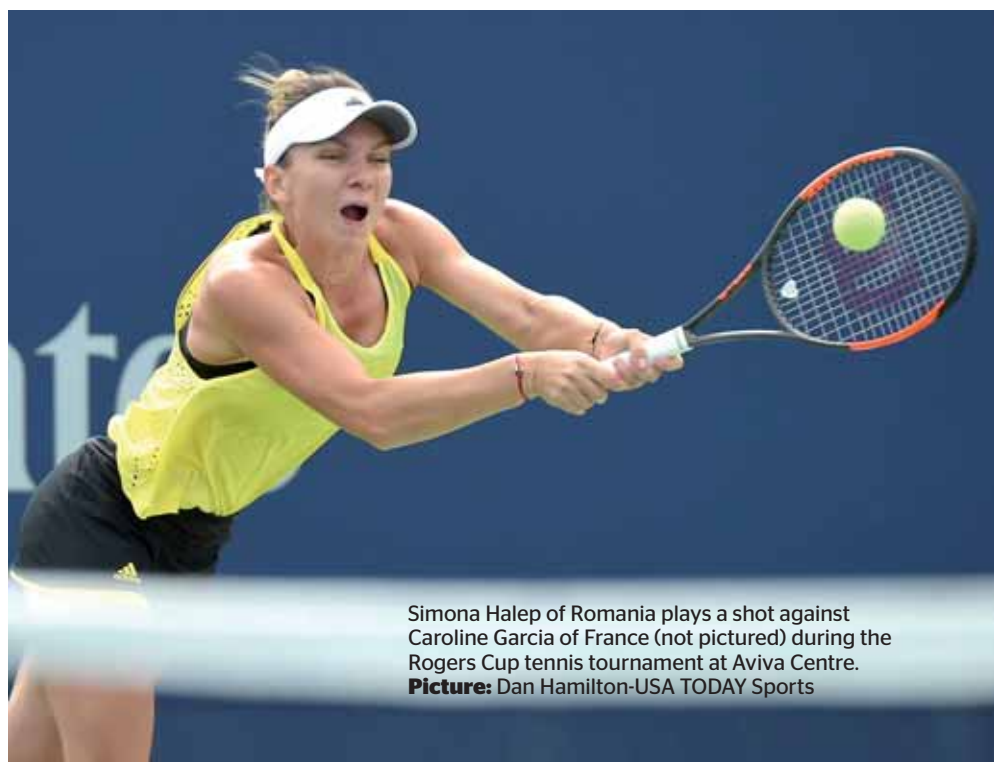
Simona Halep of Romania plays a shot against Caroline Garcia of France (not pictured) during the Rogers Cup tennis tournament at Aviva Centre.

"Yesterday was really tough, waiting like six or seven hours here on site so I was a little bit tired," Halep said. "But I came