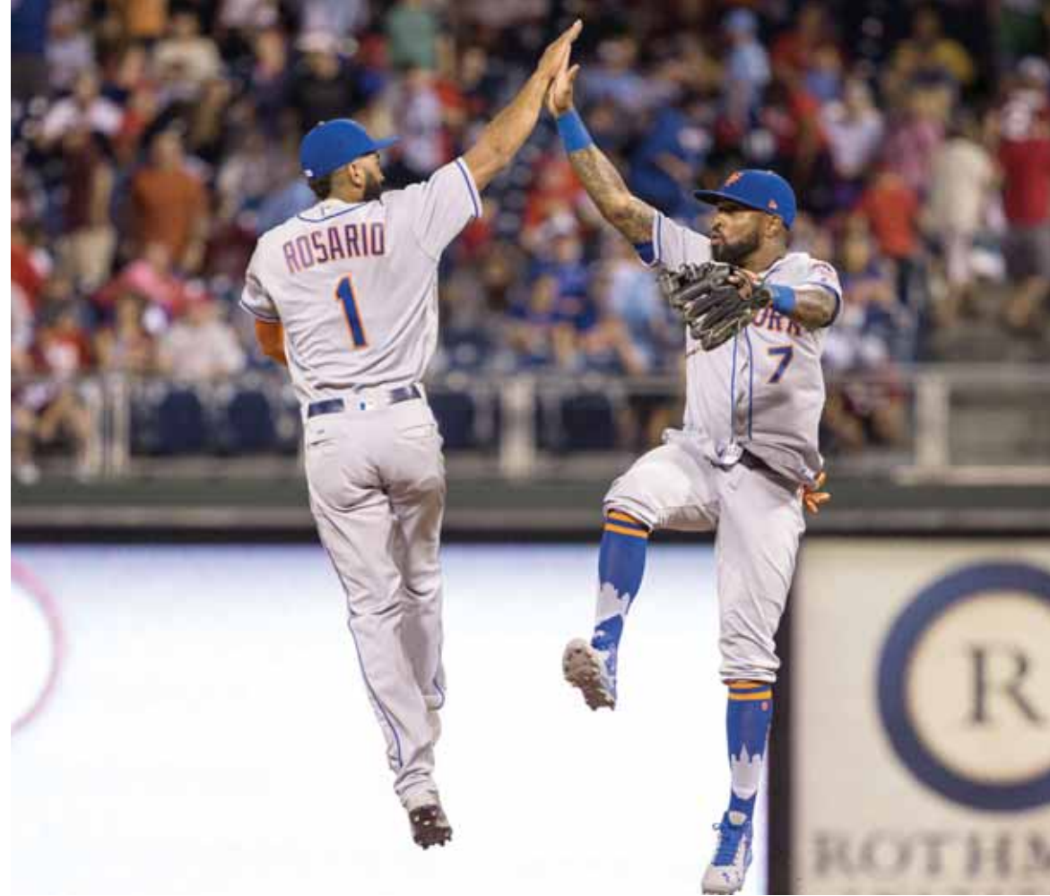
New York Mets shortstops Amed Rosario (left) and Jose Reyes celebrate their victory against the Philadelphia Phillies at Citizens Bank Park in Philadelphia, Pennsylvania, on Thursday.

"It's always command," manager Pete Mackanin said. "He didn't command his fastball. He didn't have command of his breaking stuff. It's always mistakes out over the plate. He was behind a lot. The answer is always