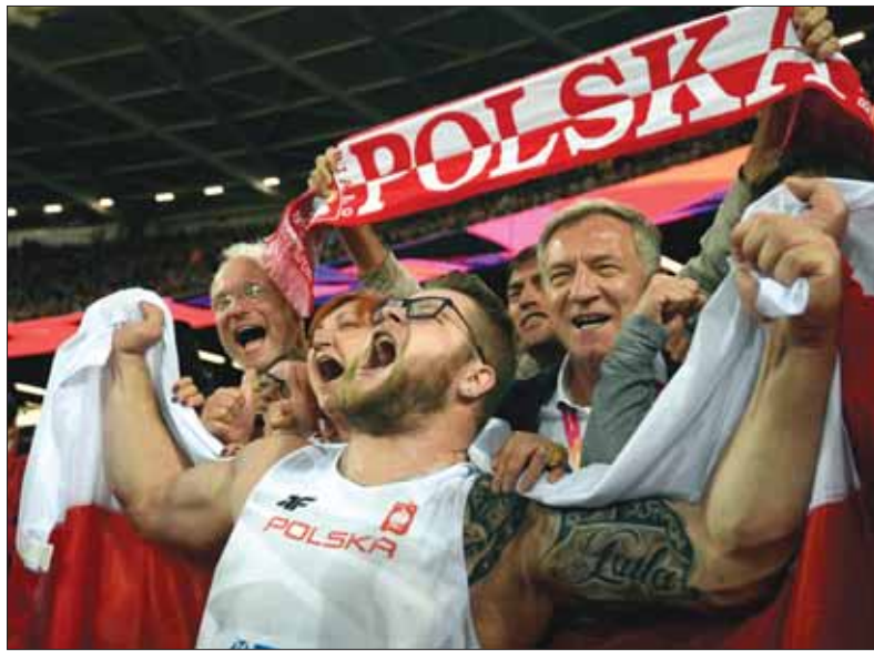
Pawel Fajdek of Poland celebrates after winning gold in the men's hammer throw final in London on Thursday.

"I've waited for this competition at this stadium for five years," he said, re-