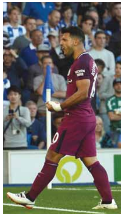
Man City's Sergio Aguero celebrates scoring against Brighton yesterday.

Manchester City manager Pep Guardiola had some £150 million of new recruits on display at Brighton, but it took the pre-season favourites until the 70th