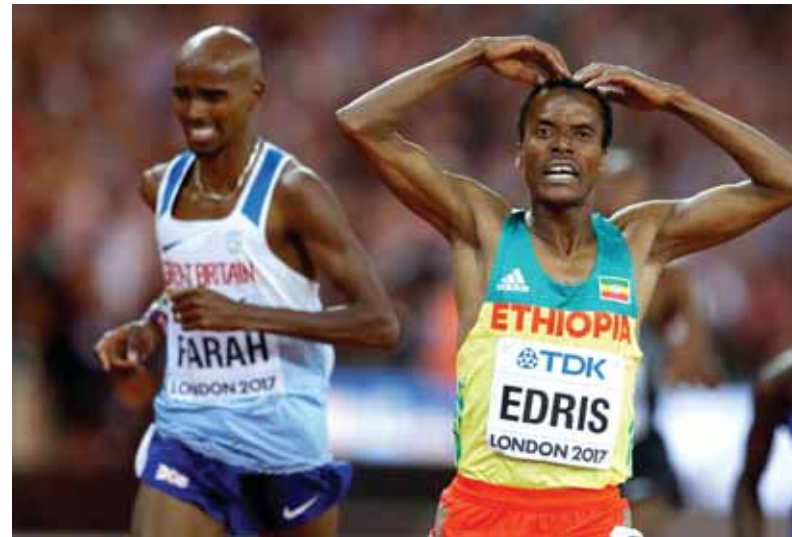
Muktar Edris (right) of Ethiopia celebrates winning the men's 5,000m final ahead of Mo Farah of Great Britain in London yesterday.