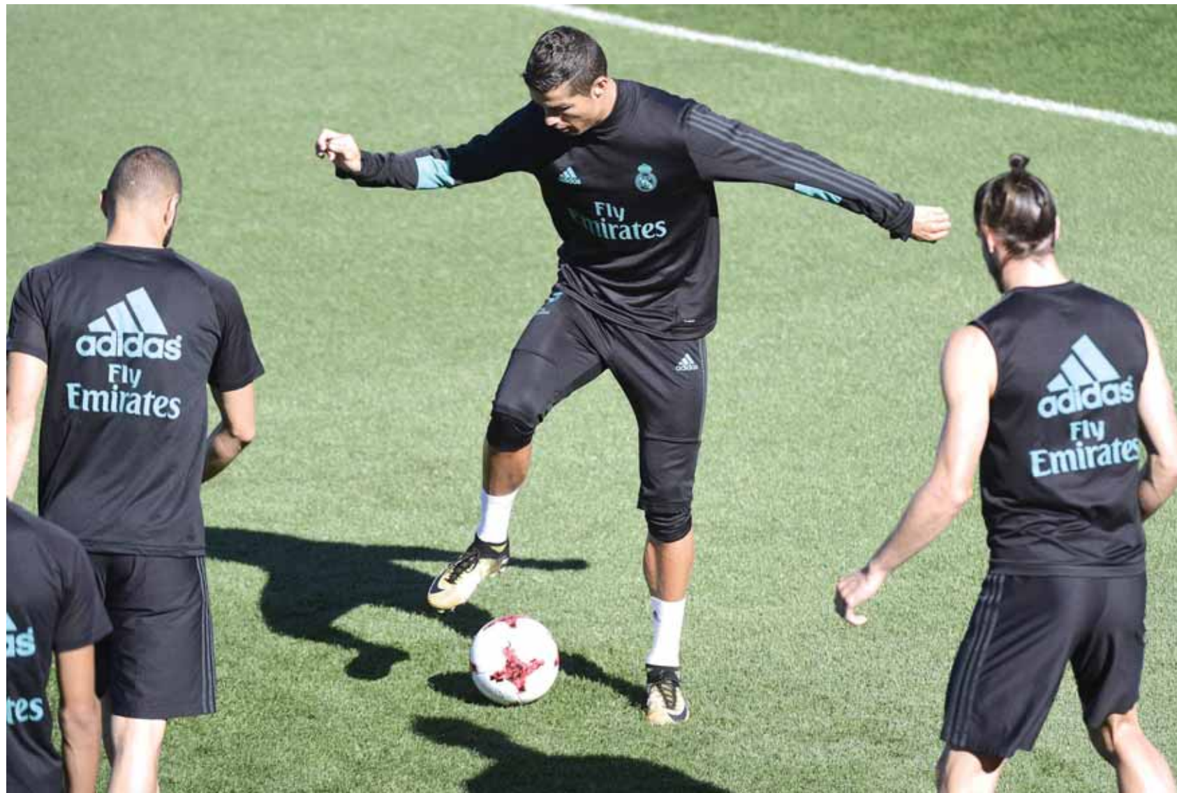
WE'RE READY FOR BARCA: Real Madrid's Portuguese forward Cristiano Ronaldo (C) takes part in a training session at Real Madrid sport city in Madrid yesterday.

'We've had a good pre-season and we are coming into the game in good condition. But on Sunday the real thing starts, with a competitive game and a title at stake...'