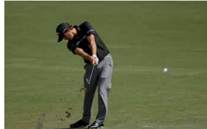
Kevin Kisner of the United States.