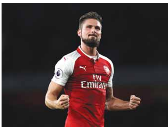
File picture of Arsenal's Olivier Giroud celebrating yesterday.

"He decided to stay and it was one of the great days of recent