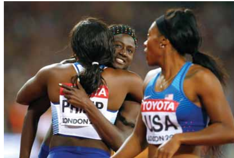
Tori Bowie (centre) of the US is congratulated by Asha Philip (left) of Great Britain after the US victory in the women's 4x100m final yesterday.

Dawn Harper Nelson, who won gold at the 2008 Olympics and was one of four Americans in the final, took silver in 12.63 ahead of Germany's Pamela Dutkiewicz (12.72).