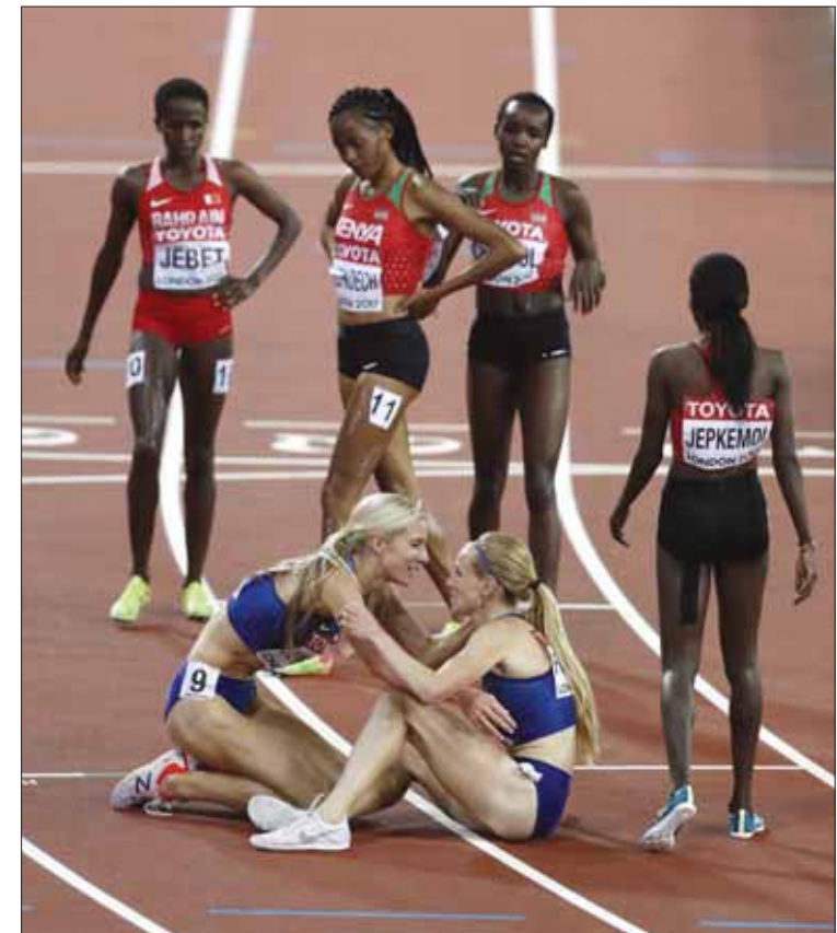
US athletes Emma Coburn (foreground, left) celebrates with compatriot Courtney Frerichs (foreground, centre) after winning the women's 3,000m final in London on Thursday.

"I felt like the crowd gave me a lot of energy and lifted me to my greatest ever performance."