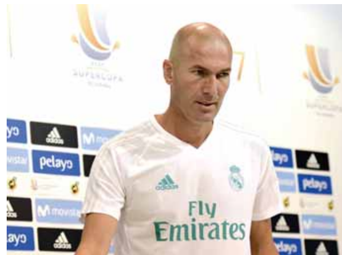
Real Madrid's French coach Zinedine Zidane.