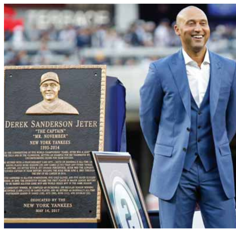
In this May 14, 2017, picture, former New York Yankees shortstop Derek Jeter laughs during a pre-game ceremony to retire his jersey number and unveil his monument park plaque before the game against the Houston Astros at Yankee Stadium in Bronx, New York.

"Great players don't always translate to great executives, as we've seen," CC Sabathia said in April, "so we'll have to wait and see what happens for him. Like I said, he's wanted to do this, he's very capable of doing this. We'll have to see how it plays out... but I think Jeter has a lot to offer."