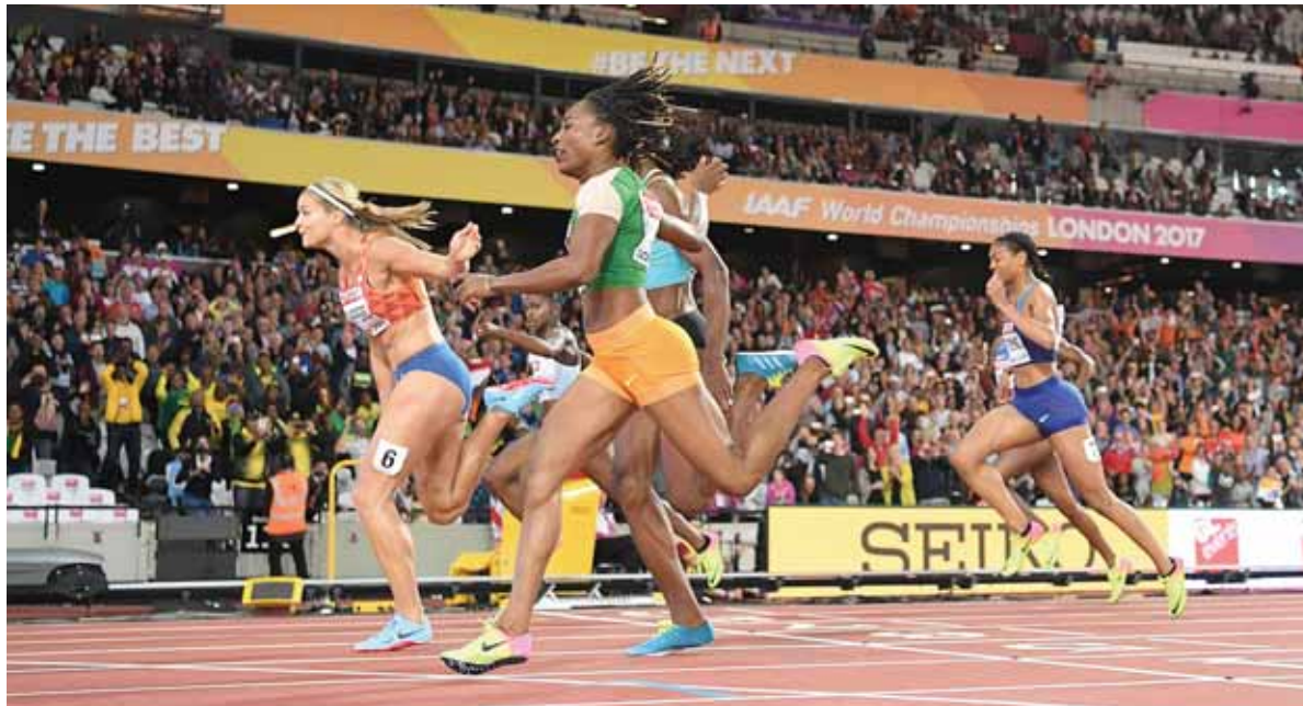
Dafne Schippers (left) of the Netherlands crosses the finish line to win the women's 200m final at the 2017 IAAF World Championships in London on Thursday.

"Yes, sprinters are more like gladiators but I don't really miss the heptathlon. I like to beat the tough girls," she told The Guardian last year.