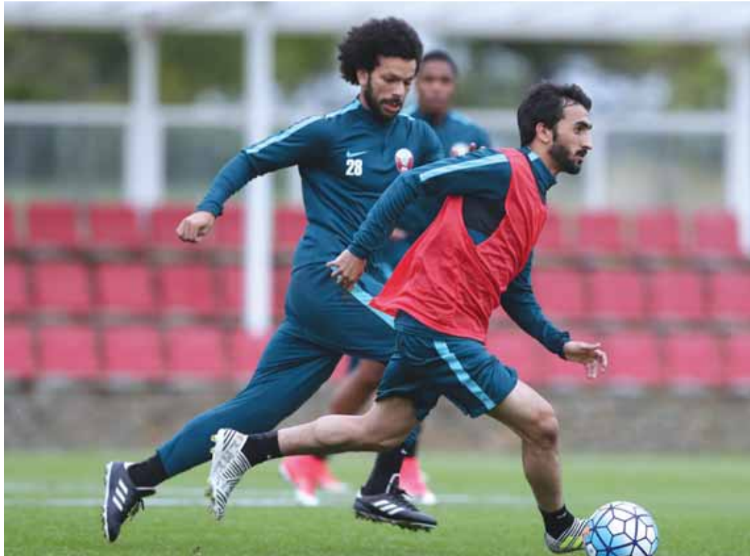
Qatar national team players during a training session. The Maroons are currently attending a camp in London in preparation for their upcoming 2018 World Cup qualifiers against Syria (August 31) and China (September 5).