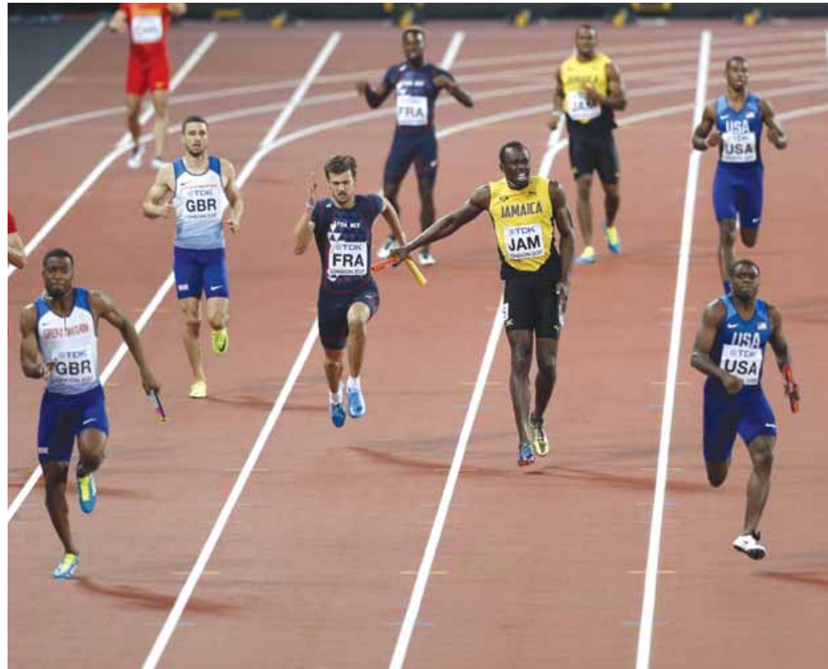
Jamaica's Usain Bolt pulls up injured in the men's 4x100m final as Nethaneel Mitchell-Blake (left) races to victory for Great Britain at the 2017 IAAF World Championships in London yesterday.

"I gave it my all, 110%," said Farah. "I don't think there was any more I could have done. They (the Ethiopians) run as a team. "Never feel like you can't beat the Kenyans and Ethiopians - anything is