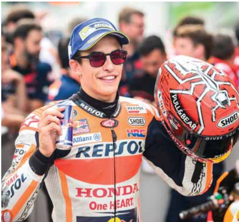
Repsol Honda's Marc Marquez celebrates after racing to pole in the qualifying session for Austrian MotoGP at Red Bull Ring in Spielberg, Austria, yesterday.