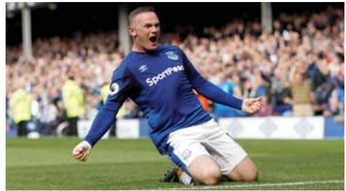
Everton's Wayne Rooney celebrates scoring yesterday.